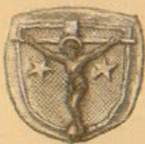
Rubbing from end of Crozier.