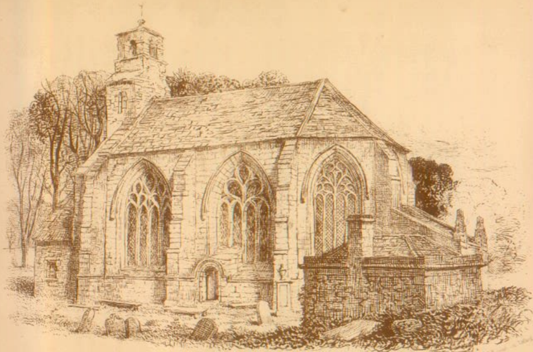
EXTERIOR OF THE CHOIR OF THE PARISH CHURCH OF MIDCALDER from the South East.