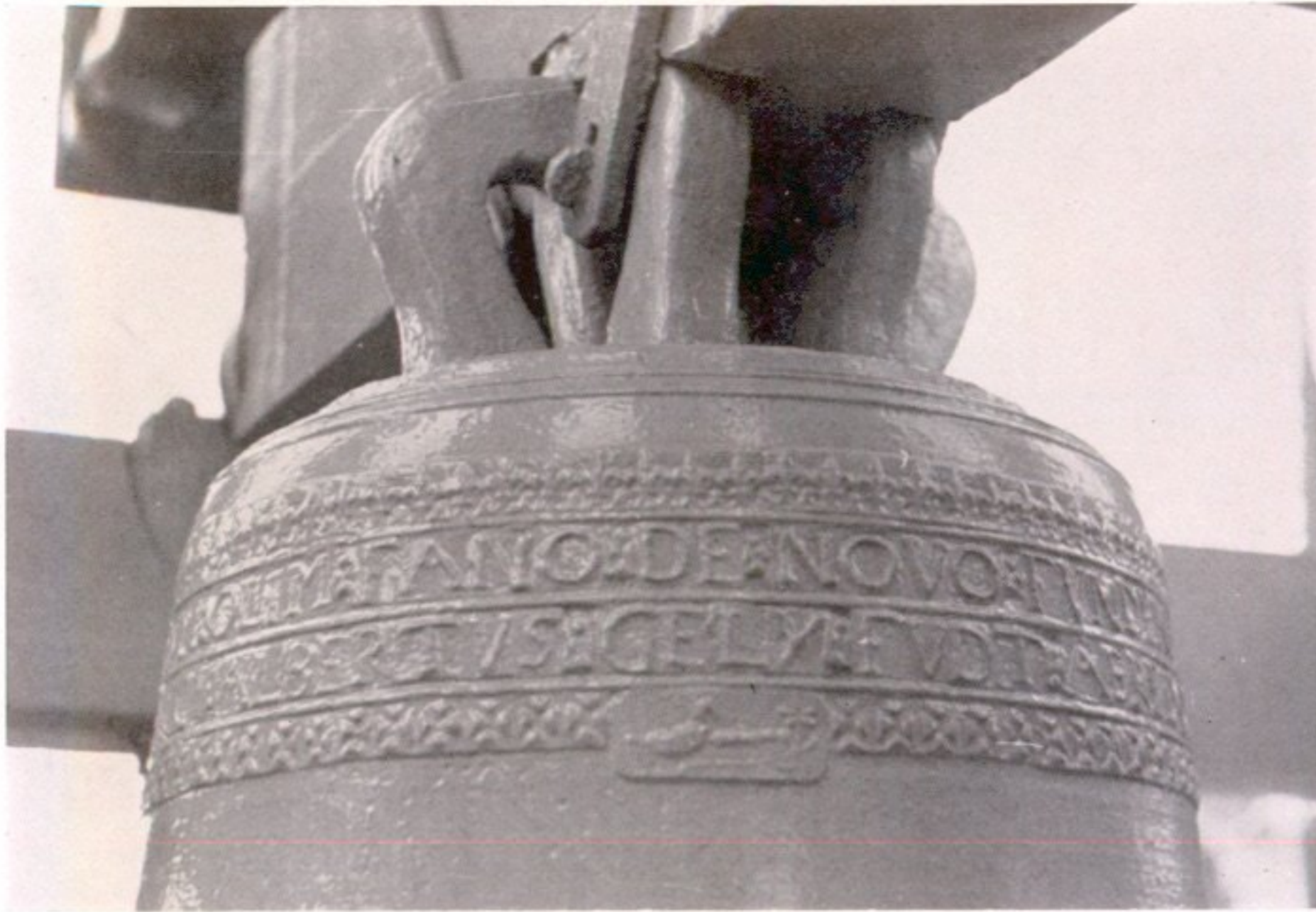
1. Marischal College, Aberdeen, bell of 1701. The surface has been painted