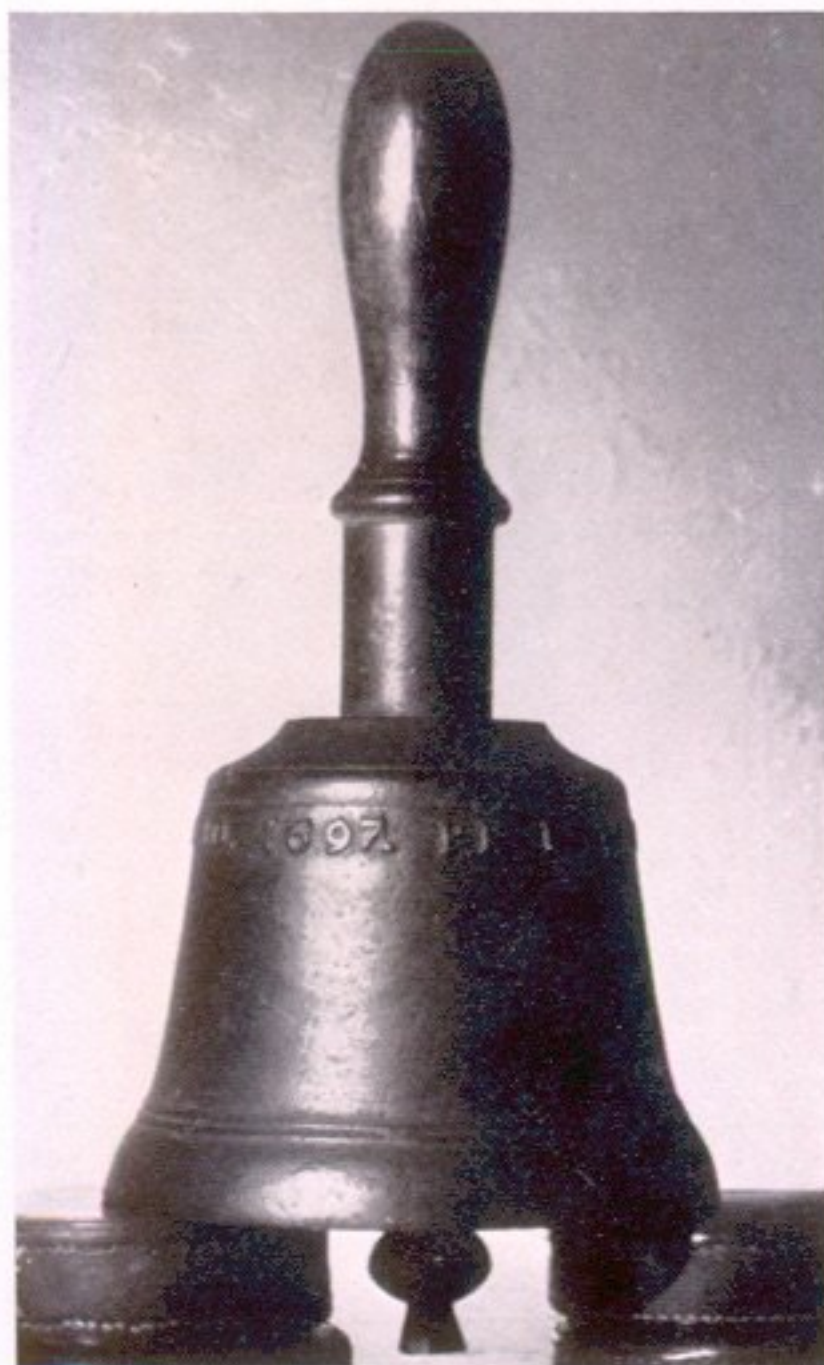
3. Aberdeen Town House. Bell of Master of Kirk Works