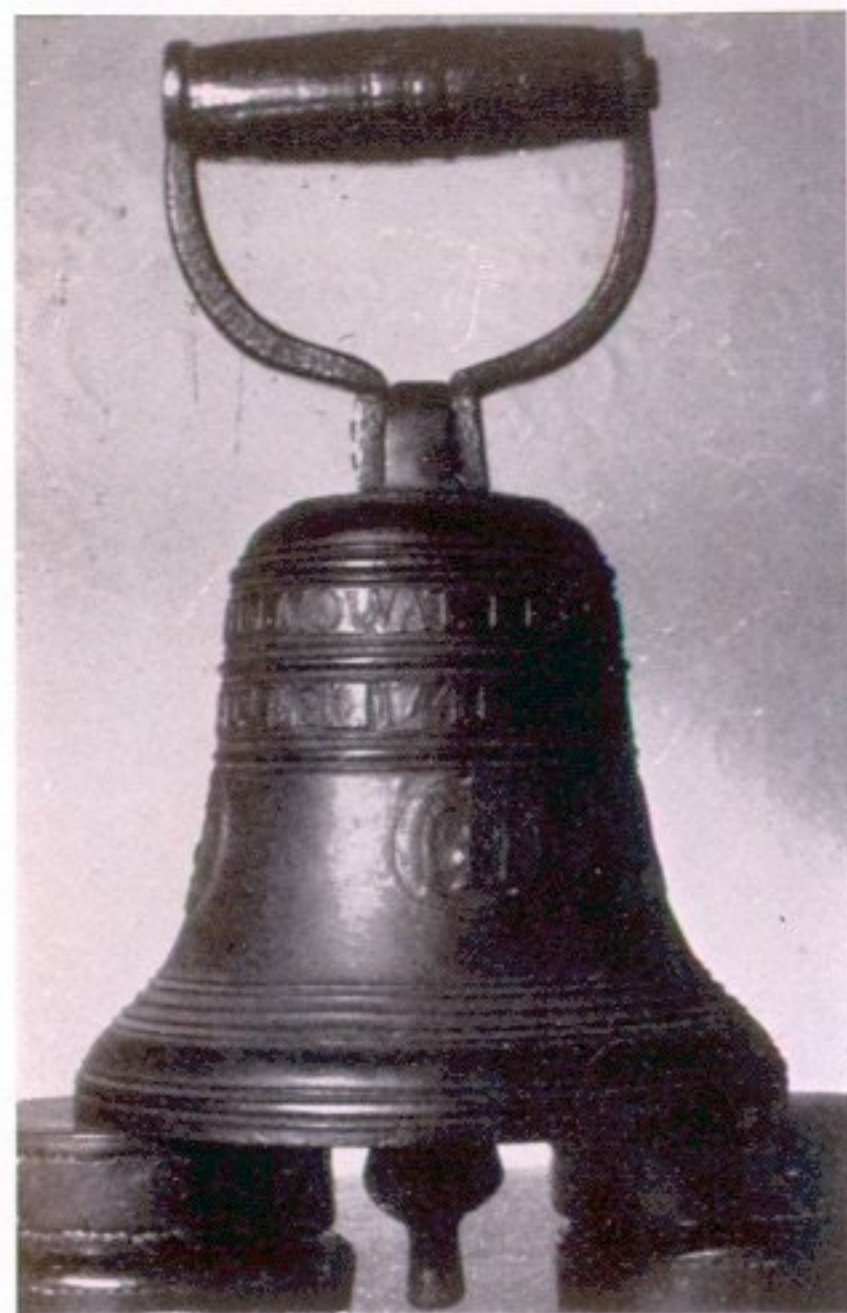
2. Old Aberdeen Town Crier's Bell