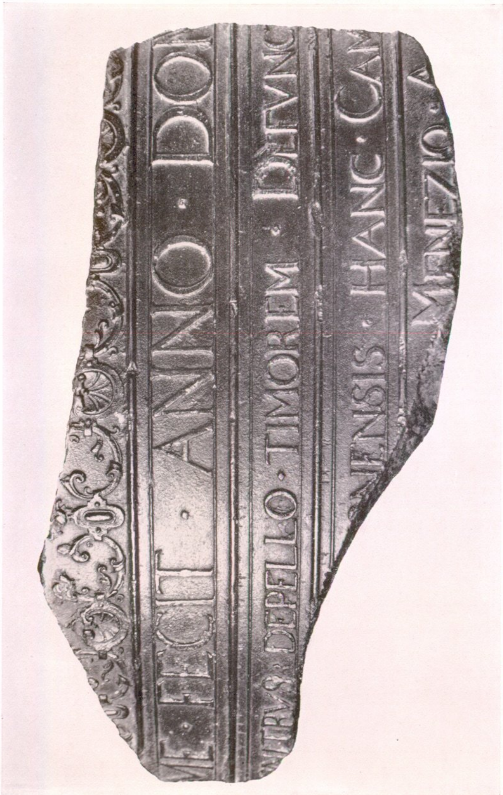
Part of the inscription band of Old Lowrie, cast by Michael Burgerhuys in 1634 and preserved in Provost Skene's house. The larger lettering is 1\frac{3}{16} inches high