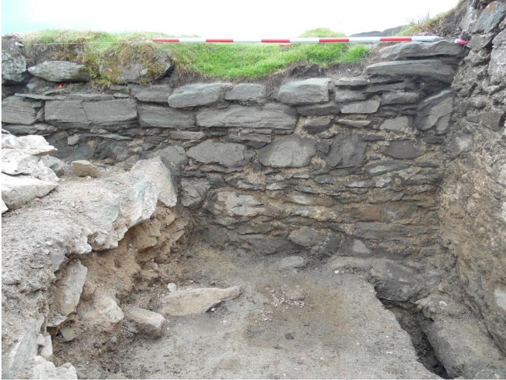
ILLUS S5 Internal Face of SE curtain wall in Trench 1. Note rubble coursing and large slab face blocks. Scale 2m/200mm.