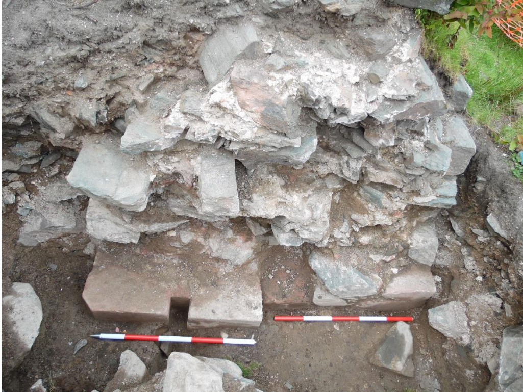
ILLUS S12 NW reveal of the outer bailey SW gate revealed by excavation. Note the dressed red sandstone external block with chamfered ariss and probable portcullis slot. Scales 2 x 1m/200mm.