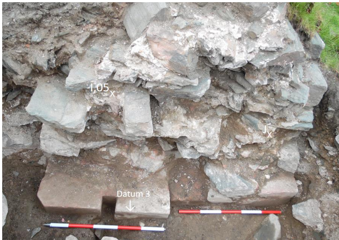
ILLUS S27 Locations of samples removed from the Outer Enclosure Gateway in SE Curtain Wall [043], revealed by Trench 3.