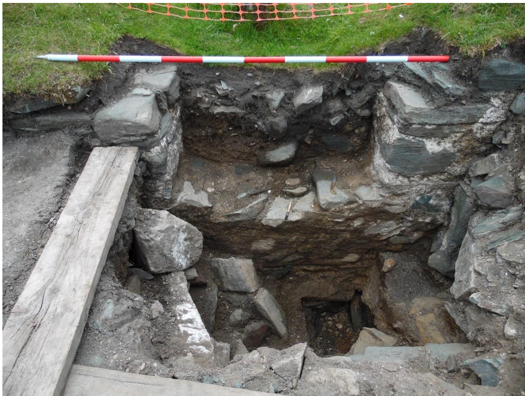
ILLUS S23 Intramural opening (probable doorway) in the SW wall of the inner bailey NE Range from the north-east. Scale 2m/200mm.