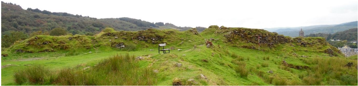
ILLUS S16 The cross-wall dividing the inner and outer baileys from the east.