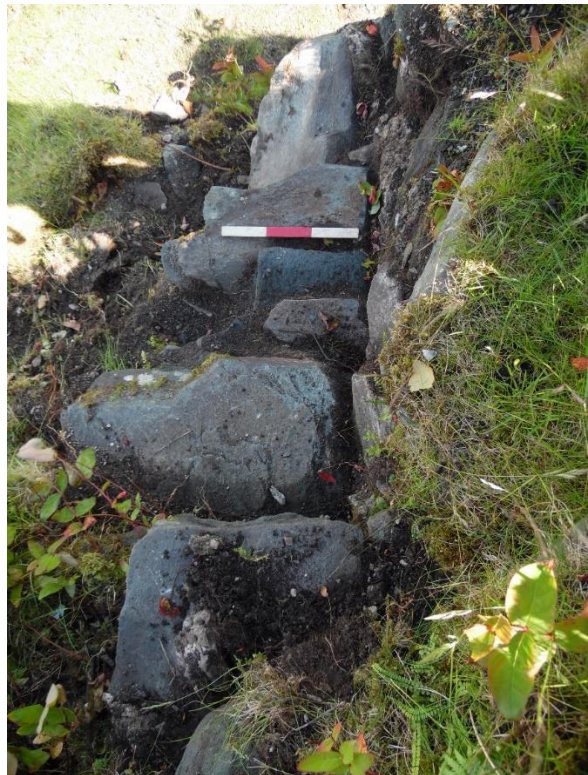
ILLUS S8 & S9 Straight Joint 2 from the north-east (left) and from above (right). The cross-wall clearly abuts the internal face of the inner bailey NW curtain wall, and this has aided its survival. Scales 300/100mm.