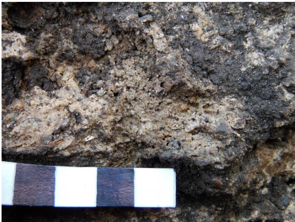
ILLUS S21 Mortar at face of crosswall exposed by excavation, partially obscured by soil. Scale 10mm.