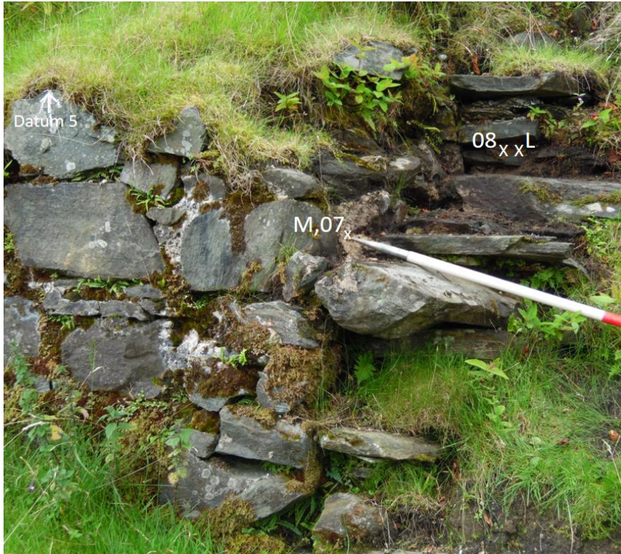
ILLUS S30 Locations of the samples removed from Abutment B.