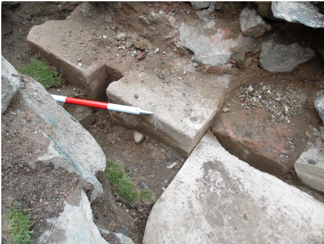
ILLUS S33 Datum 3; Wall [043].