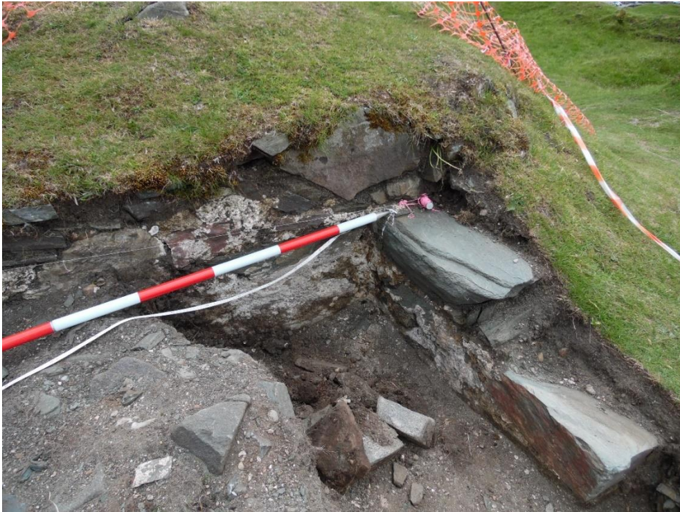
ILLUS S32 Datum 2; Wall [045].