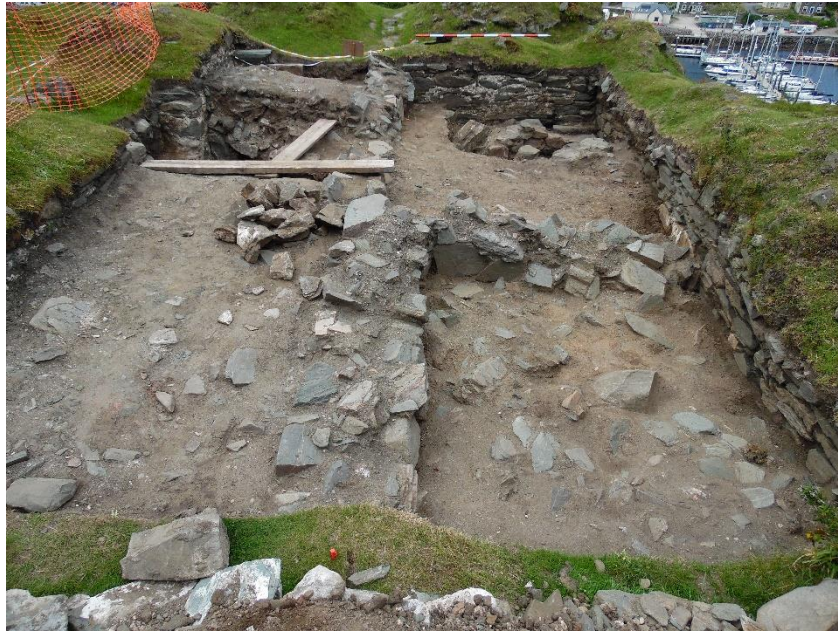
ILLUS S22 Part of inner bailey NE range exposed from the south-east in trench 2. Scale 2m/200mm.