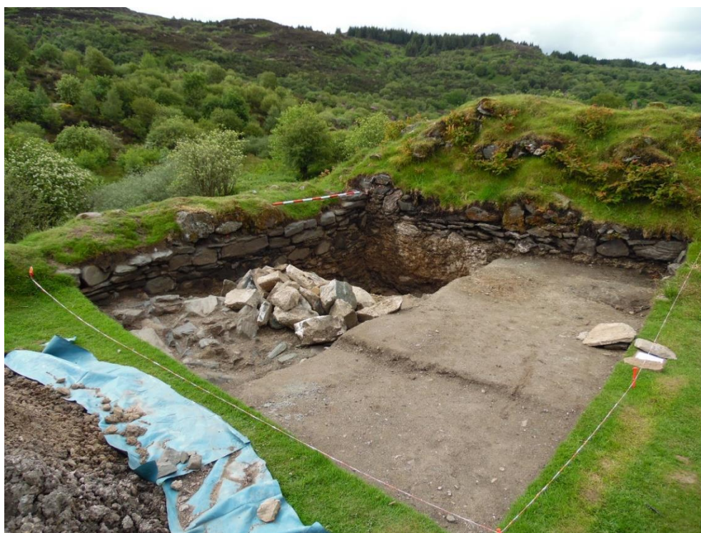
ILLUS S4 Trench 1 of the community excavation, in the south angle of the outer bailey. Scale 2m/200mm.