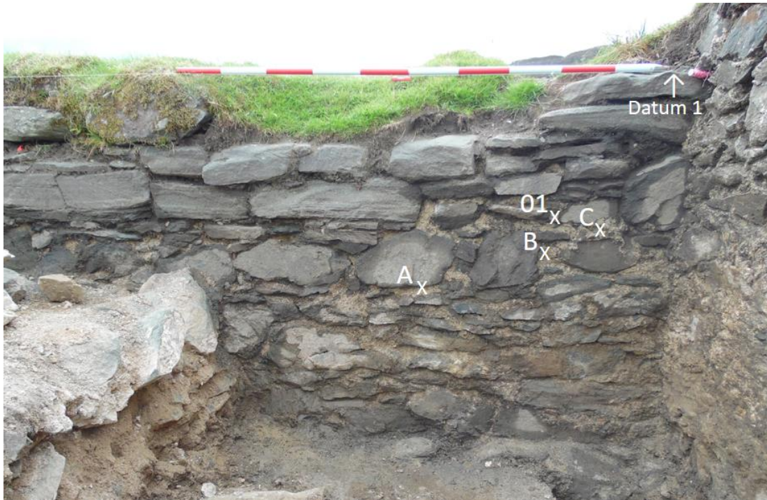
ILLUS S24 Locations of samples removed from exposed outer bailey SE curtain wall [047]; Trench 1.