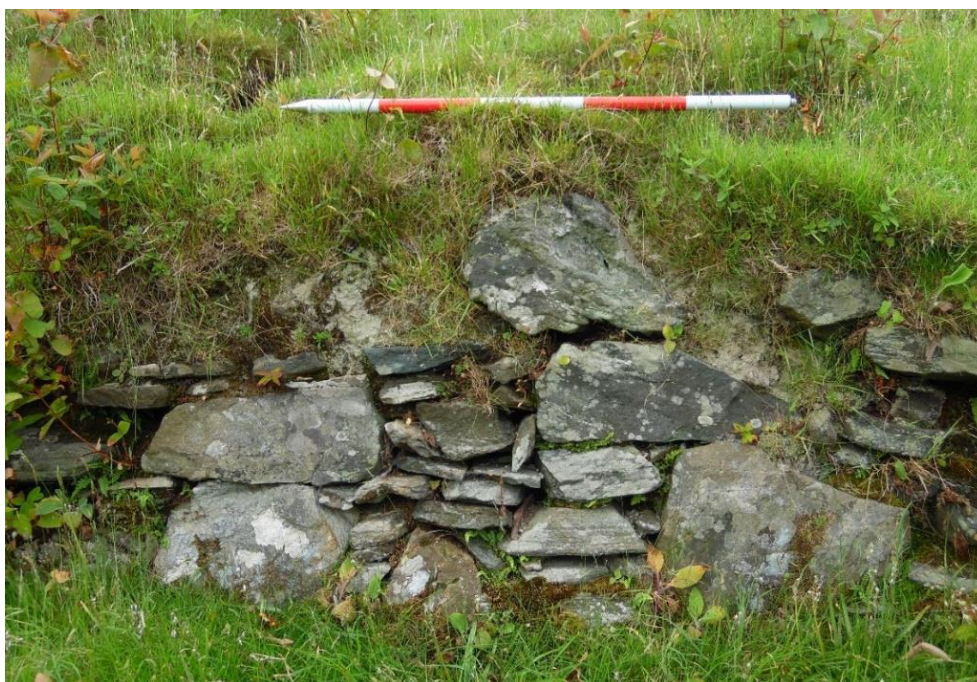
ILLUS S3 External face of SE curtain wall, inner bailey, surviving here to 1.0m above current ground level. Scale 1m/200mm.