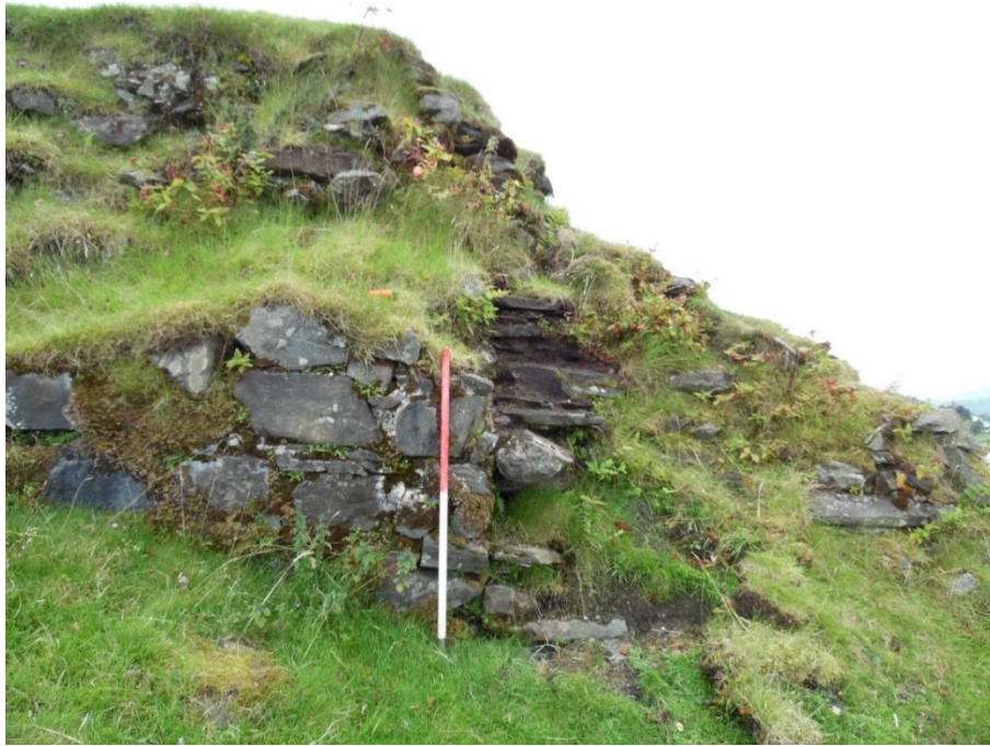
ILLUS S7 Straight Joint 2, from the north-east. This feature aligns with the internal face of the inner bailey north-west curtain wall.