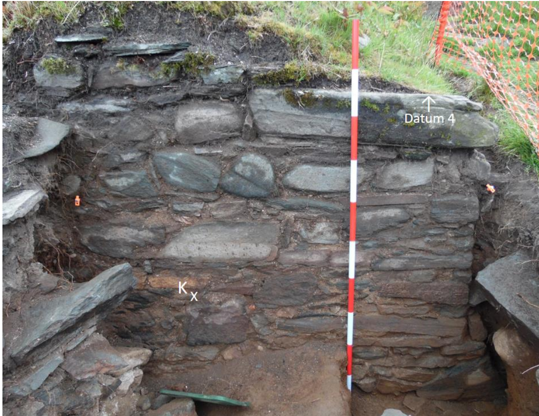
ILLUS S28 Location of the sample removed from West Block Wall [042], revealed in Trench 4.