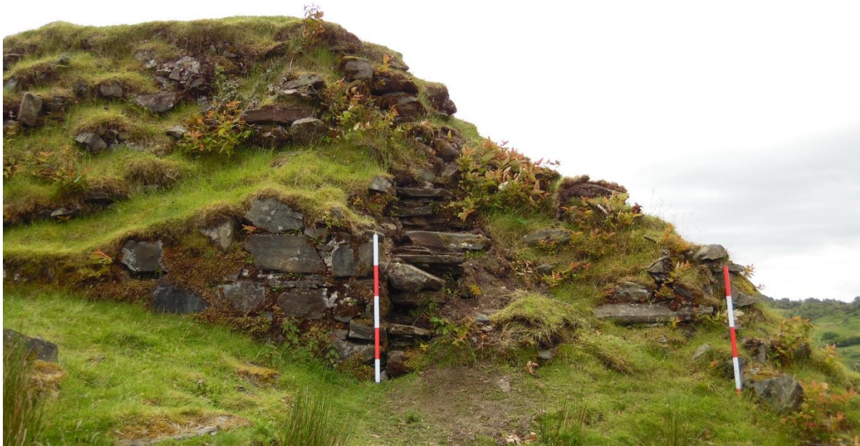
ILLUS S10 Straight Joint 2 from the north-east. The ranging rods delineate the width of the north-west wall of the inner bailey to the SW. Scales 2 x 1m/200mm.