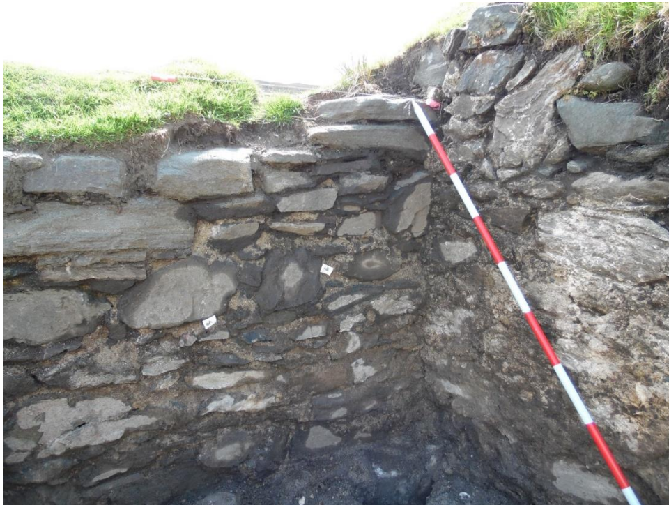
ILLUS S31 Datum 1; Wall [047].