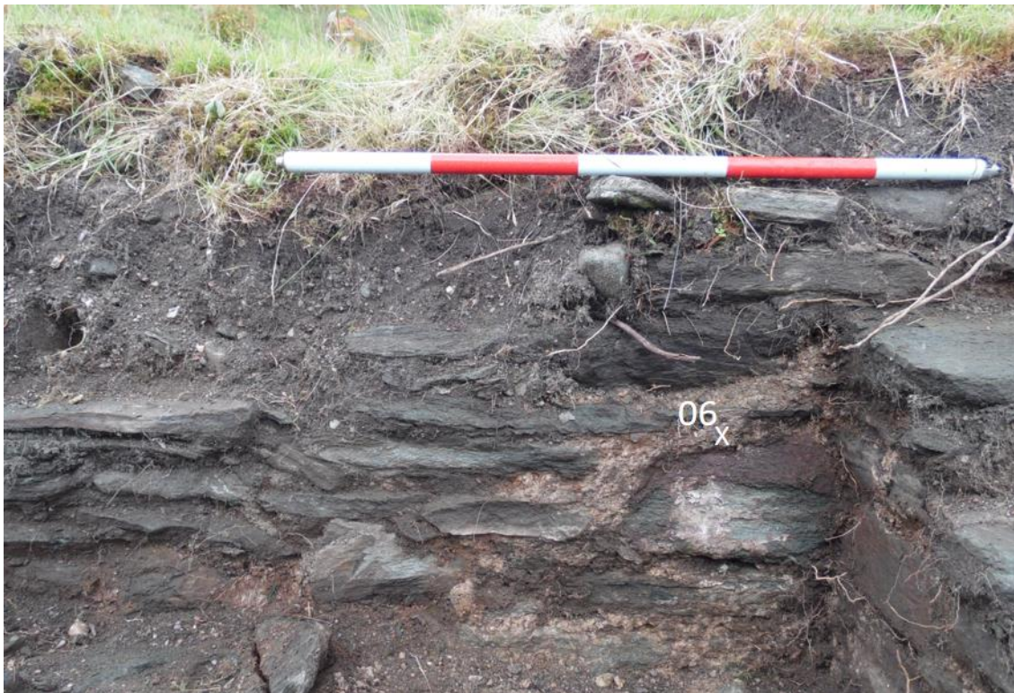
ILLUS S29 Location of the sample removed from West Block Wall [054], revealed in Trench 4.