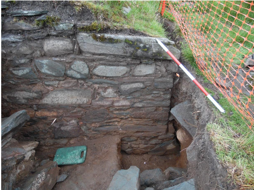
ILLUS S34 Datum 4; Wall [042].