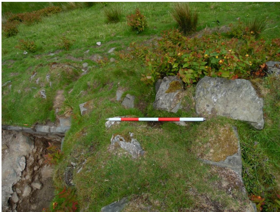
ILLUS S2 Straight Joint 1 from above; highlighting that the cross-wall south-west face and core rubble (bottom of image) abuts the internal face of SE curtain wall (top of image). Scale 1m/200mm.