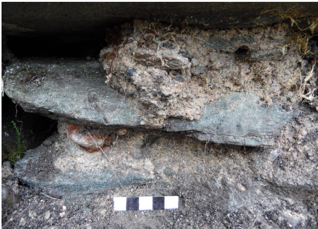
ILLUS S11 Fragmentary and friable remains of bedding mortar in the north-west inner bailey curtain wall at Straight Joint 2. Scale 10mm.