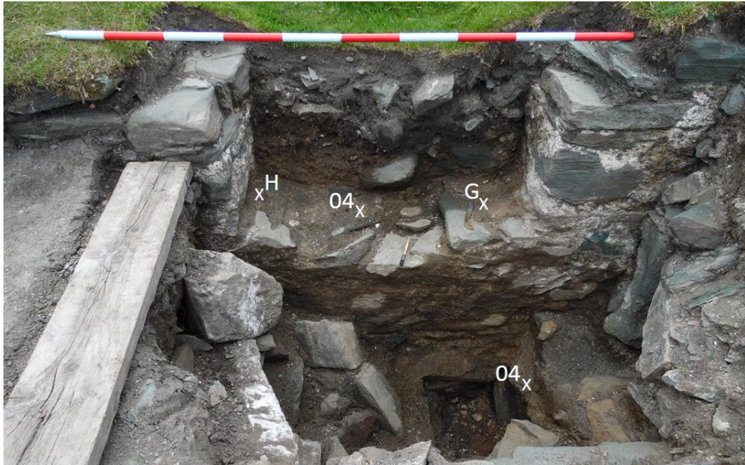
ILLUS S26 Locations of samples removed from exposed inner bailey NE range SW wall [044] and floor [035], Trench 2.