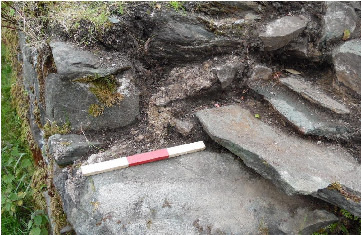
ILLUS S18 Highlighting that the core mortar associated with cross-wall abuts the fossilised internal face of the inner bailey NW curtain wall at Straight Joint 2. Scale 300/100mm.