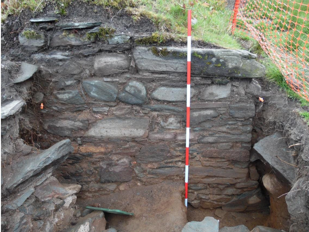
ILLUS S14 External face of excavated west tower SW wall. Scale 2m/200mm.