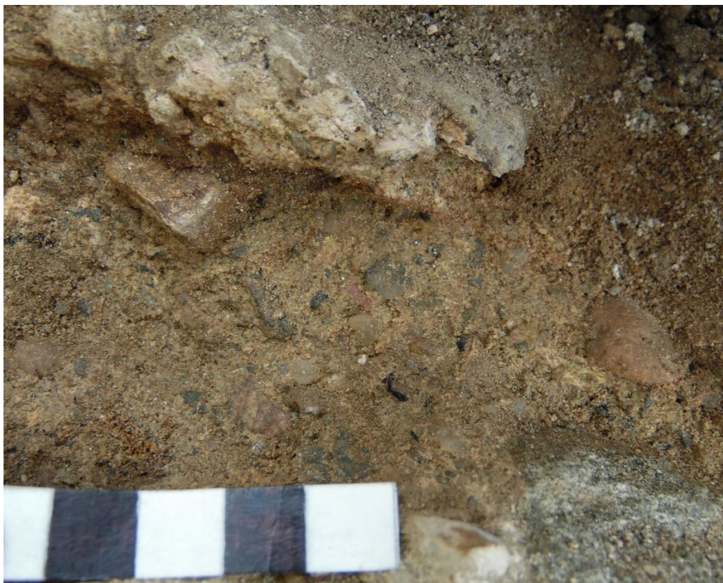
ILLUS S13 Core mortar associated with excavated outer bailey SW gate wall. Scale 10mm.