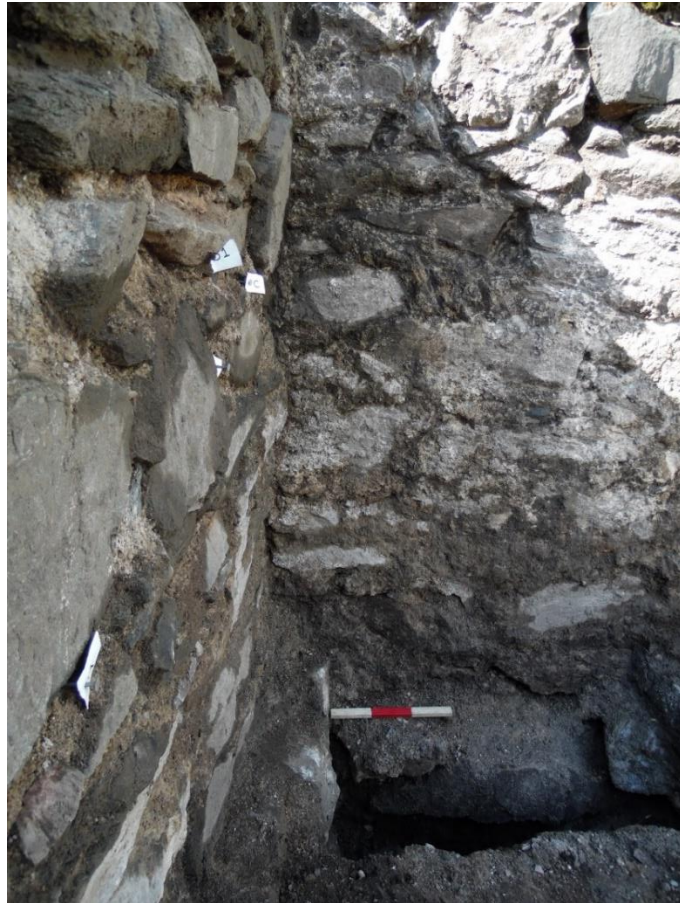
ILLUS S20 Straight Joint 1; highlighting that the cross-wall overbuilds the foundation scarcement and abuts the internal face of SE curtain wall. Scale 300/100mm.