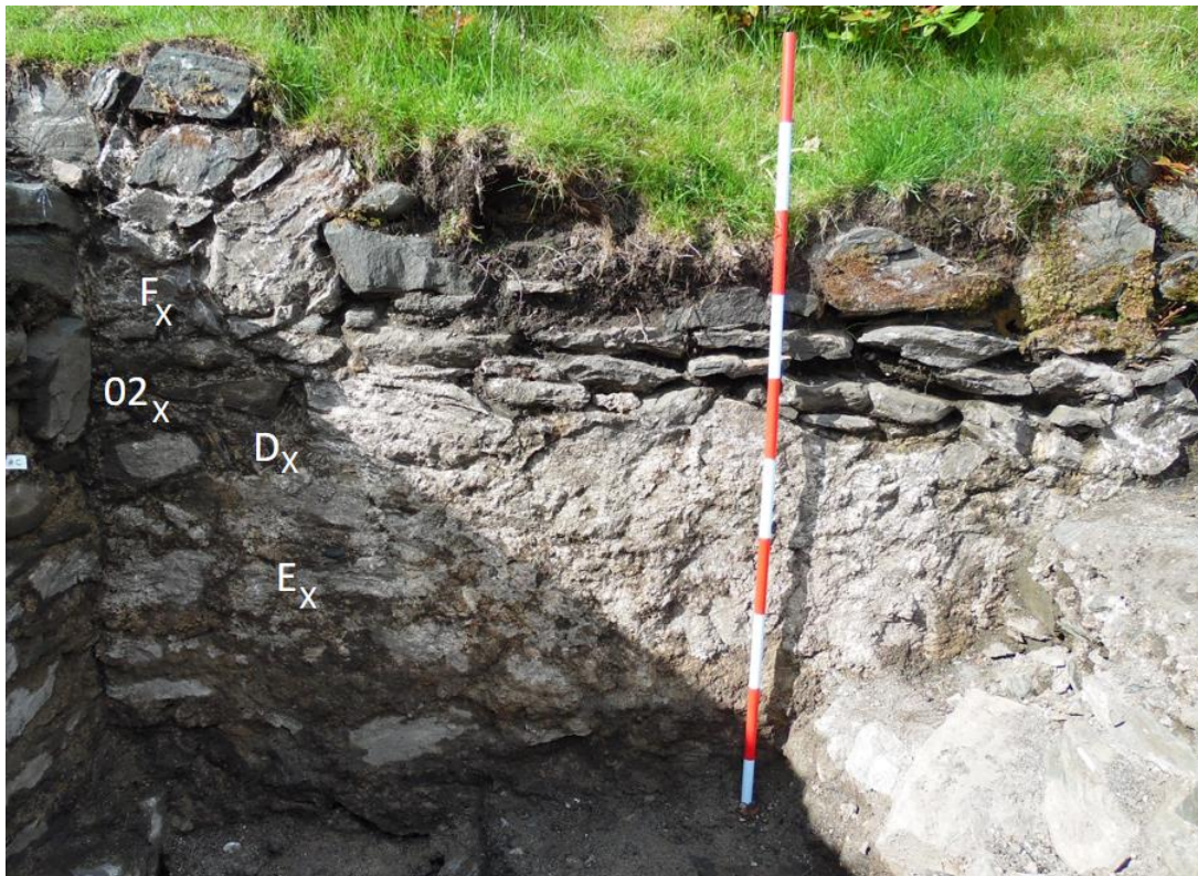
ILLUS S25 Locations of samples removed from exposed cross-wall [046]; Trench 1.