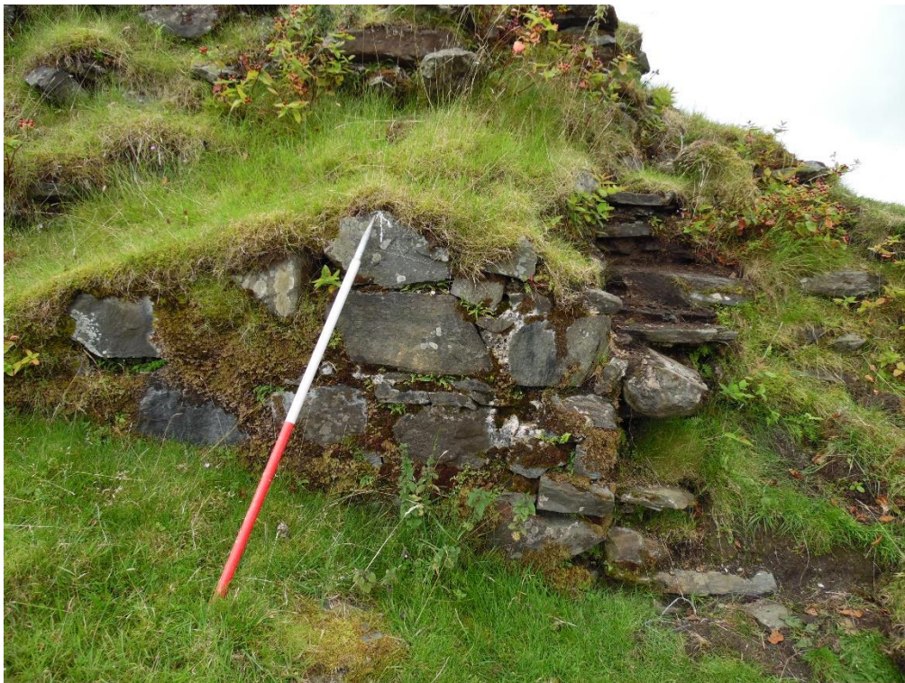
ILLUS S35 Datum 5; Wall [051].