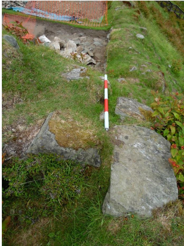
ILLUS S1 Straight Joint 1 from the south-west; highlighting that the SW face of the cross-wall (and associated core rubble) abuts the internal face of SE curtain wall. Scale 1m/200mm.