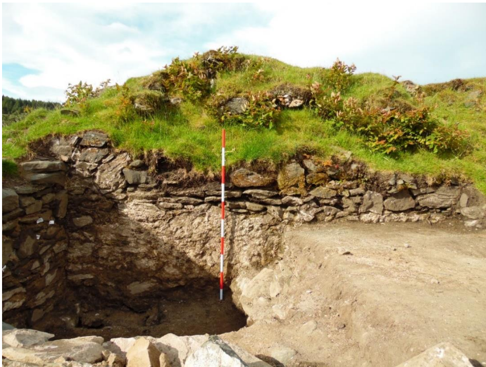
ILLUS S19 North-east face of cross-wall close to the south angle of the outer bailey. Scale 2m/200mm.