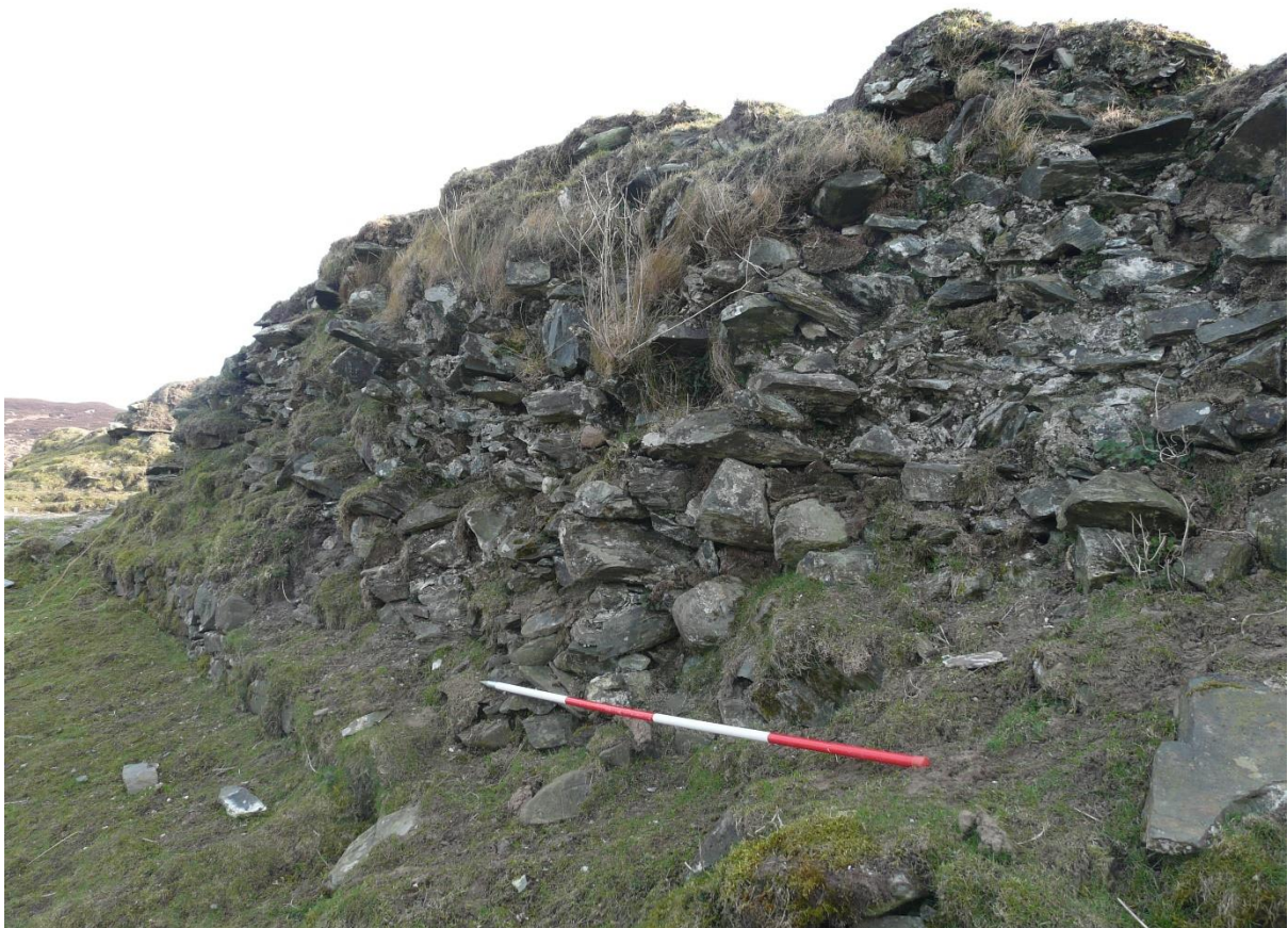
ILLUS S17 NW end of the cross-wall, highlighting extensive volumes of exposed upstanding core rubble and some wall facing. Scale 2m/500mm.