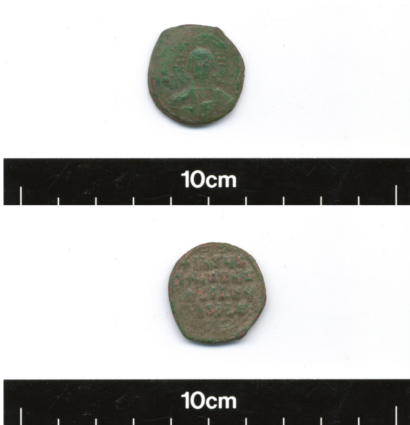
ILLUS 7 Byzantine follis of Basil II and Constantine VIII, from Argyll (TTDB 2019/182), top obverse, bottom reverse.

St Monan's, Fife M/d find 2016: Scotland – William I third coinage (short cross and stars) cut halfpenny, Phase B, unknown bust type, Hue Walter, 0.6g.