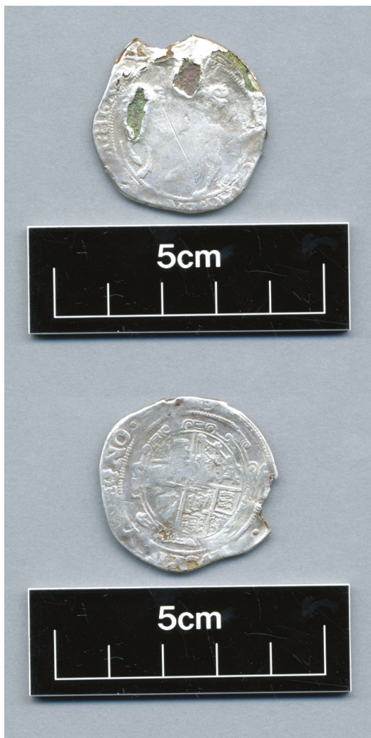
ILLUS 5 Forged Charles I half-crown, with a copper-alloy core and silver foil covering, from Chapelhall (TT 210/16), top obverse, bottom reverse.

Chirnside, Scottish Borders M/d find 2017: France – Francis I ecu d’or au soleil, Duplessy type 775, 3.3g (find claimed and allocated to NMS/slight damage). M/d finds 2019: Scotland – Robert II groat, type II, Edinburgh, 3.7g (slightly damaged); Robert III demy-lion, heavy issue, 1.3g.