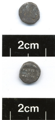
ILLUS 3 A reduced silver siliqua of Valentinian II, from Libberton (TT 142/18), top obverse, bottom reverse.

Peebles, Scottish Borders M/d finds 2020: Nero, denarius, AD 64–5, RIC 47; Vespasian, denarius, AD 72–3, RIC 356; Domitian, as, AD 86, RIC 500; unidentified, as, likely 1st century AD; unidentified, as, likely 1st–3rd century AD.