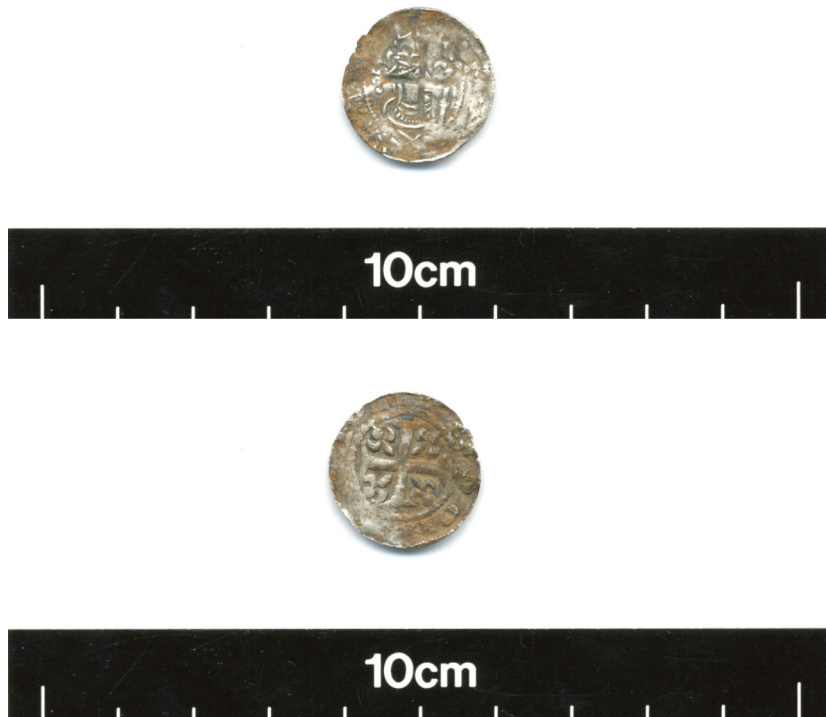
ILLUS 9 Sterling (penny) of William I of Scotland, first coinage, type 1, minted by Folpolt of Roxburgh, from Upsettlington (TTDB 2018/130), top obverse, bottom reverse.

Wester Balgeddie, Perth and Kinross M/d find 2019: England – Edward II penny, class 14, London, 1.4g (slightly bent).