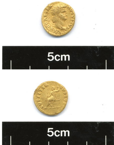
ILLUS 1 Aureus of Nero depicting Jupiter seated left on a high-backed throne, from Edinburgh (TT 069/18), top obverse, bottom reverse.