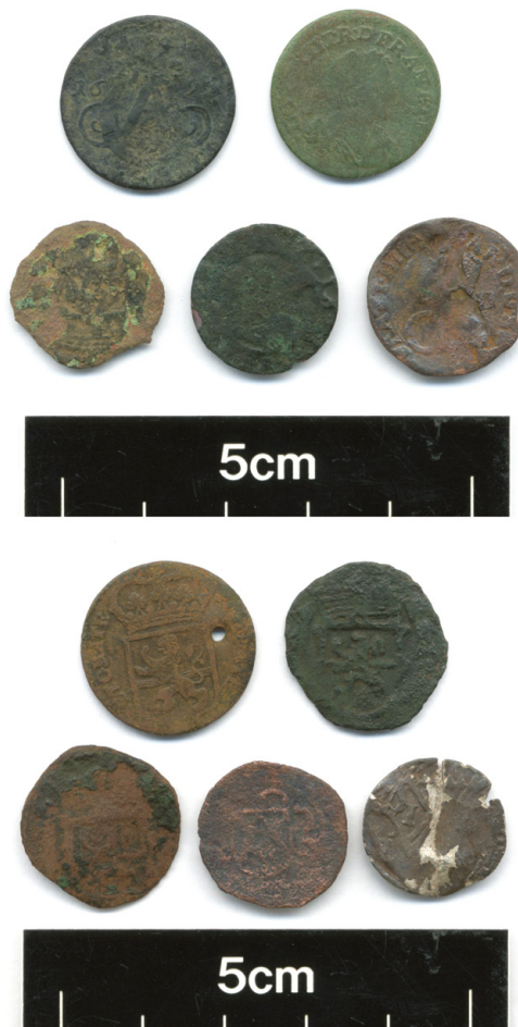
ILLUS 8 A selection of British and Continental coins from Scatness, Shetland Islands (TT 069/18).

Scotlandwell, Fife M/d find 2018: Scotland – William I third coinage (short cross and stars) penny, Phase A, Hue of Edinburgh, 1.4g.