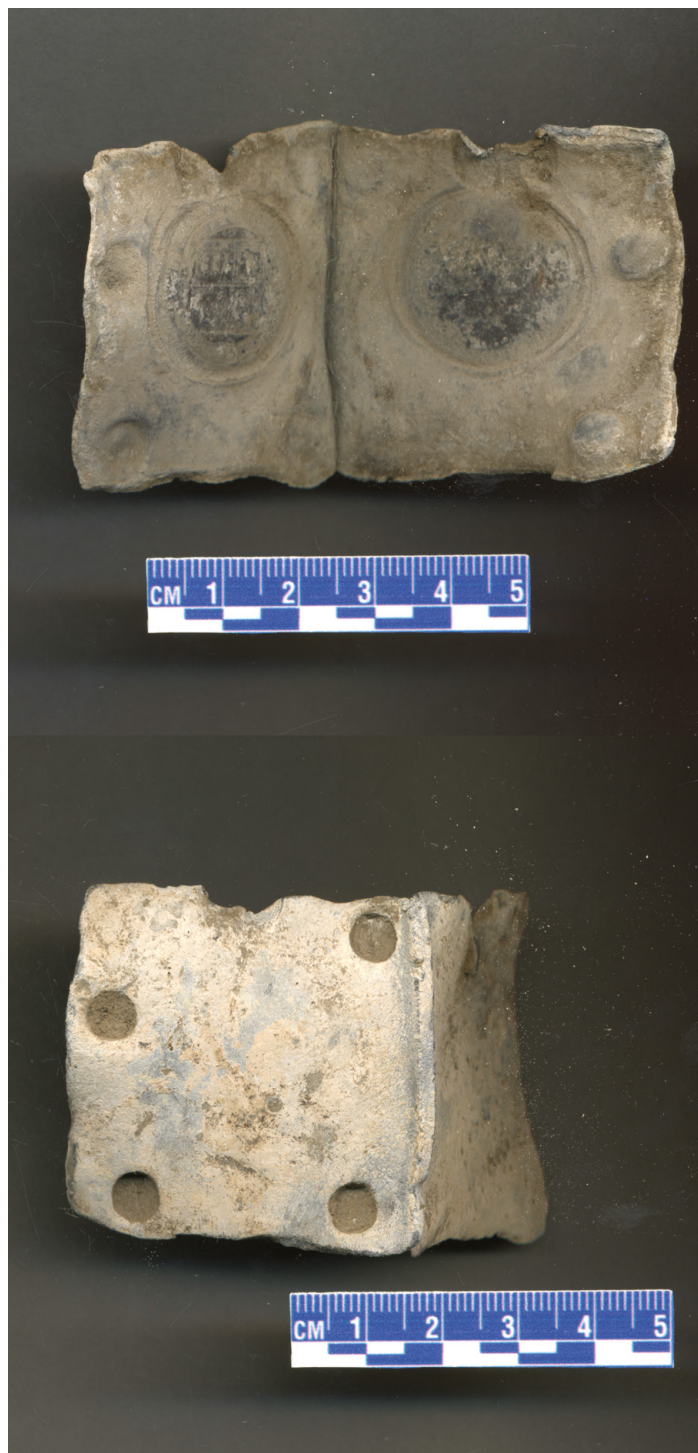
ILLUS 4 Lead-alloy forger's mould, with impression of Victoria 'Jubilee Head' shilling of 1899, from Airdrie (TT 170/17).