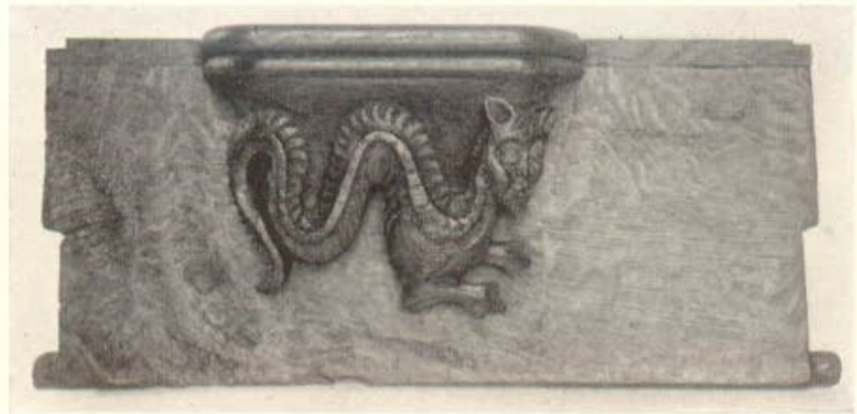
2. The Lincluden misericords.