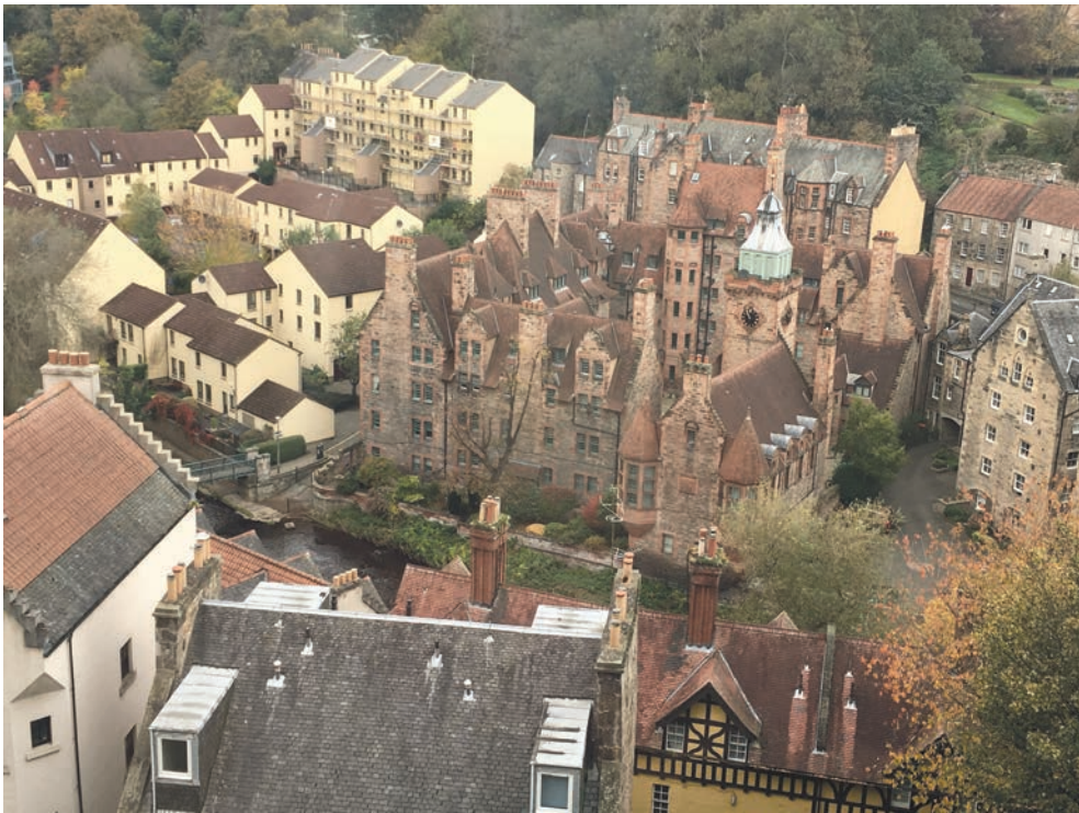
ILLUS 5 Well Court seen from No. 3 Rothesay Terrace.

from Well Court, signalling to the tenants Findlay's benign surveillance – its viewing terrace above its projecting square window bay had the same purpose as that built later at The Scotsman building, as we shall see.