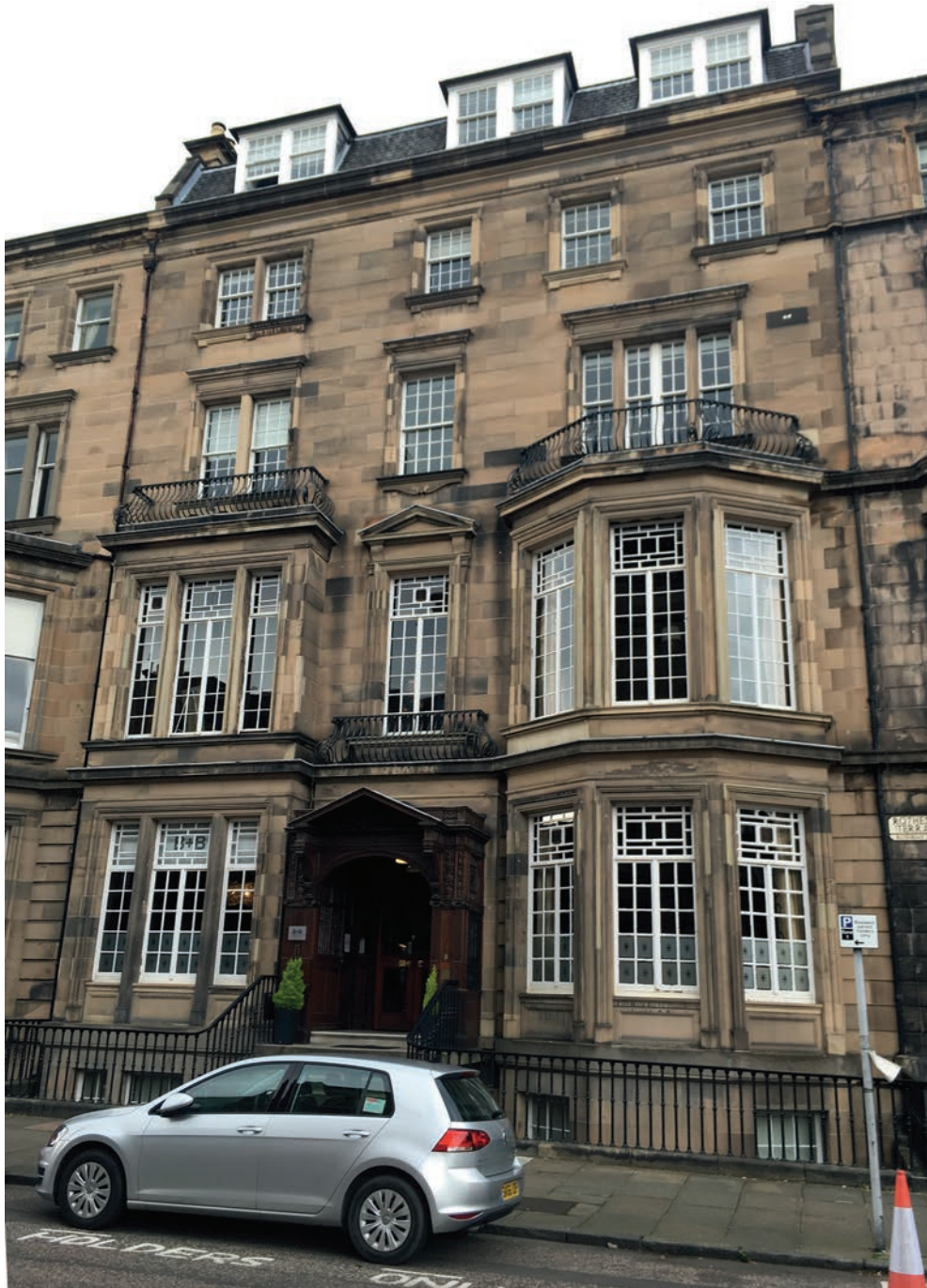
ILLUS 2 No. 3 Rothesay Terrace.