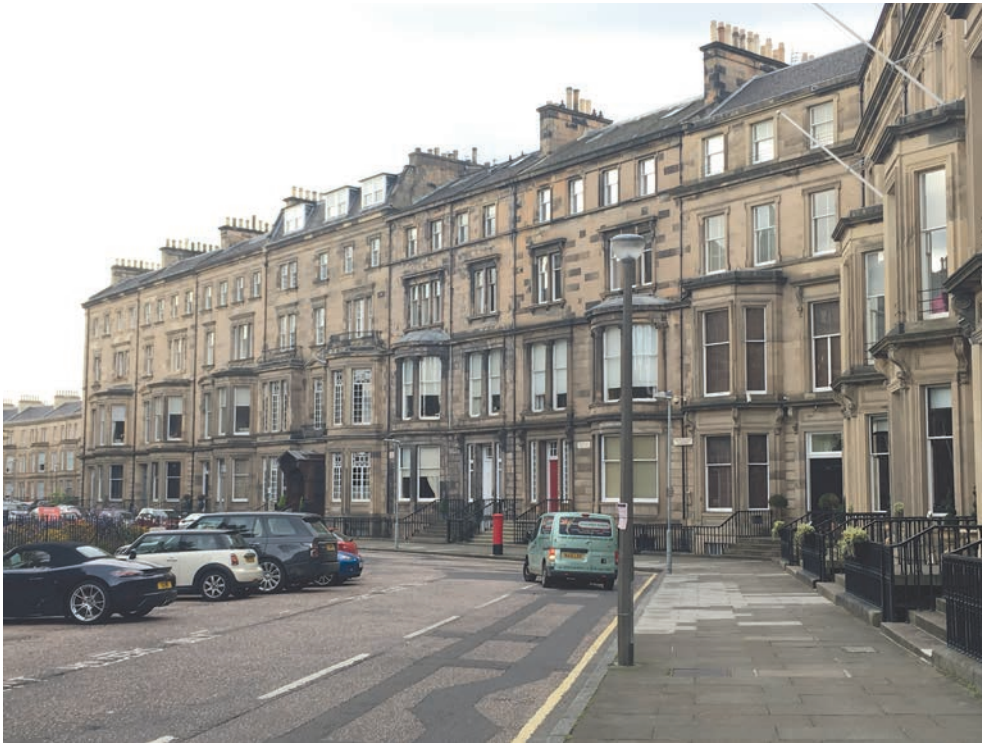
ILLUS 3 View of Rothesay Terrace.