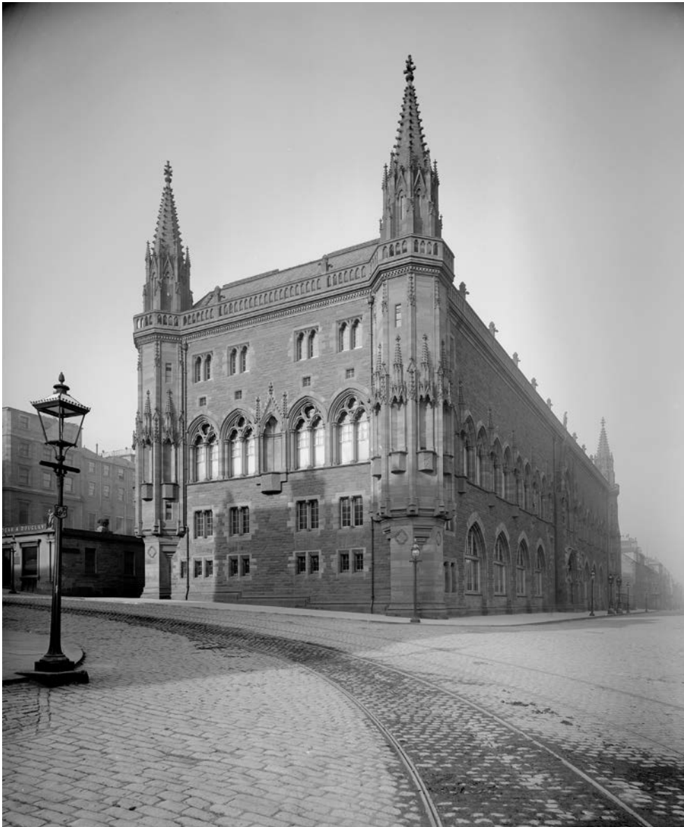
ILLUS 6 View of the Scottish National Portrait Gallery, Queen Street, Edinburgh, from York Place showing elevations to Queen Street and North St Andrew Street, c 1900.

summer of 1884 and its immediate successor was Old Edinburgh in 1886, followed among others by Old Manchester in 1887, Oud Antwerpen in 1895, Alt Berlin in 1896, Gamla Stockholm in 1897 and Vieux Paris at the Paris Exposition of 1900. Well Court and its historicising appearance