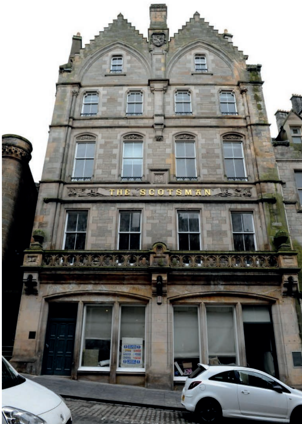
ILLUS 1 The Scotsman, 26–30 Cockburn Street.