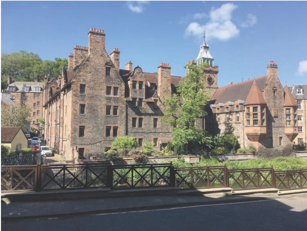
ILLUS 4 Well Court, viewed from the south.

them below the roof structure. This arrangement, seen at, say, Castle Fraser's 1620s low wings, was later picked up by Lorimer (for example on both the main block and lodges at Formakin) as a feature today often considered 'Lorimerian', but with precedent here. On the tympana of the west-facing hall window pediments, in carved roundels, are a thistle, monogrammed initials, a rose and a fleur-de-lis. These details, and features such as the historicising roll-moulding of the tenement windows, the intentionally anti-Classical designs of the ironwork on railings and the door furniture of the individual flats, were all conceived in such a way as would signify Scottish antiquity. The hall block emphasised the development's Scottish Renaissance character, having a combination of specific historicising references, while its martial symbolism was emphasised by convincingly located dummy gunholes. The theme was continued westwards from the hall along the riverside, where a stone-