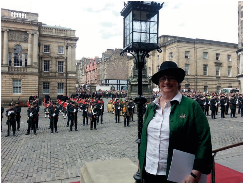
Jenny attending the Thistle Investiture Ceremony at St Giles Cathedral in July 2014.

Such a fiercely independent approach was visible from the very beginnings of her published work. Wormald began her assault on the writing of Scottish history in 1972 with the characteristically provocative title, ‘Taming the Magnates?’, an article which has been reprinted at least twice since. In it she took apart the traditional assumption that the dominance of supposedly unmanageable overmighty magnates in Scottish society and government was to the detriment of a weak and ineffective Stewart monarchy. In so doing, she was able to establish that instead, the mighty nobles were generally far more co-operative with the crown than was previously thought; that the Stewart kings were able to exert their authority through these regional lords; and that in contrast to the instability and loss of authority suggested by the repeated royal minorities of the 15th and 16th centuries (as kings died prematurely in battle or rebellion), Stewart