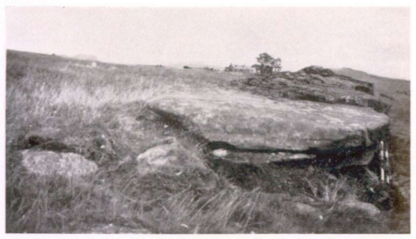
1. Cup-marked boulder at Gartnabrodnaig, Drymen, from the W.