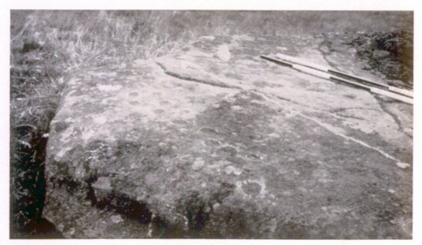
3. N. and W. group of markings (chalked arrow points to magnetic north. Scales: upper in divisions of feet; lower in divisions of 20 cm.)