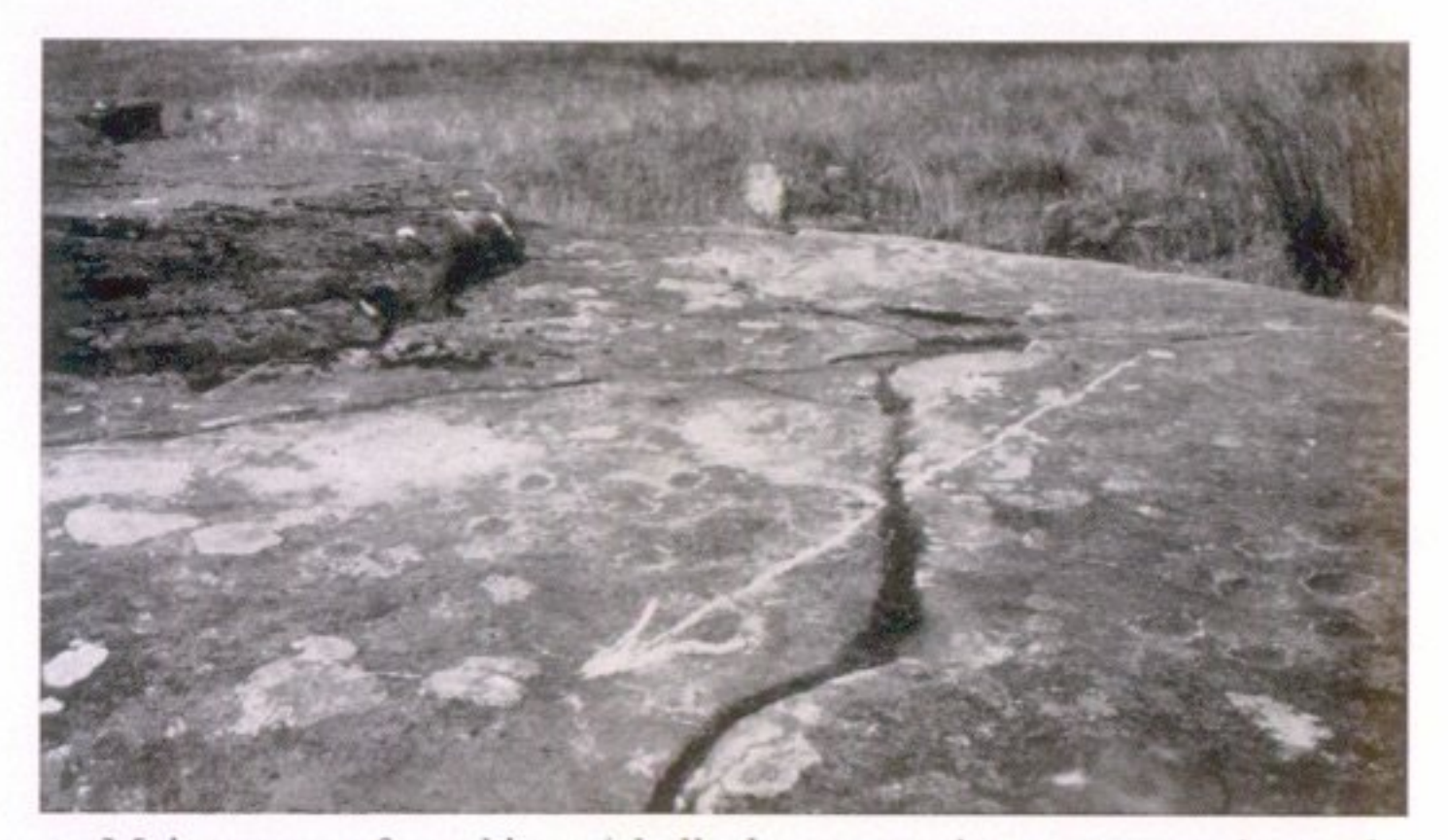
2. Main group of markings (chalked arrow points to magnetic north)