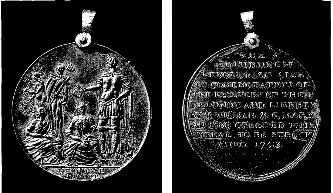
Illus 2 Revolution Club Medal, 1753; diameter 35.5 mm

It. of Troy weights cast like bells one 30 pound weight two twenty pound weights one 15 pound weight two 10 pounds two five pounds one 4 pound two three pound weights two 2 pound weights and five single pounds all Troy weight