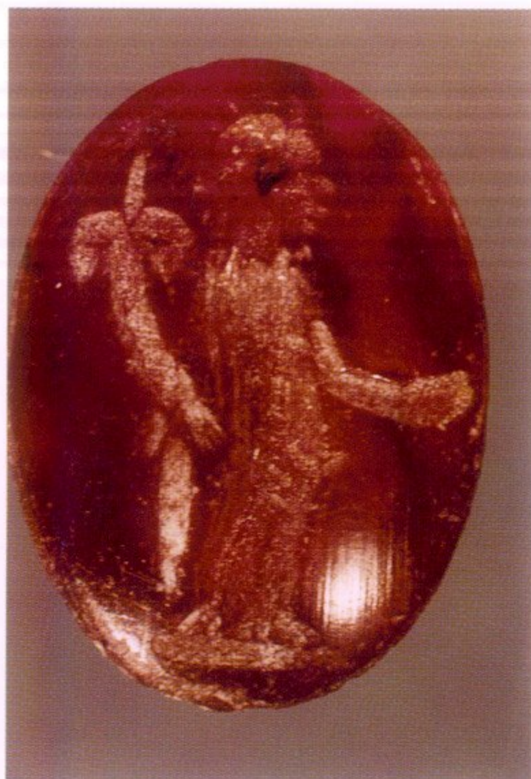
ILLUS 2 Gemstone finds from Trimontium: (top left) no 32, Roma seated, 13 mm by 10 mm by 4 mm; (top right) no 34, maenad playing pipes, 13 mm by 11 mm by ? mm; (below left) no 35, standing goddess, 10.5 mm by 8 mm by 4 mm