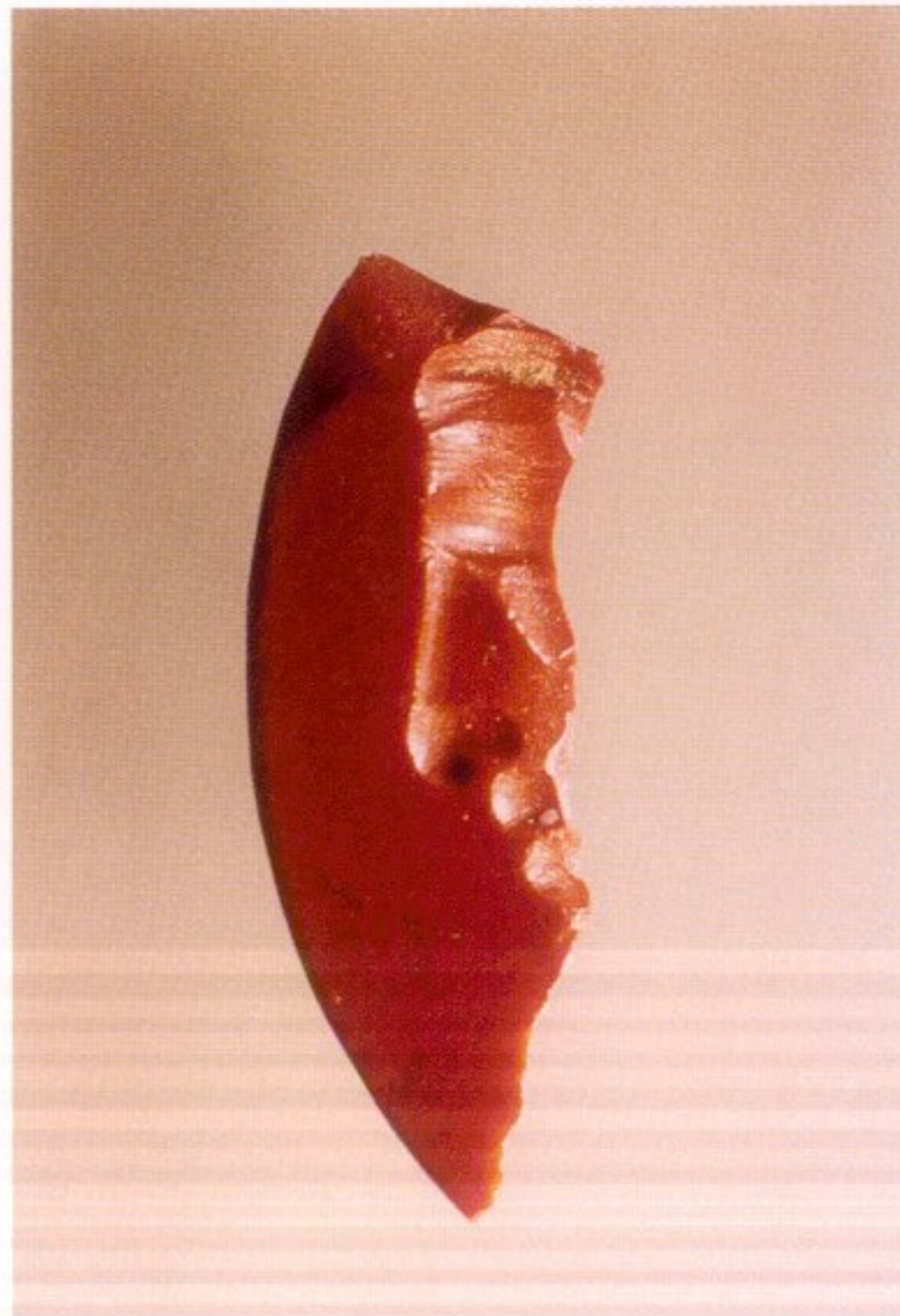
ILLUS 3 Gemstone finds from Trimontium: (left) no 36, Caracalla, 18 mm by 11 mm by 2 mm, a recent find; and (right) no 29, a fragment showing facial features of a youthful person, 10 mm by 3 mm by 2 mm, also in the 'Severan patterned style' (first published by Elliot & Henig 1982, 288–9, no 29)

proposal that there was a workshop operating in Britain between c 208 and 212, when the province was de facto the heart of the Empire. It is possible, even probable, that the workshop had an official basis, making 'loyalty tokens' for presentation by the imperial secretariat to influential army officers and other supporters of the regime. This has recently been discussed in relation to another contemporary red jasper intaglio found at Birdoswald, Northumberland, depicting a portrait of Caracalla's younger brother Geta (Henig 1997b, 284–5, no 87).