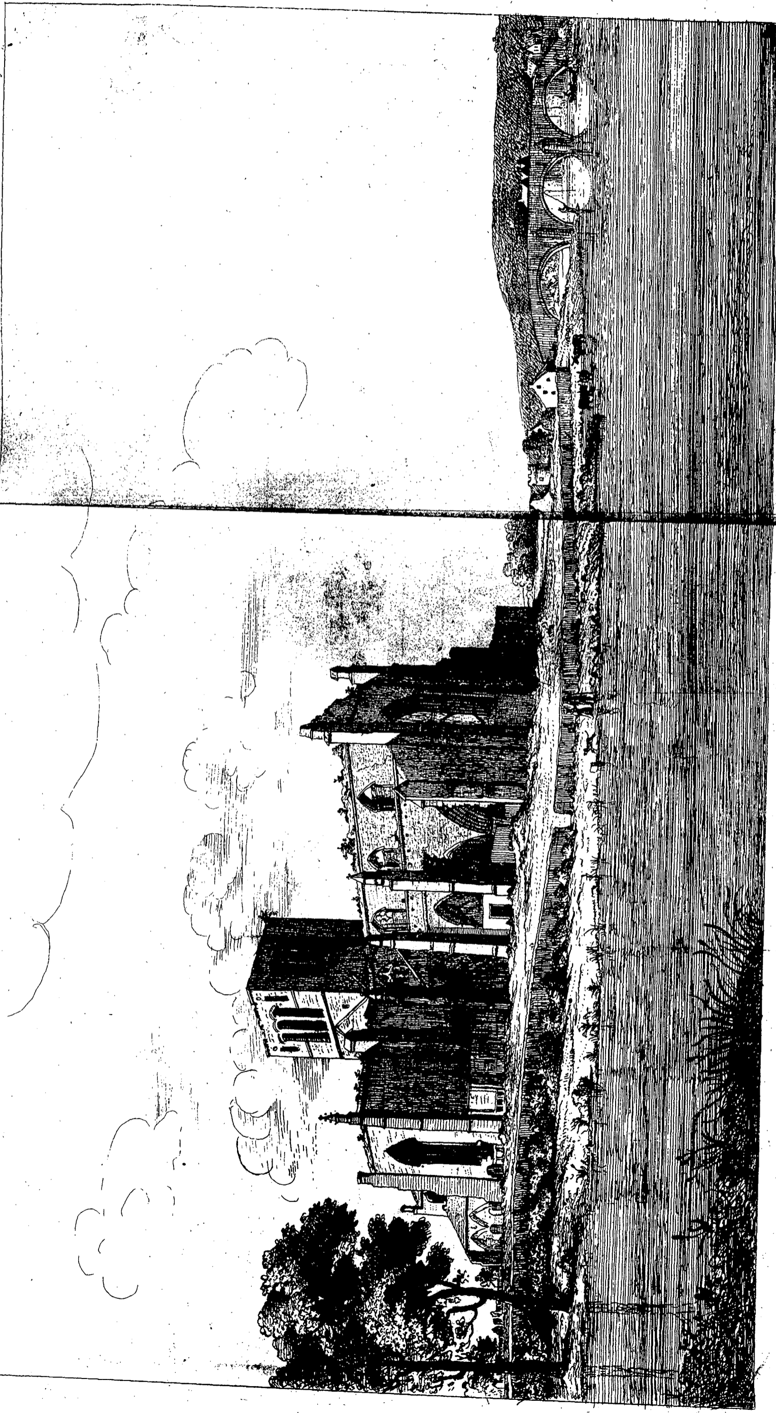
A View of the Church of Haddington from the South East