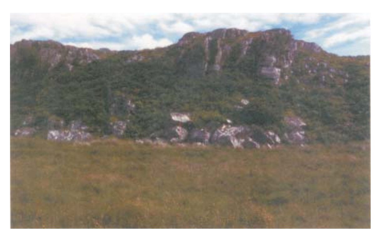
Illus 2 Glennan boulder-shelter: view of its location

The specialist reports below are edited versions of the full texts, which form part of the site archive. The site archive has been sent to the National Monuments Record of Scotland, RCAHMS, Edinburgh. The finds have been allocated to Kilmartin House Museum of Ancient Culture by Historic Scotland's Finds Disposal Panel.