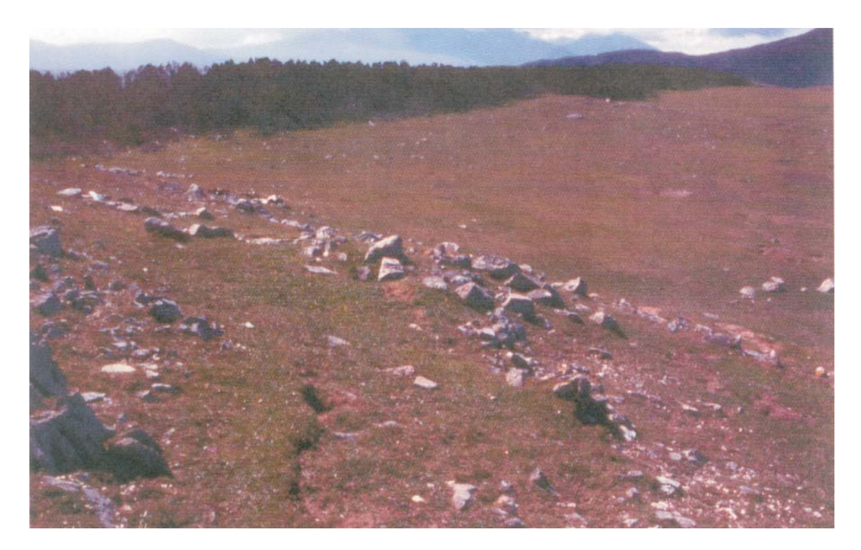
{\it Illus~3} \quad {\it Loch~Borralie~cairn: another~general~shot~of~the~cairn~and~outcrops}