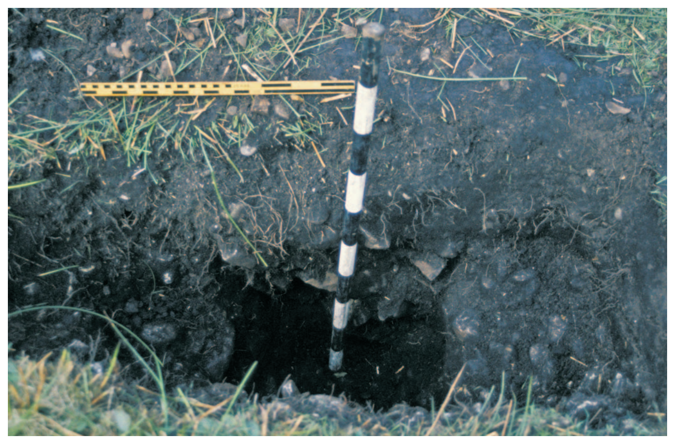
Illus 43 Camas Daraich: Soil Pit 3

The Point of Sleat basin was formed as a result of glacial scouring. After de-glaciation, unconsolidated