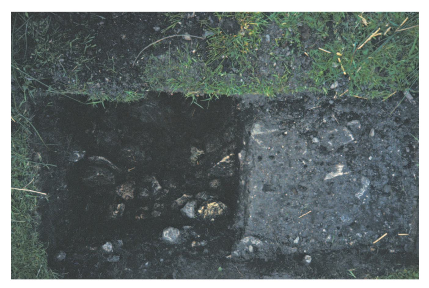
Illus 41 Camas Daraich: Soil Pit 1

To determine the extent of slope-wash, Soil Pit 1 was placed near a small soligeneous bog about 20 m north and downhill of trench 1 (Illus 10). Three individual soil units were identified: