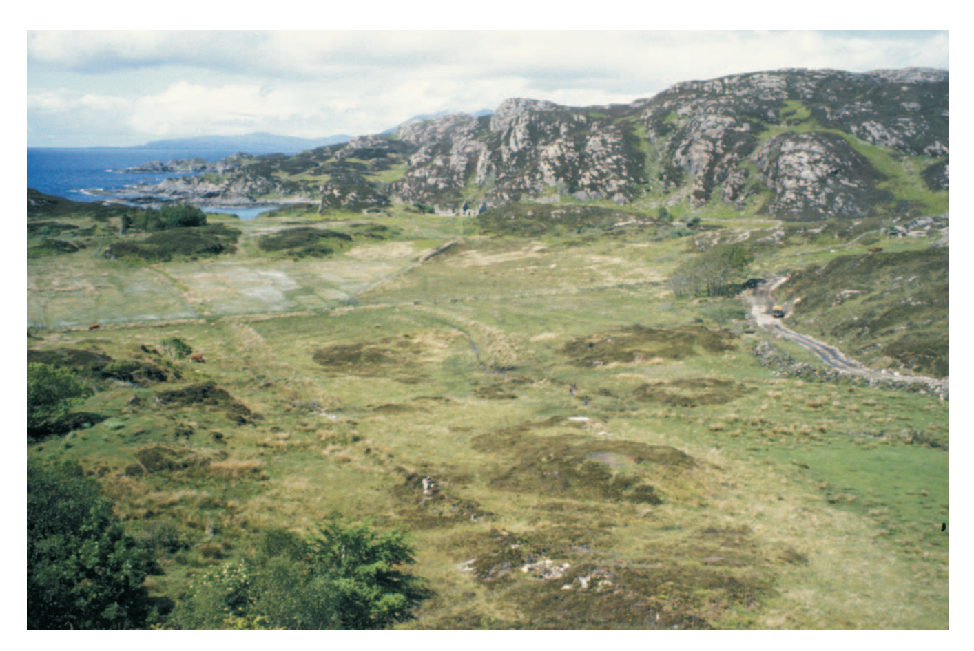
Illus 44 Camas Daraich: general view to the NW, showing the peat-filled basin and the general area of Selby's core

minerogenic material and weathering products from skeletal soils eroded into the basin where they accumulated as sand and fine clays. According to the diatom record a fresh-water environment was present at the time of initial in-filling. At 12,570 BP (corrected to 11,820 \pm 70 for carbonate shell error)