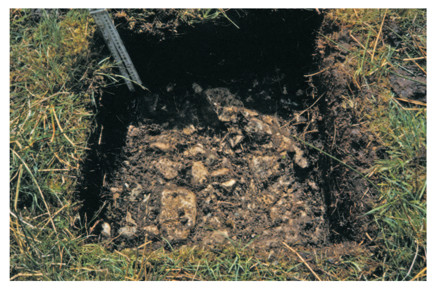
Illus 42 Camas Daraich: Soil Pit 2

Observations: Unit 2 consists of an accumulation of beach pebbles at the base of the cliff. The high stone content shows that this portion of the site was not cultivated, perhaps owing to its position close to the cliff. At some point in the 18th century (based on a fragment of white glazed pottery), a crude but effective land drain was constructed. This drain runs downhill and cuts the west edge of Tr1.