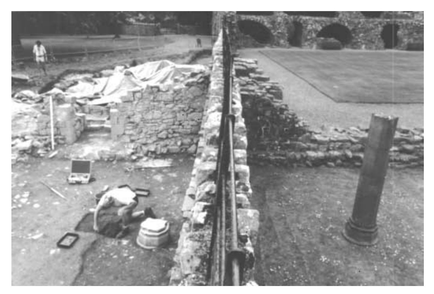
Illus 4 Room 4 under excavation, from west

into the Abbey Burn from the west. A culverted water course runs down towards the nearby site of the present school, and may well represent a freshwater supply to the abbey, now obscured.