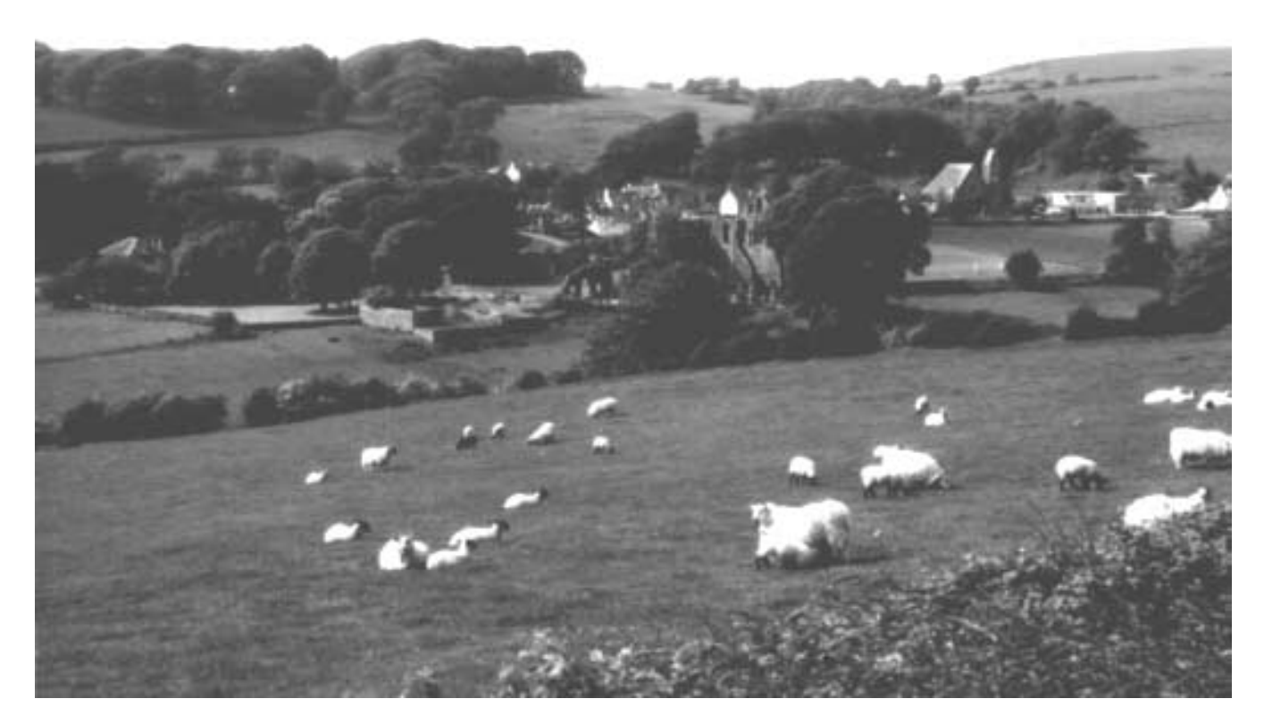
Illus 2 View of the site from south-east

The typical criteria of well-drained, secluded, wooded valleys for Cistercian foundations of the 12th century are well met at Dundrennan. The sharp bend in the course of the Abbey Burn also provided suitable areas for cultivation to the east of the main abbey buildings, a further favourable condition for its foundation. The river drained the area of the abbey and adjacent fields, creating the potential for gardens and orchards, although the ground is prone to flooding. The supply of water to the abbey was probably via one of the known tributaries feeding