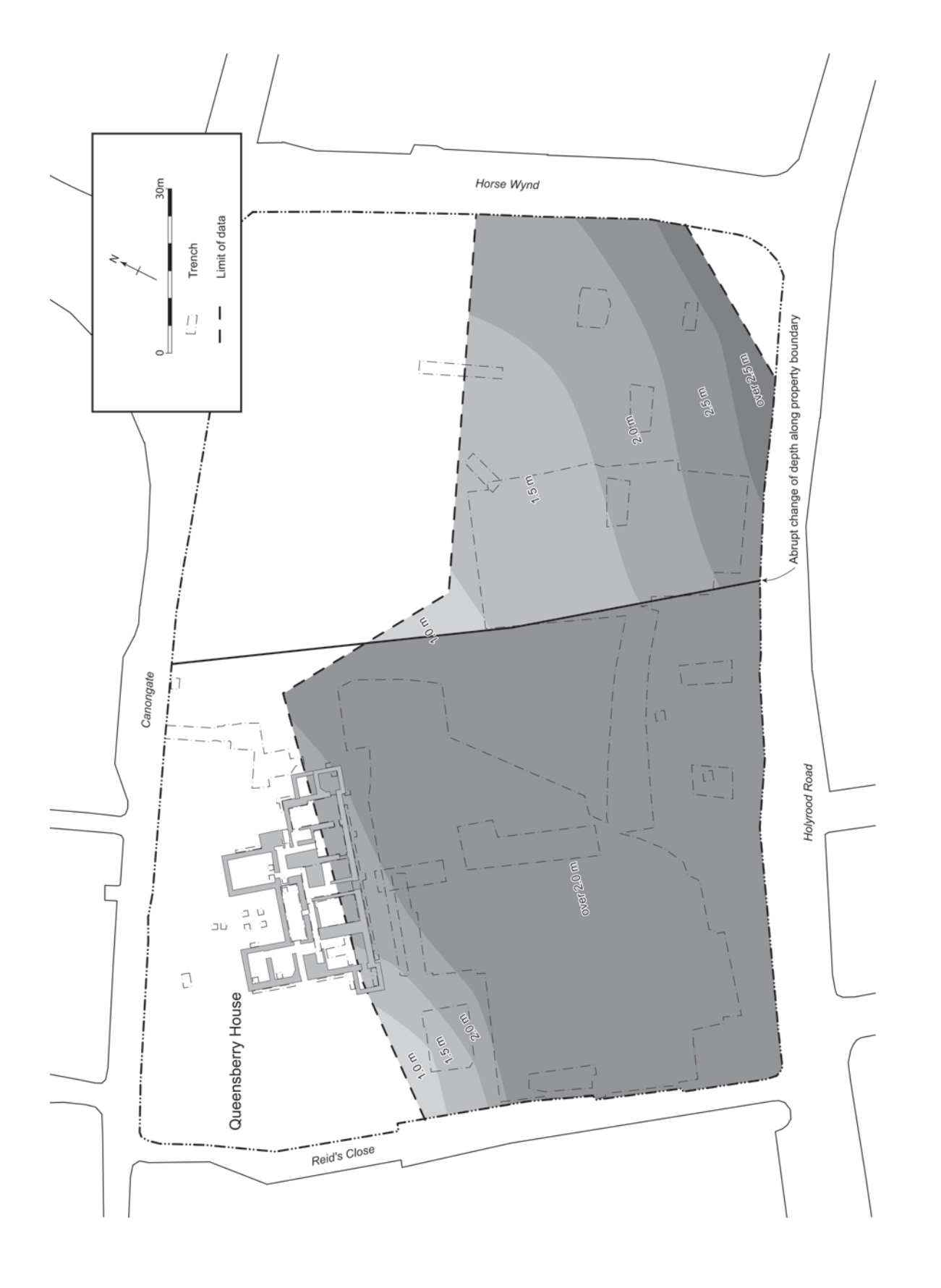
Fig. 2.3 Total depths of soil over subsoil