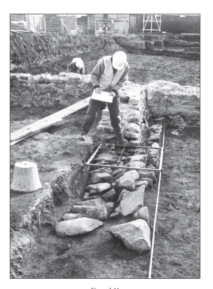
Early wall 849 forming the boundary between the vennel and Plot 3.3, preserved under later wall 635

The southern part of Plot 3.3 contained no archaeological features that were assigned to this period; however, within the Queensberry House basement several substantial wall foundations that ran under the standing building were preserved beneath the modern