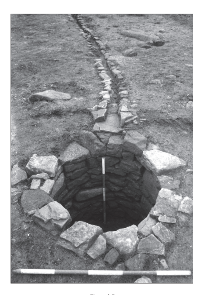
Figure 3.7 Cistern (764) and drain (768), seen from the north (located on fig 3.4)

In the south of Plot 2.2, was a large pit (746). The first layers within it contained much midden material. This material had been dumped into the feature from the north and again indicated that metalworking