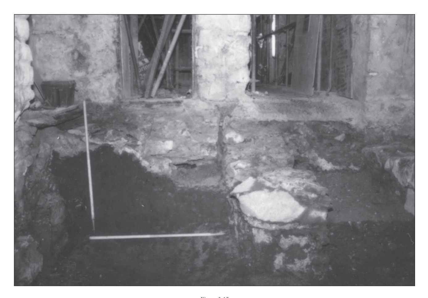
\label{eq:Figure 3.12} \textit{Wall of a tenement building surviving under Queensberry House}

floor. The east wall of the south-west corner tower (7134) had been built on an earlier foundation, which contained an arch below ground level. A corner (7155) was revealed beneath the doorway of the neighbouring room.