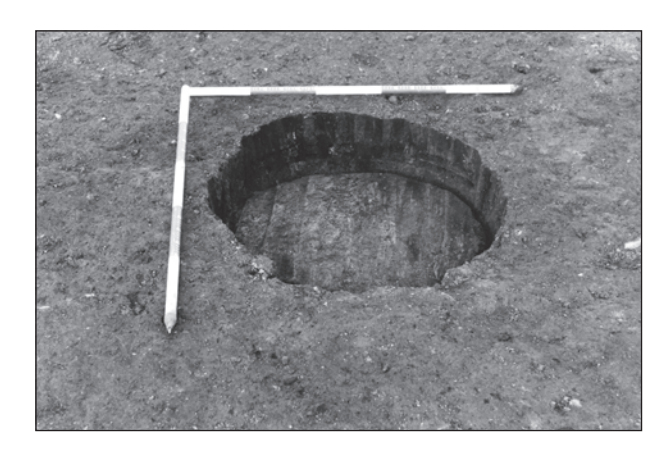
Figure 3.6 Pit containing the base of a barrel

The eastern side of Plot 2.1 was defined by a ditch in the southern part (759), and more formally, toward the frontage, by a drystone wall (004). The western side of the plot was not encountered within the area of excavation but may have been roughly below the eastern side of Reid's Close. The property contained a couple of pits (336, 323) dug into subsoil, which was very clayey here. They may have been intended to extract some clay for building or waterproofing, rather than being primarily for rubbish disposal. A rectangular cut (333) was preserved within the plot. It contained stakeholes in its base and impressions of planks in its sides. If the cut originally held a wooden lining, it could have functioned as a trough or something similar. Its backfill was indistinguishable from the surrounding loam and contained an array of artefacts that did not help in any diagnosis of function. A very regular cut (680) was found to have neatly held the base of a barrel (fig 3.6). Presumably this would have held water, perhaps for supplying animals or some craft activity. The wood was in such poor condition that its species could not be identified. The backfill (681) contained many iron nails and fragments, one designed for a horseshoe (no. 57), and a flax seed.