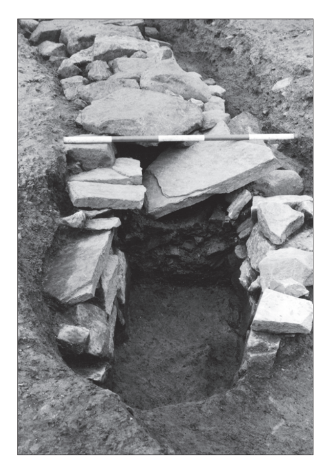
Figure 3.10 Termination of culvert 692

of clay tobacco pipes (nos 73, 268 & 324), bones from a wide variety of animals, and a range of pottery.