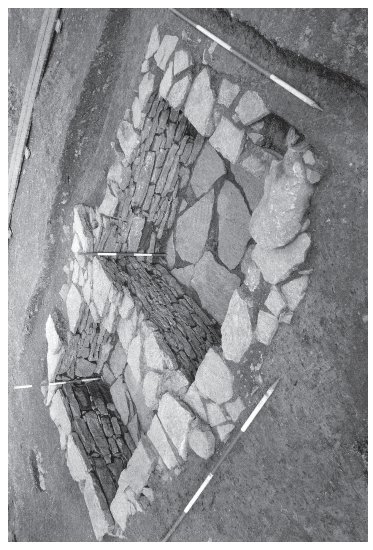
\label{eq:Figure 3.35} Figure \ 3.35 Twin tanks that may have been tanning pits