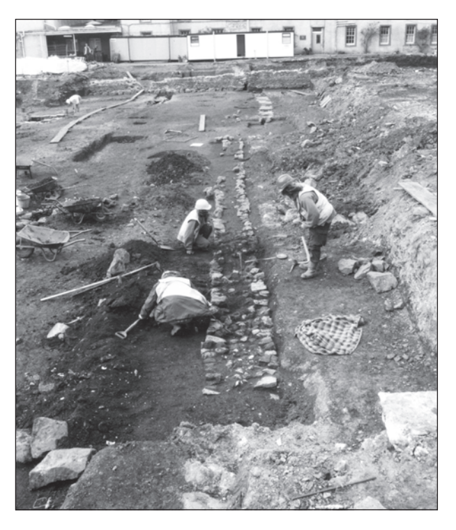
Figure 3.8 Drystone wall defining the western side of Plot 2.3

Plot 2.4 contained, at its northern end, the only preserved area of Canongate frontage exposed during the excavation. Although several remnants of claybonded walls survived (195, 1084, 1099 & 1105),