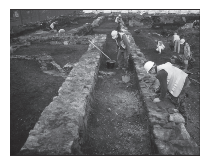
Figure 3.15 Excavation of the surviving walls of Haddington House and garden wall, looking north-west

The previous Plot 3.1 appears to have been subdivided into two properties by the building of a lime-mortared stone wall running north-west/south-east (218, figs 3.14 & 3.15). During the earlier part of this period the new subdivision (Plot 4.1) contained a series of north-east/south-west-aligned slots, each around 2m wide and up to 0.4m deep. The slots were quite closely