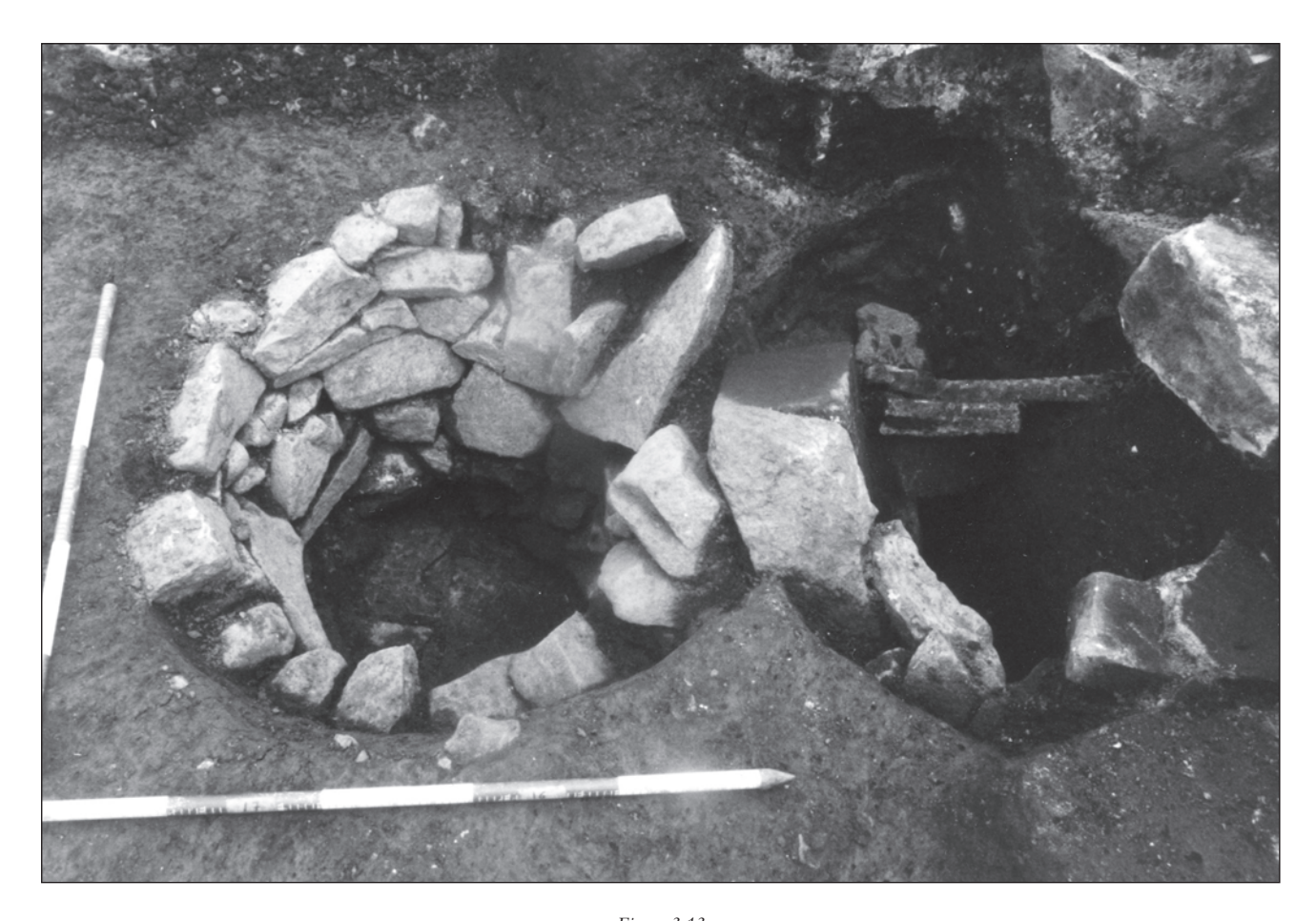
Figure 3.13 Possible tanning pit within Plot 3.6

In the area assumed to have lain within Plot 3.6 one feature extended into the east baulk of the excavated area and consisted of two interconnected subcircular cuts (fig 3.13, 1637 & 1664). Both were stone-lined. The eastern cut (1664) contained remnants of an inner wood lining and was larger and deeper than 1637. Superficially this feature has much in common with the possible tanning pit 843 (Plot 2.2). No bones with skinning marks were found within either tank but there was a complete small unglazed bowl with a spout on the rim (Pot no. 99). The form of this vessel suggested that it may have been used for measuring out liquid, and its disposal without any evident damage