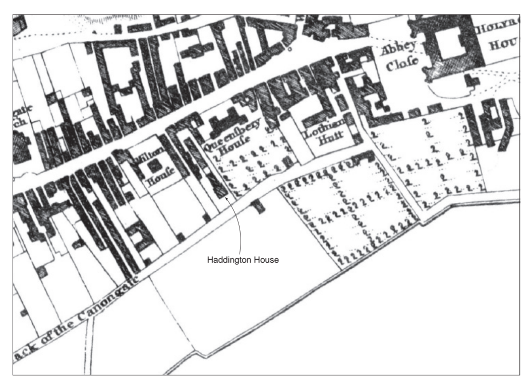
{\it Figure~3.16} Lizars' survey of 1778, showing the presence of Haddington House