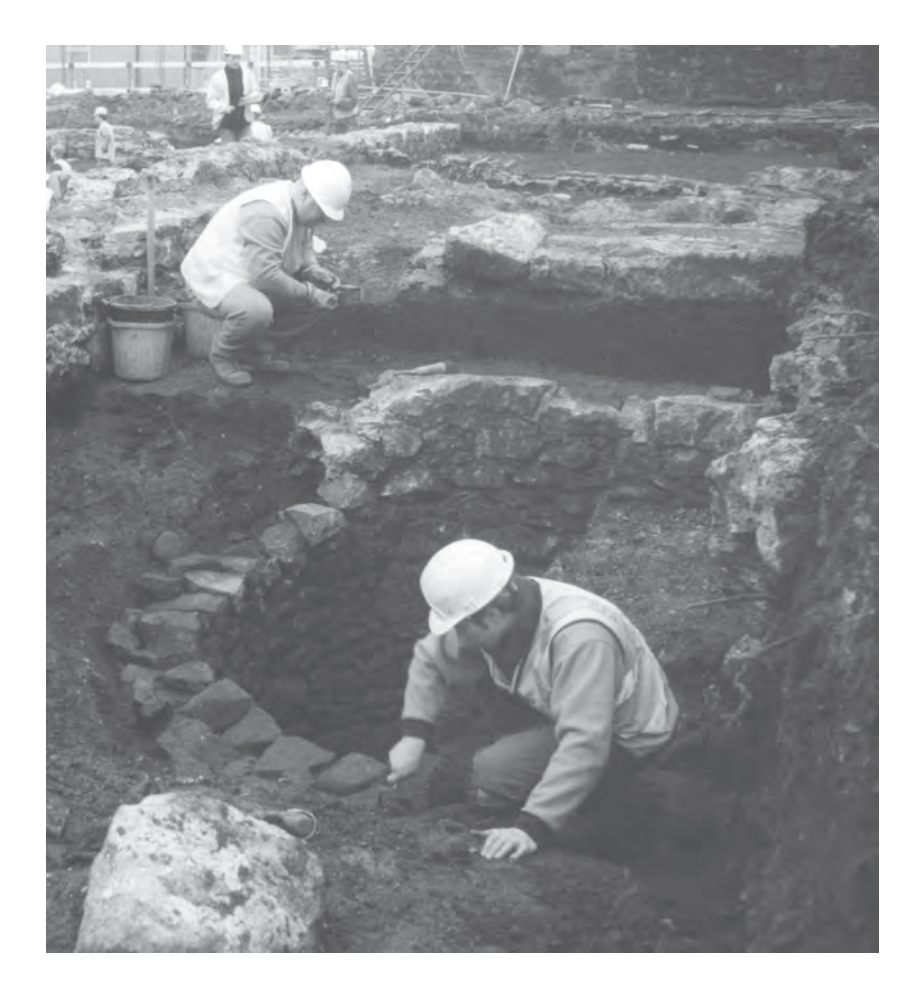
Figure 3.18 Excavation of a well behind Haddington House

Some irregular features (916, 923 & 927) were present to the south of these pits. All were fairly irregular and had fills similar to the neighbouring drainage features. For this reason they are interpreted as features within the formal gardens. A linear spread of lime mortar (708) was located close by, and seems likely to have represented another feature within the gardens. To the east were several irregular features (943, 950 & 960). These were not very well preserved but exhibited a similar fill and alignment to those in