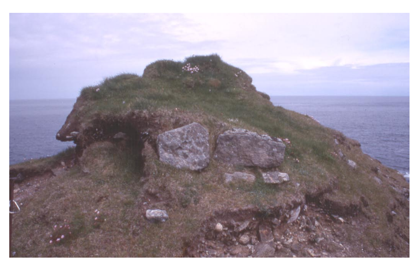
Illus 45 (above) The cairn on Creag Dubh from the east

Structure A was the slight remains of what seems to be a turf-built circular building c 10m in external