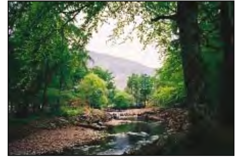
Illus 558: Mixed woodland along the Applecross River. Back to Section 8.2.6.4

The Applecross River enters the Inner Sound at Applecross Bay, north of the settlement of Applecross. The vegetation here ranges from rough grazing to mature mixed deciduous woodland and spruce plantations (see <u>Illustration 558</u>, right). The majority of the higher quality, but still coarse, grazing pasture lies on the flood plain area to the south and south-west of Hartfield. Remnants of cotton grass heads, small areas of Juncus and lady's smock (Cuckoo flower) were observed in this pasture. In the mature mixed woodland between the bay and Applecross house, wood anemone and bluebell were observed in abundance in a deer-fenced exclusion zone. The land surrounding the river comprises a number of soil patterns. Soils covering the immediate floodplain are generally sand to sandy loam.