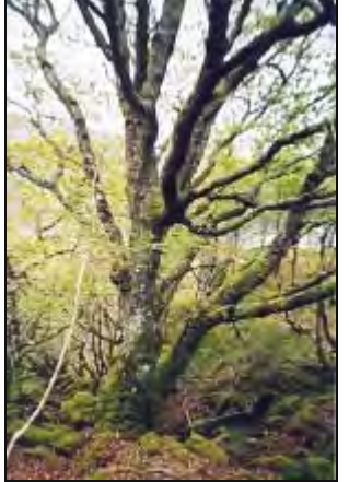
Illus 564: Mature birch

The woodlands are mainly linear in shape. Originally, it was intended to survey ten metre-wide transects of each woodland, but this was not always practical due to the steepness of the terrain and existence of narrow shelves or ledges of rock. The area was thus traversed wherever the terrain permitted. Most of the plants were identified to species level and the rest to genus. Obviously, a survey of this type is limited to the plants that are in evidence at the time of year (May in this case). As these are deciduous woodlands, however, most of the flora is spring flowering. The frequency of each species of tree is reported as a percentage of the total number of trees and the same for the understorey plants.