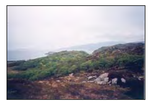
Illus 560: Birchwood near Toscaig

Much of this area is located on Aultbea formation sandstone with Toscaig itself located on the edge of a low raised beach. There is also an area of alluvium brought down by the River Toscaig from Coire Dubh. The land rises steeply to the west and east of Toscaig. Most of the area surveyed is covered by blanket peat and heather moorland, with small (~0.5m) silver birch saplings and bog myrtle ( Myrica gale ) found locally. Silver birch is found most commonly near rocks and rocky outcrops where peaty or organic layers were thinner (less than 0.4m), and in rock fissures. Parts of the Toscaig peninsula have been fenced off to reduce deer damage and help regenerate woodland (see <u>Illustration</u> <u>560</u>, left). Anecdotal evidence from a local resident suggests