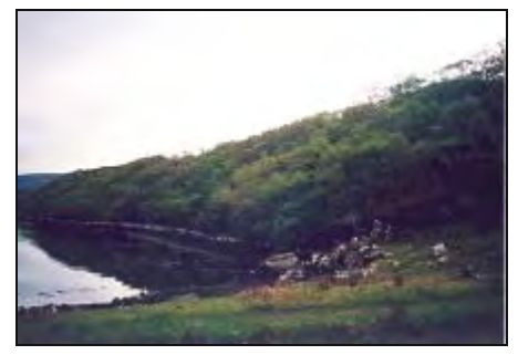
Illus 559: Birchwood at Culduie

An area of blown sand surrounded by Aultbea formation sandstone but with peat in the hollows. The inlet on the east side of the Ardban peninsula (NGR: NG 703 392) forms a depression through the landscape. This is only about 15m wide but it holds a soil with humose sandy loams. The vegetation is moss and Juncus with celandine nearby and pockets of woodland grow along the coastline with silver birch, oak and possibly rowan (see <u>Illustration 559</u>, right). The majority of the soils at NGR: NG 701 396 have formed on blown white sand formed from calcium carbonate-rich