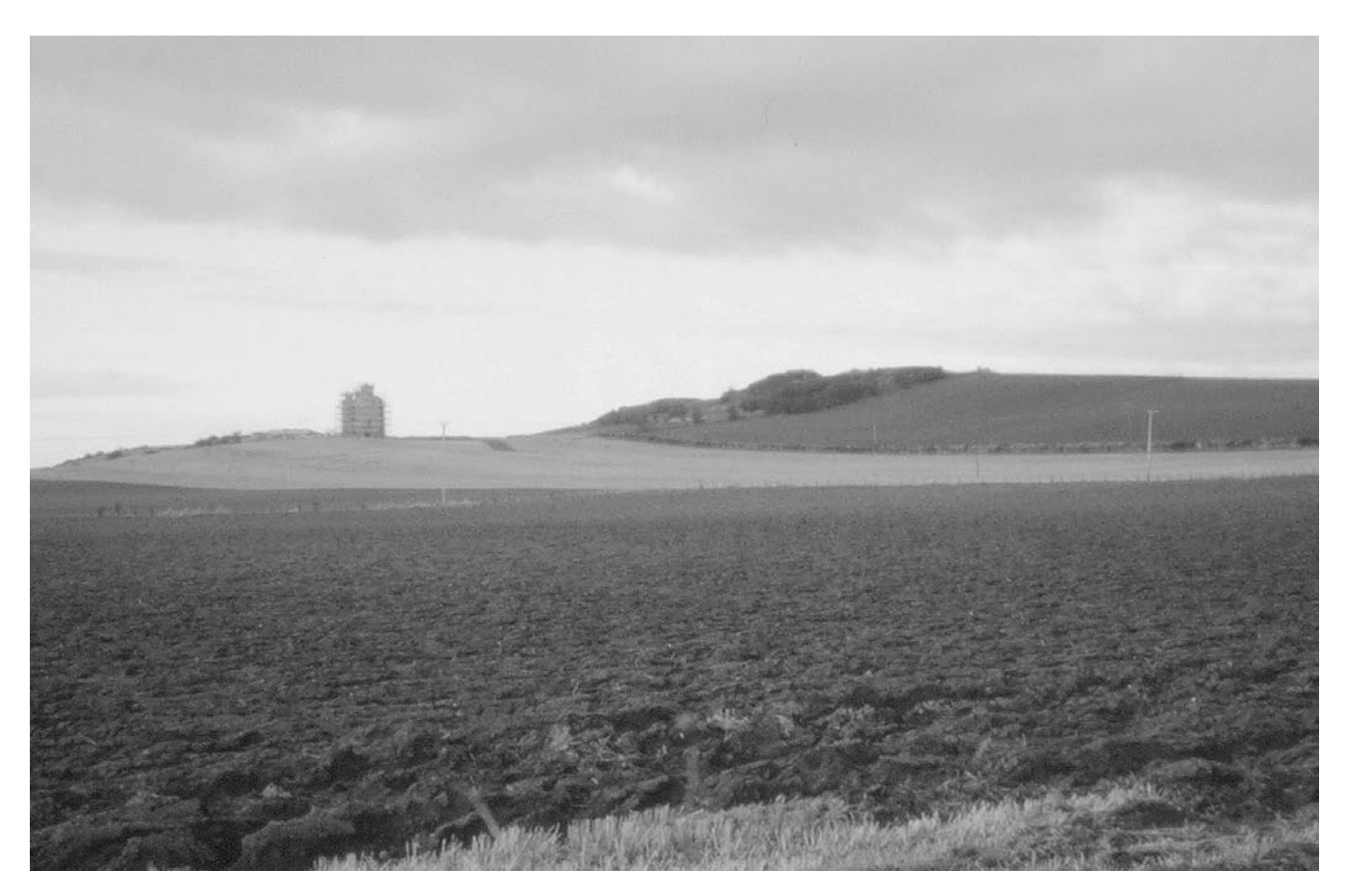
Plate 2 Kingston Common and Fenton Tower, from near Rockwell Farm