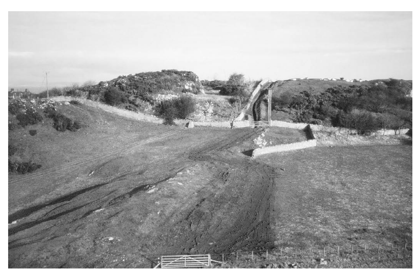
Plate 1 The view from the parapet of Fenton Tower showing the Common on the horizon, with the water pipe trench adjacent to the field wall and the quarry on the left