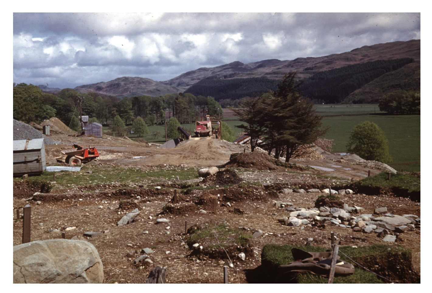
Illus 3 Site under excavation, looking north-east towards Kilmartin, showing quarrying operations in progress around the excavation

The site had an excavation grid (Illus 5), but only some of the squares within it were fully excavated and recorded. Entire squares were removed without anything significant being encountered, and others containing significant features only underwent partial excavation and test pitting. Accurate depth measurements and the full extent of different contexts were not usually recorded. There was no systematic numbering of contexts, though post-holes were numbered. This was normal procedure for the