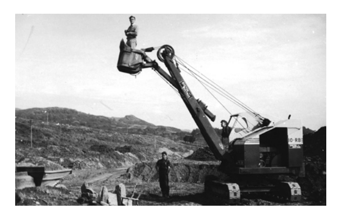
Illus 4 Utilizing quarry machinery as a photographic platform (pre-Health and Safety days!)

time; however, the lack of context planning means that there is no way of reconstructing any possible chronological horizons within the main occupation layers (context 003). This is particularly frustrating as the site was clearly multi-period, with significant occupation in the Iron Age and Early Historic periods. However, very detailed descriptions, plans and sections of features such as post-holes were recorded, along with over 600 photographs, mainly colour slides and lists of finds. This very extensive archive was worked on by the excavators over some 30 years in an attempt to unravel the complexities of the site, but it has to be admitted that no comprehensive account of the site can be given based on this material.