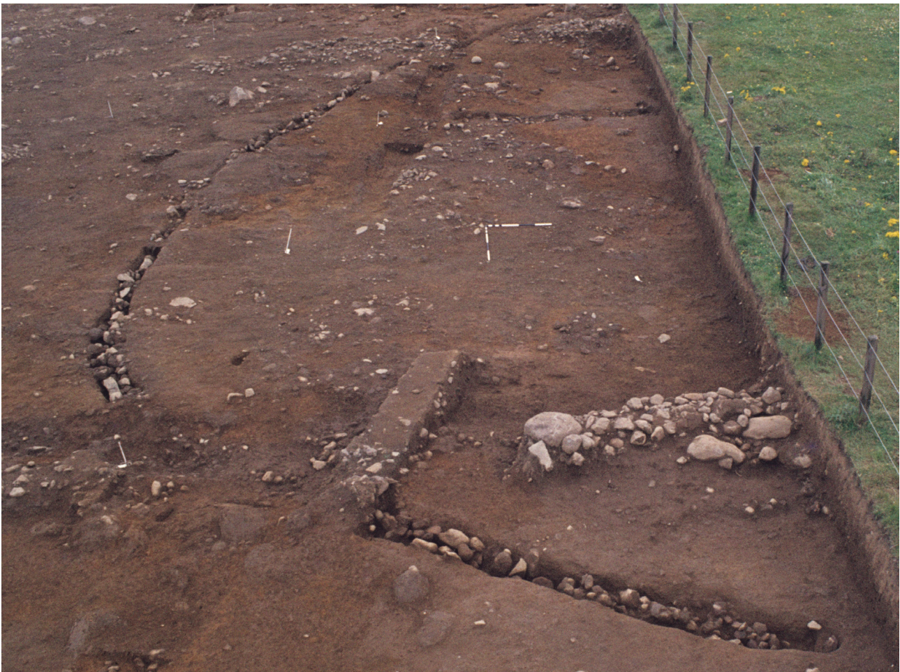
Illus 7.1 Palisaded enclosure from east, with rectangular structure visible top centre

At the northern limit of the excavation area to the south-west of the fort, on the east side of Area R,