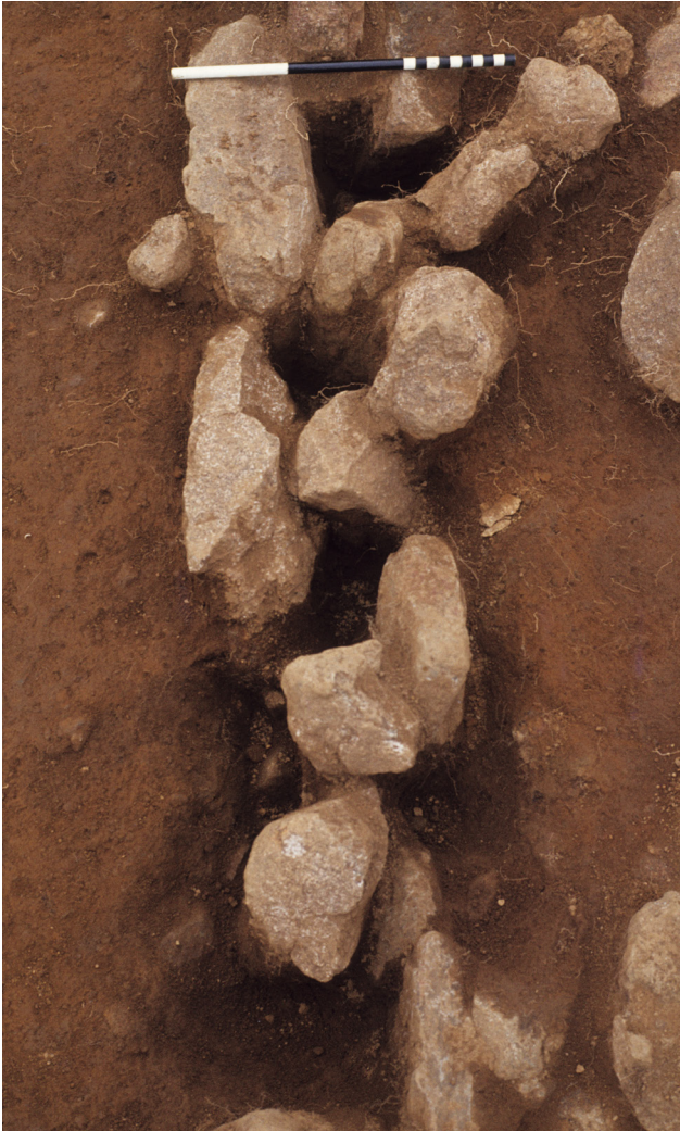
Illus 7.4 Detail of palisade trench (RAB/LAX), showing stone chocking near western end