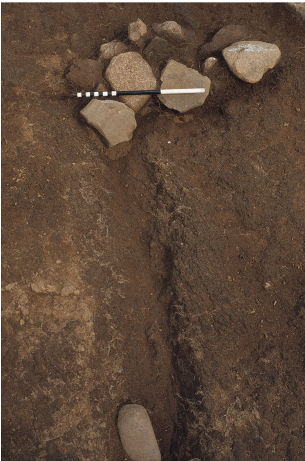
Illus 7.2 Central sector of palisade RAB cut through bedrock viewed from the west. Shallow depression RAY, filled with stones, is visible at the top

The only finds from the palisade trench were three small fragments of Roman pottery. A Roman date for the structure, however, is highly improbable (see 7.3, below), and this is confirmed by its relationship with an intersecting Roman gully on the east side. As the gully (LET/RAC) curves slightly to the east,