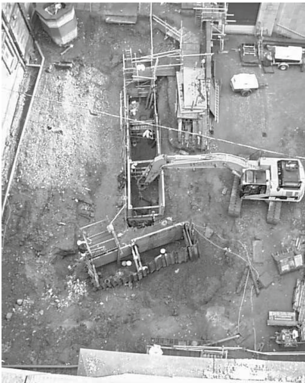
Illus 3 View of site from west

Courts at Parliament House. A series of watching briefs identified the presence of human bone at a depth of between 4m and 8m in the Southern Courtyard, leading to archaeological evaluation of the courtyard (Illus 2 & 3) in late 2004.