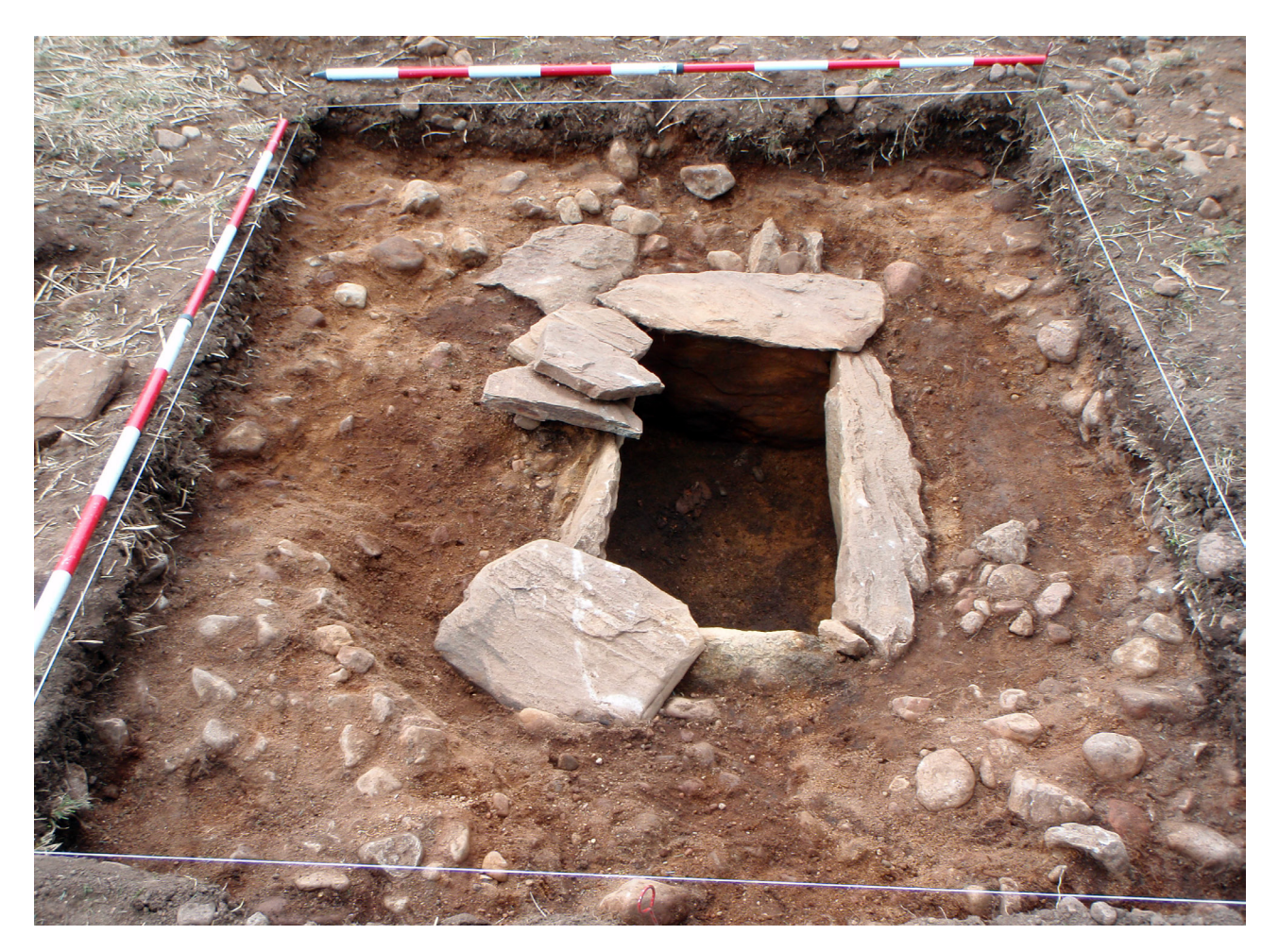
Illus 3 The cist before excavation, from the east.