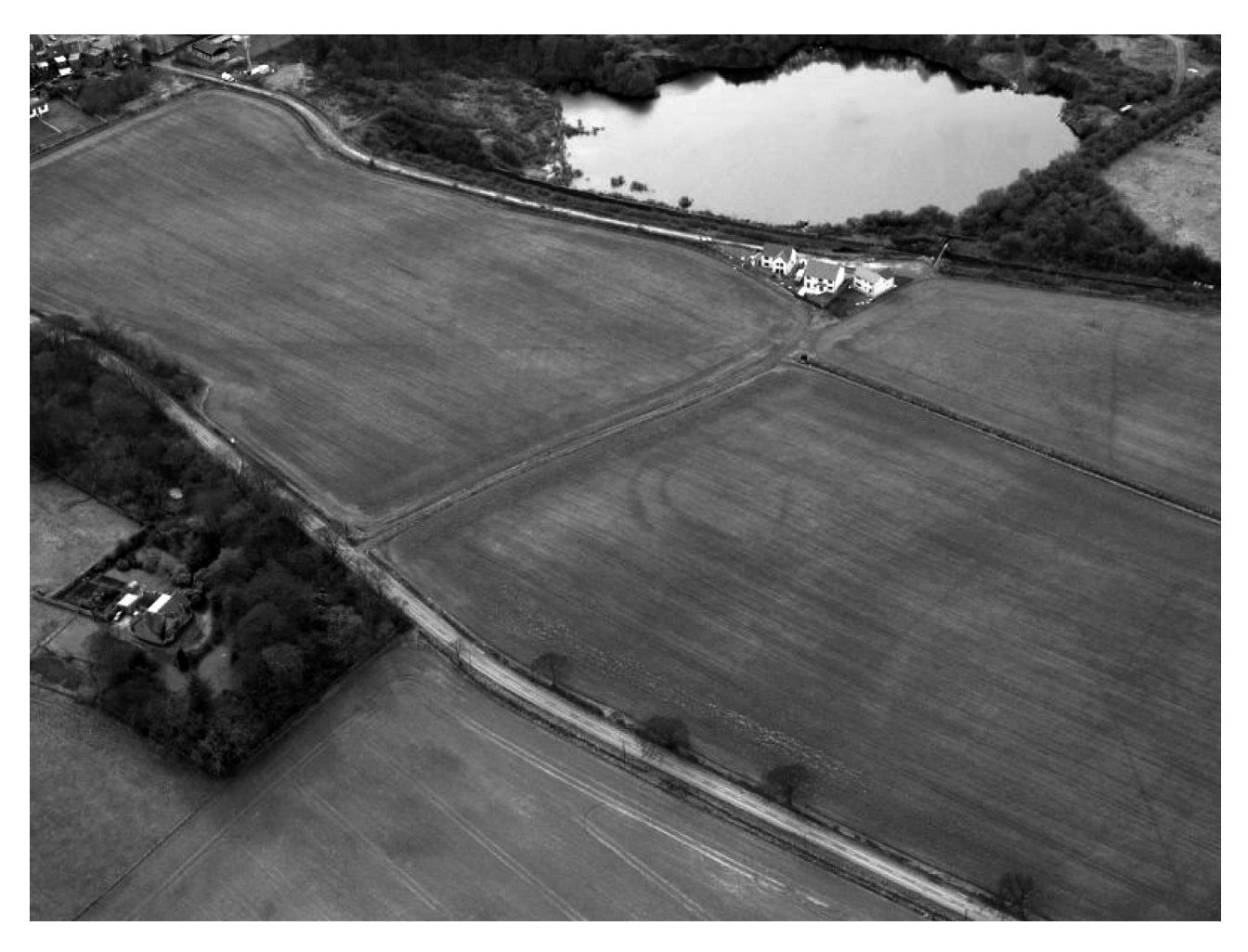
Illus 2 Aerial photograph showing enclosure. Taken from the north-east.

double-ditched enclosure. The investigation confirmed the presence, nature and extent of the ditches, leading on to a further programme of open area excavation between July and October 2013.