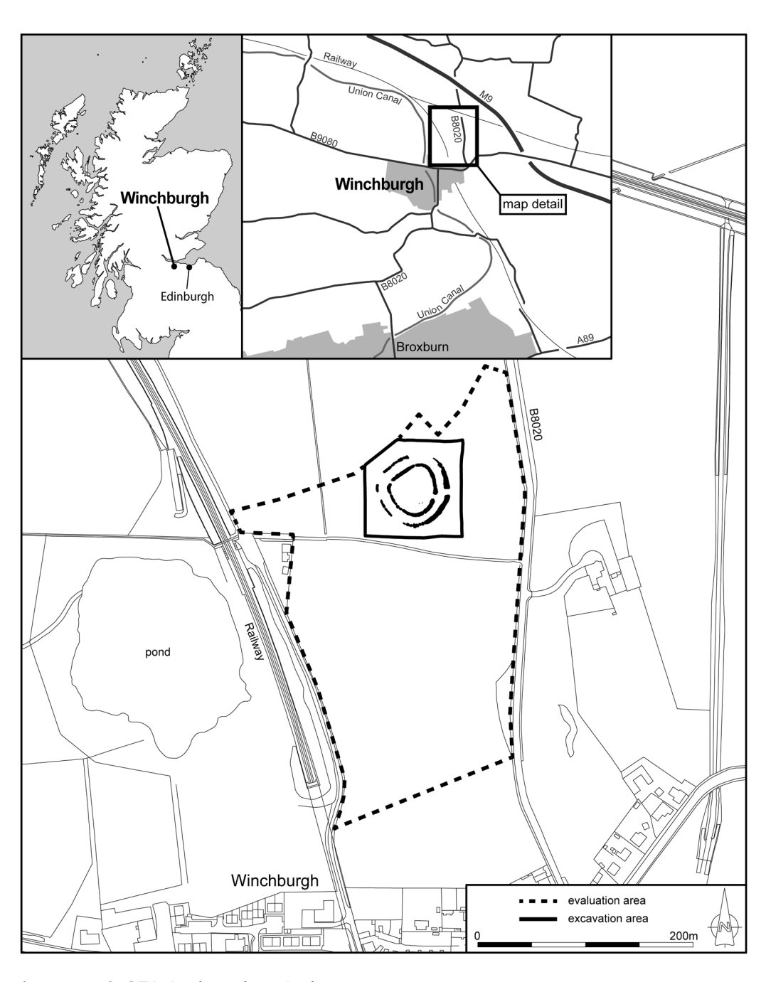
Illus 1 Location map.

A double-ditched enclosure (NRHE Site No. NT07NE 127) was identified from aerial photography, the details of which were provided by the West of Scotland Archaeology Service (WoSAS) (Illus 2). An evaluation was undertaken by CFA in April 2013 ahead of the housing development in order to confirm the presence of the enclosure (Glendinning 2013). Sixty-three trenches (8% of the total development area of 6.62ha) were excavated within the development area. Eleven trenches were positioned to investigate the