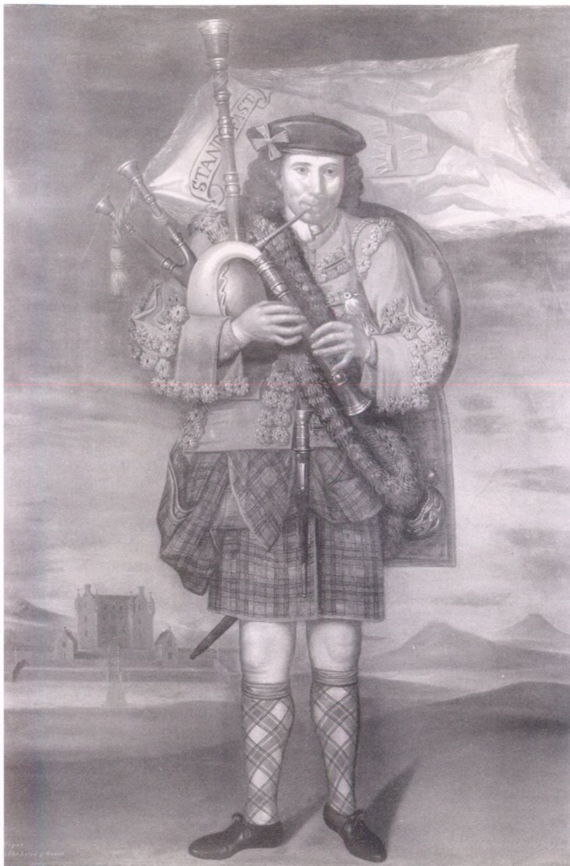
ILLUS 1 Piper to the Laird of Grant (1714) by Richard Waitt, oil on canvas, 2.13 m by 1.54 m (Courtesy of the Trustees of the National Museums of Scotland, OD 69)