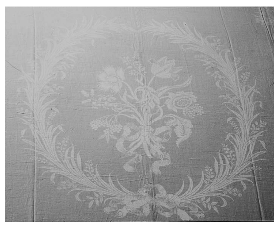
ILLUS 3 A bouquet of flowers tied with a ribbon and surrounded by a wreath of leaves and flowers