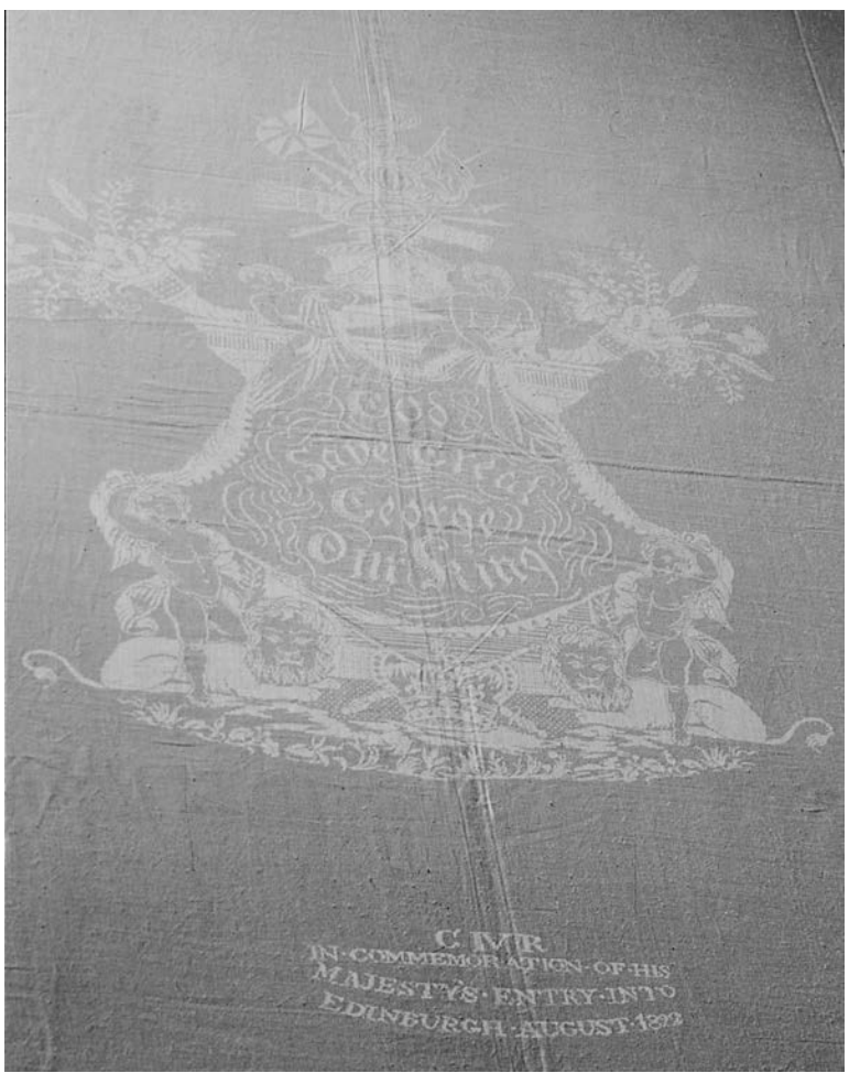
ILLUS 2 The centre-piece, inscribed 'God Save Great George Our King' upon a fringed banner

the top and bottom border. Other letters and numbers, '12 IG 28' are also embroidered at the edge of the cloth in white linen. The cloth bears the appropriate neoclassical symbols for the dining room. In the centre a trophy of arms is emblazoned with a banner supported by cherubs bearing the inscription 'God Save Great George Our King'. Two replete and peaceful lions lie on either side of the state regalia. Below is written 'G IV R IN COMMEMORATION OF HIS MAJESTY'S ENTRY INTO EDINBURGH AUGUST 1822' (illus 2). Above this device is a large