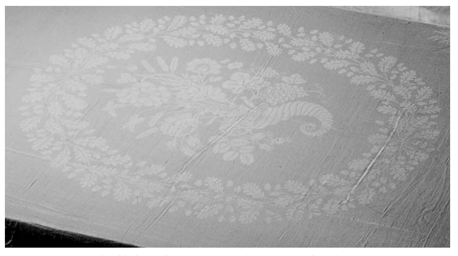
ILLUS 4 A cornucopia of fruit and flowers surrounded by a wreath of oak leaves

of the table cloth and its border. But in place of the figures of Ceres, four small thistles are placed towards each corner. The allusions are