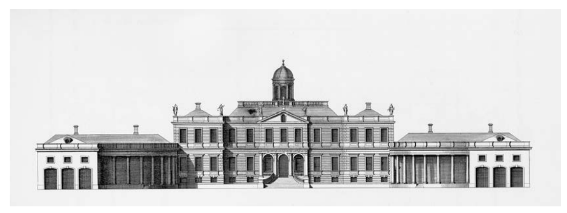
ILLUS 4 Hopetoun House: East (main entrance) front designed by Sir William Bruce. Elevation published in Colen Campbell's Vitruvius Britannicus, ii (London, 1717), pl 76

state floor). Also like Vaux, the paired lesser staircases on the spine were set inwards from the ends (at Coleshill, and Vaux's basement level only, stairs lie beside the end-walls). Again like Vaux - and unlike Coleshill - each apartment at Kinross was served by a small, private or service stair. While Coleshill was flat-fronted and externally plain with massive stacks, Kinross's design was more showy, sophisticated and vigourous, with emphasized end 'blocks'; albeit not as vigourous - nor as rich – as Vaux, eschewing the baroque curves of contemporary France (though the flanking screens were curved on plan).