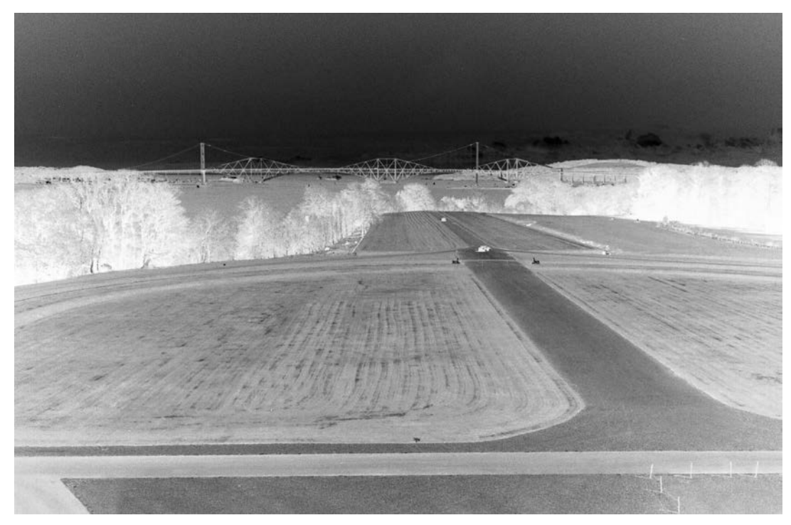
ILLUS 5 Hopetoun House: view from roof showing vista towards Inchgarvie and (not seen) North Berwick Law, beyond

course, with a clientele receptive to or themselves advocating such ideas - who confirmed the classical house as the only fashionable option. In the same decade that witnessed a royal architect (Smith) building one of the last great castles (Drumlanrig Castle), Bruce had validated the 'anti-castle' at Kinross House, relegating the concept of the 'castle' to an object to be viewed in the landscape, like a garden monument or pavilion. The viewing of both nature and the national 'antique', exemplified by Bruce's works, was reproduced elsewhere; for instance in 1708 at Corra Linn where a viewing pavilion overlooks both the Falls and the ruins of Corra Castle. The status of the castle remained that of a lesser building, unsuitable for occupation, until the first new castle, Inveraray, was built in the 1740s, and ancient castles came to be re-occupied, as at Castle Huntly, from 1776.38