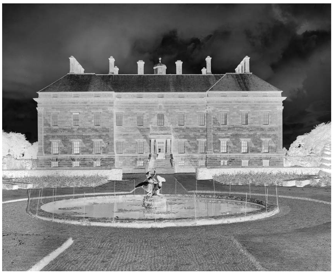
ILLUS 2 Kinross House: garden front, facing Lochleven.

for instance, at the Palais de Luxembourg or the Palais de Justice at Rennes (1618). The idea had been more recently used at Cheverny (1634), combined with channelled facades, such as Bruce would later introduce to Scotland at Hopetoun. Le Vau's Collège des Quatre Nations (1662–70) fronting the Seine in Paris, opposite the Louvre, might similarly have suggested the idea to Bruce. Kinross's profile perhaps owed something to mid- to thirdquarter-century English houses such as Thorpe Hall; and the spinal, or 'double-pile', formula is often said to derive from the same source. Coleshill (c 1650-62, by Inigo Jones and Sir Roger Pratt) has been traditionally cited in this connection.34 But the story is clearly more complex; not least because a