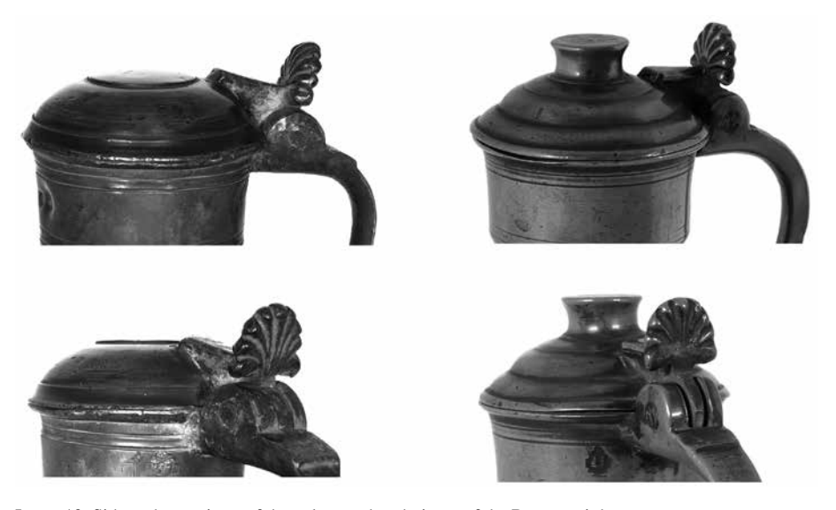
ILLUS 12 Side and rear views of the palmette thumbpieces of the Bute tappit hens