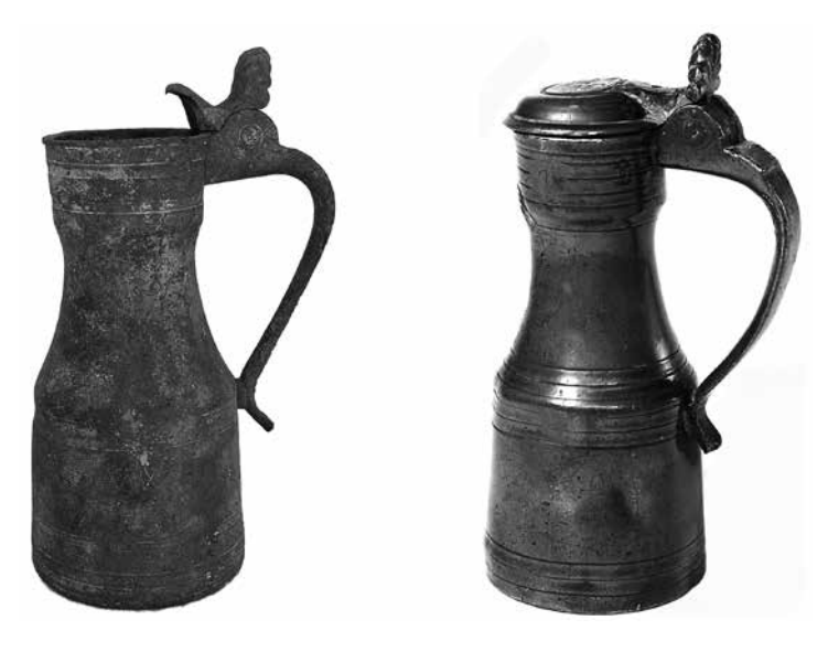
ILLUS 13 The two early 18th-century chopin tappit hens

1736'. It has been established that this couple from Newton, Midlothian were married in 1734 (Scotlandspeople online). It is not known, however, whether the engraving was