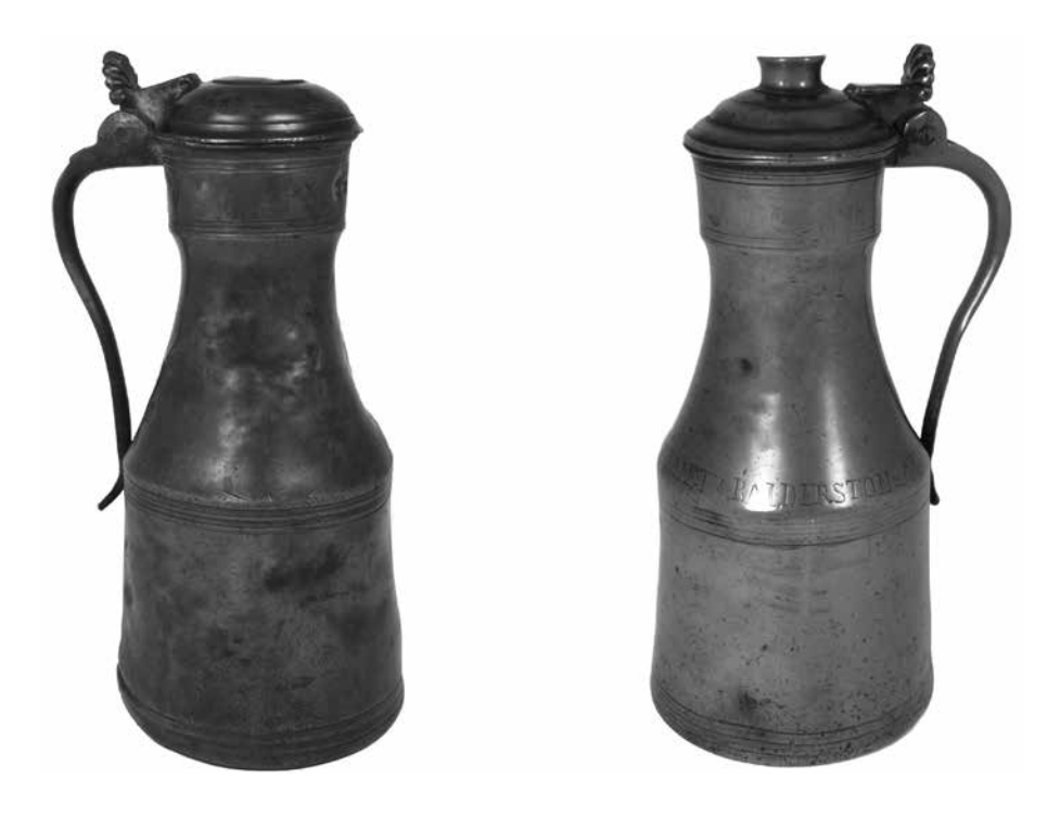
ILLUS 11 The two massive Bute tappit hens of Scots quart capacity