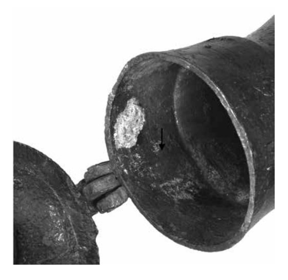
ILLUS 3 The vertical seam (arrowed)

recognisable tappit hen shape. The largest is a Scots pint, the second is a half-pint, or chopin, and the third is one-eighth of a pint, commonly referred to as a half-mutchkin