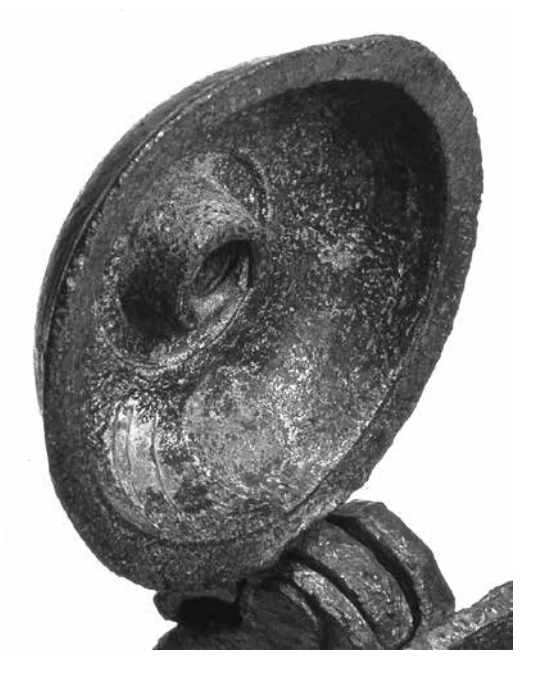
ILLUS 5 Inside of the lid of the pint measure to show the projection with screw threads

On the inside of the necks of the pint and chopin measures, to the left of the handle and just below the rim, is a blob of