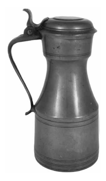
ILLUS 1 An 18th-century tappit hen

(Ingleby Wood 1904, plate XXII) dating to some time after 1669, when the maker became a master pewterer. It had never been subject to detailed examination and several interesting features had been overlooked. However, the recent discovery of three tappit hens from the wreck of the Swan , a small mid-17th-century warship, together with the recognition of four very early 18th-century examples, previously overlooked in private collections, enable us for the first time to piece together the early evolution of this eponymous Scottish measure.