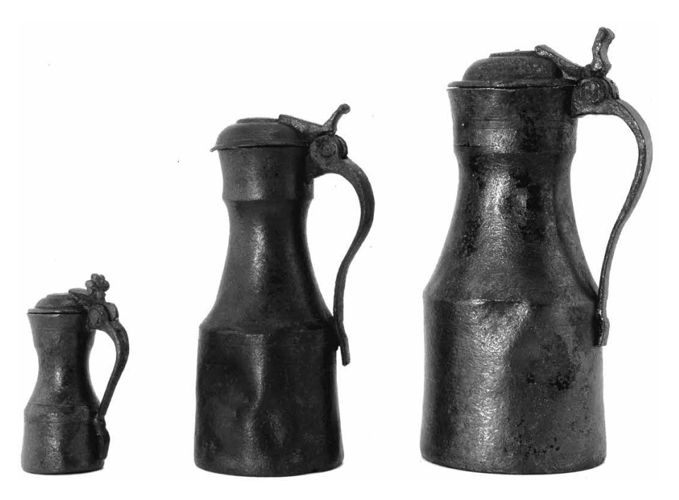
ILLUS 2 The three Swan tappit hens of half-mutchkin, chopin and Scots pint sizes

two other ships sank in a terrible storm on 13 September 1653, just a few metres off Duart Point. Her wreck was discovered by a naval diver in 1979, but the site was not properly excavated until 1992, when seabed disturbances put the wreck in danger of destruction. The subsequent excavation under Dr Colin Martin of University of St Andrews, uncovered a wealth of objects including cannon, the ship's binnacle, decorative carved woodwork and three tappit hen measures (Martin 1995: 15–32; Martin 1998: 46–66).