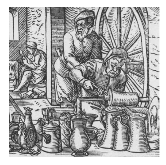
ILLUS 14 16th-century woodcut showing a pewterer finishing a flagon on a wheel lathe

base does not bear any mark. The hinge and thumbpiece are again both heavily cast. The thumbpiece is a palmette, but with the lobes less pronounced on the rear. One notable difference is that the attachment to the lid is now a thinner strap of metal that follows the contours of the dome of the lid. In this it anticipates the attachment seen in all later forms. The handle is of D-section.