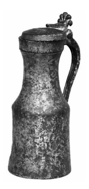
ILLUS 15 French flagon c 1600 from Rouen in Normandy

pewterers. In the 17th century, Edinburgh had extensive trade links, via the port of Leith, with northern European countries, but particularly with France and the Low Countries. Both of these countries appear to have influenced the form of the tappit hen measures. The body shape was very clearly derived from the north-west of France, from where extensive wine imports were made (Kay & Maclean 1983). Boucaud<sup>4</sup> notes that the 'shouldered' body form of early flagons and measures was peculiar to that part of France, and was not found elsewhere in Europe. The flagon from Rouen shown in illus 15 dates from c 1600, and the similarity of the body outline to the tappit hen form is immediately obvious.