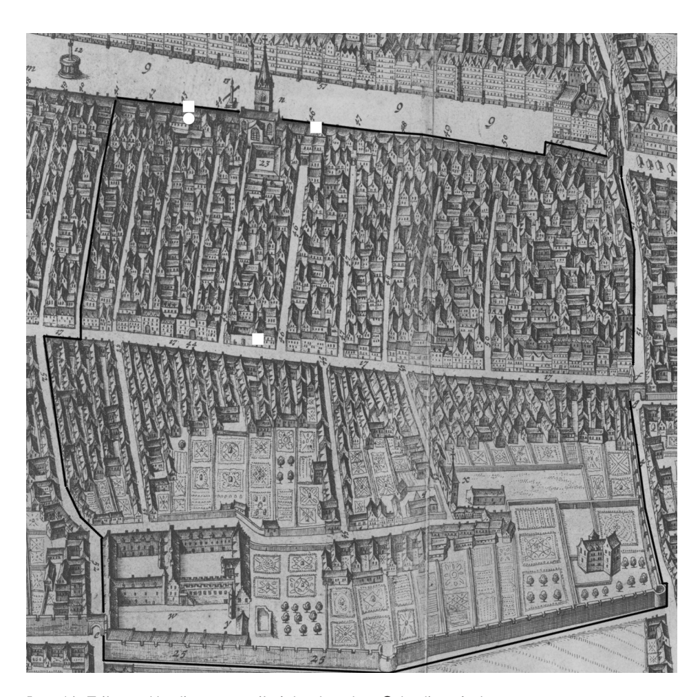
ILLUS 14 Tailors and brodinsters: ■, tailor's booth or shop; ●, brodinster's shop