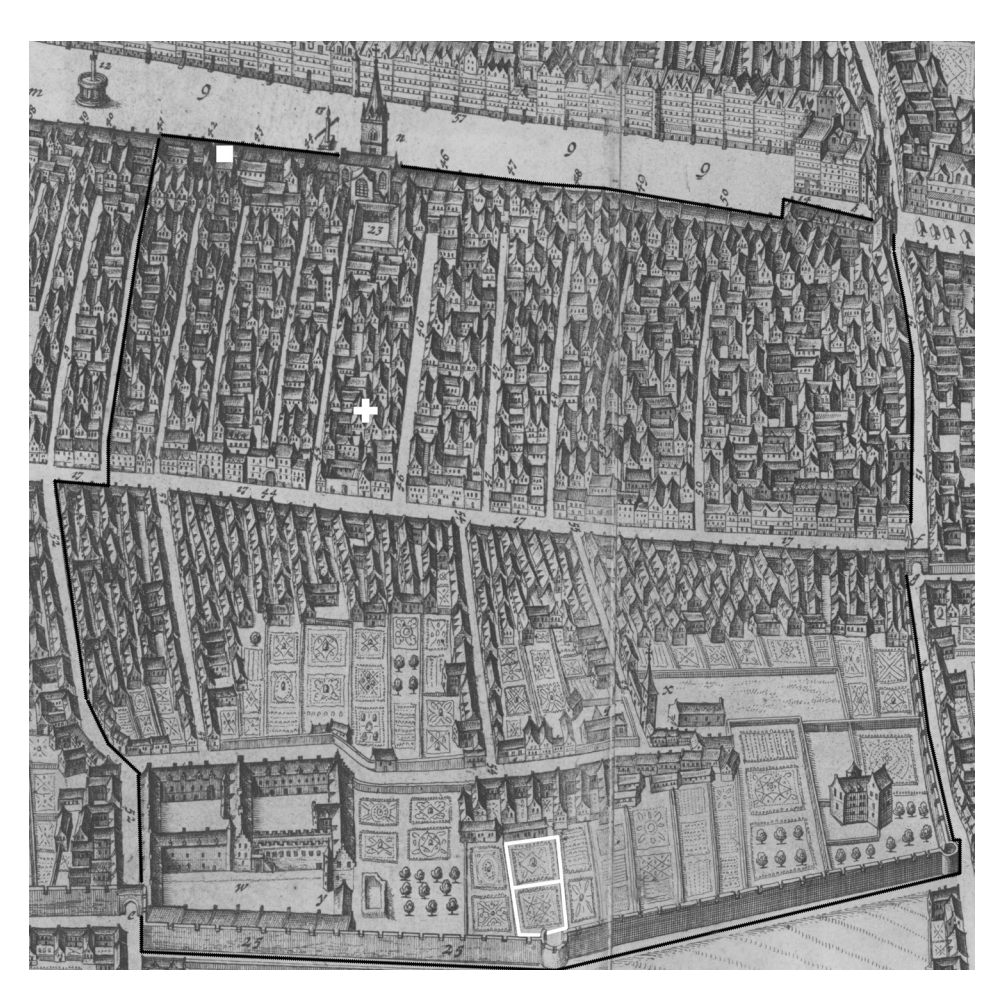
Illus 17 Medical trades: ■, barbour's booth; ♣, hospital; white line, Apothecary's Yards