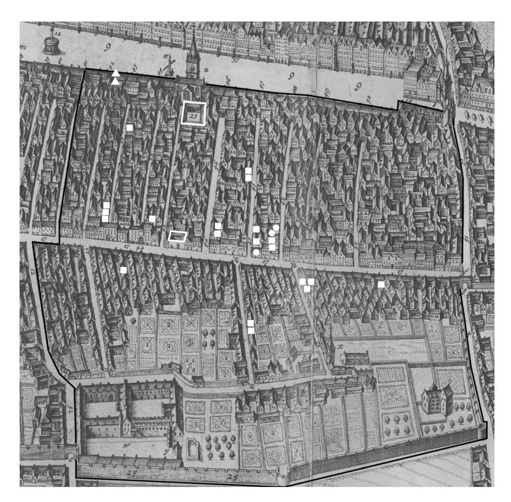
Illus 10 Fleshers: \blacksquare , slaughterhouse/booth; \blacksquare , flesher's booth or shop; \triangle , poultryman's booth; white line, market areas