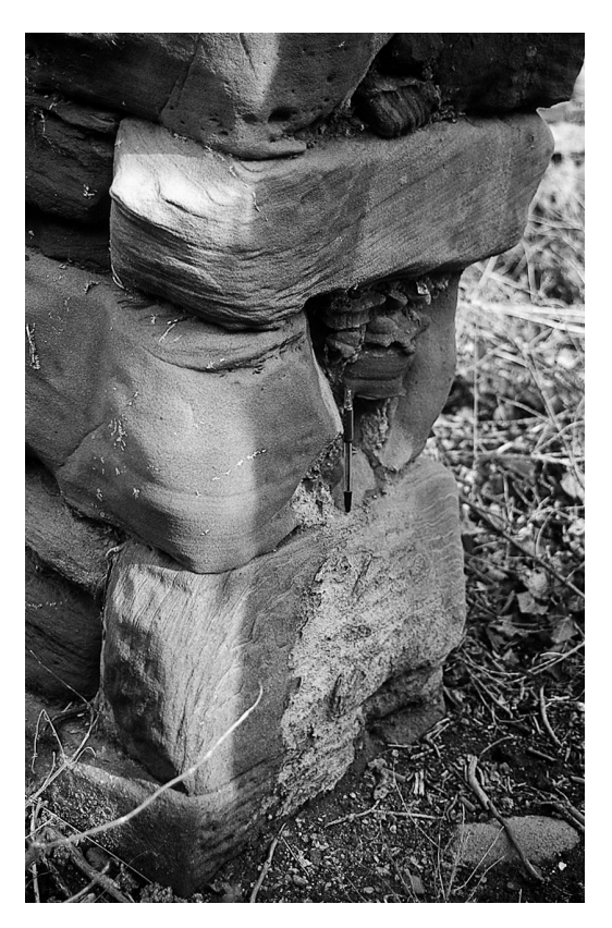
Illus 3 The northern jamb of the chancel arch of the ruined Preston church (Table 1) viewed from the nave. Constructed of well-bedded Upper Devonian sandstone, the visible jamb stones, from ground level upwards (pen for scale), can be read as BH, BVFIA (through stone), BH, BH (through stone). The arch stones have been replaced and are probably of Post-Reformation date

As in England, Norman written records describing the construction. modification and patronage of churches in Scotland are significant and far superior to those relating to the pre-Conquest period. With clearly