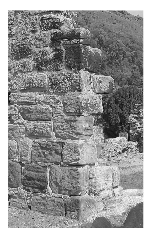
Illus 2 The south-west quoin of St Serf, Kirkton, Burntisland (Table 1), is built of relatively large, side-alternate quoin stones. From the ground level upwards the bedding orientation of these stones may be read with a hand lens as; stone 1, ?; BVFL; stone 3, ?; BH; BH; BVFL; BVFR; BH. The whole quoin structure is representative of Saxon-style workmanship

evidence in the form of stone crosses and early Christian inscriptions (such as those detailed by Allen & Anderson 1903) and the historical record, provide confirmation of significant Christian activity in Scotland from as early as the fifth and sixth centuries. Yet there has been very little indication or recognition of early ecclesiastical stone buildings to house and support this Scottish religious activity. As centres of early Christian influence, the claims of Iona and Whithorn are certainly as important as those of Canterbury and Lindisfarne in