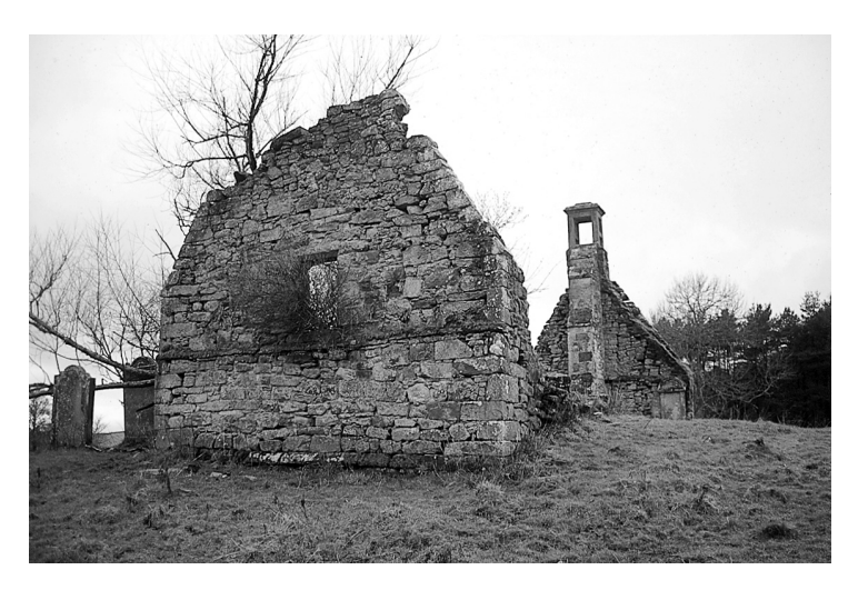
ILLUS 4 What remains of the east wall of Abbotrule ruined church (Table 1) displays some interesting modifications. The string course fails to run parallel to the wall plinth (the south-east corner is 0.17m shorter between the two than the north-east corner). Stones above the string course are smaller and less well coursed, suggesting that the wall has been rebuilt above that level. This is confirmed when the quoin stones are examined. Below the string course at least three of the stones in each quoin have been emplaced vertically in Saxon-style. The absence of both the string course and the plinth in the north and south walls does, however, pose the possibility that the quoin stones may have been re-set

no more than one or two courses high with all or most quoin stones removed. In these church sites only one architectural feature remains, that of the wall plinth (in Scotland, sometimes referred to as the 'base' or 'basement' course). A number of early church structures itemized in Table 1 are supported on plinths which closely resemble their English Saxon counterparts: examples are, Auld Cathie (below quoin) and Glenearn (below east gable). Various other ruinous ecclesiastical sites examined possess plinths of simple square section indicative of possible pre-Conquest date. Some of these, such as Bassendean (NT 631 457) and Glenduckie (NO 300 184), support quoins in which there is limited evidence of vertically orientated stones. The church of Rodil (Rodel) in Harris (NG 047 833) is customarily considered to have been built in 'the early 16th century' (RCAHMS 1928, 33; Fawcett 2002, 343). Aspects of this church, however, suggest that it was rebuilt at this time, and in the vicinity