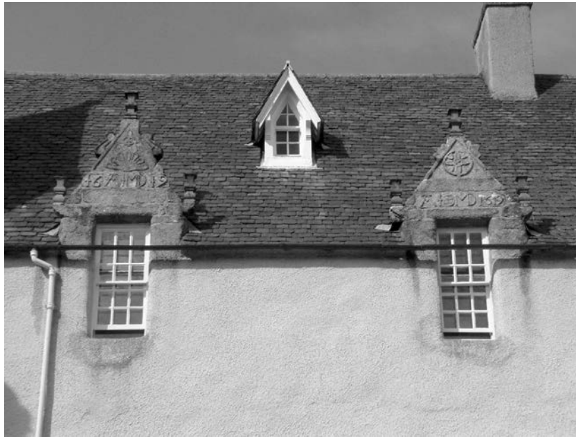
ILLUS 3 The south wing of Drum Castle ( Scottish Episcopal Palaces Project )

century to fill windows in the uppermost storey of the north wall of the towerhouse.