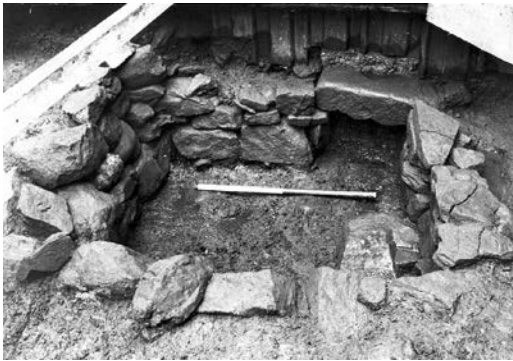
ILLUS 10 Mill Street, Perth. A large cesspit

buildings, but internal latrine pits have been found at Kirk Close, Perth (complete with graffiti-covered toilet seat), and at High Street, Edinburgh. They can be stone-, timber- or clay-lined, which suggests they were cleaned out regularly, and can be served by complex flushing systems (illus 10). As with many other types of pit, they were often dug for one purpose and re-used for another. At High Street, Elgin, four plots complete with wattle fences were uncovered together with 30 well preserved cesspits. Two possible cesspits were found at Loudon Hall, Ayr: one was clay-lined with a surrounding fence for privacy, while the other appears to have been stone-lined. At 42 St Paul Street, Aberdeen, there was a stone-kerbed cesspit and another with stones in the base as soakaway. At Castle Street, Inverness, a timber-lined cesspit found close to the frontage was also used as a rubbish-pit. Cesspits were also found within yard areas on the frontage of 45–7 Gallowgate, Aberdeen. At Canal Street I, Perth, a stone-lined cesspit in the backlands was flushed by a drain with a sluice and served a late medieval stone building which lay across the former plot boundary. Similarly, in the backlands of North Street, St Andrews, a cesspit was fed by a stone drain. A group of pits found at Scott Street, Perth, appears to have been part of a complex sanitation system dated to the 14th or 15th century.