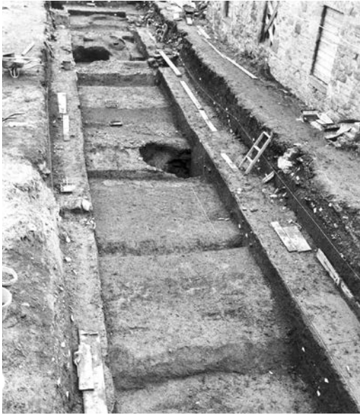
ILLUS 2 Canal Street II, Perth. Shallow gullies mark out the six medieval properties

holding of land in a burgh. The Scots acre (c 5142sq m) is thought to have been larger than the English acre (c 4047sq m) and to have defined a stretch of arable land 258m (a furlong) in length by about 19m in width (Barrow 1981, 173). If this rural unit of landholding was being used in burghs and was simply being divided into four equal strips, a standard Scottish burgage plot should, therefore, measure 4.8m in width by 258m in length. Using an English acre (140 square poles), a rood would equate to each plot measuring 5.2m by 201.2m; that is one pole wide by 40 poles long.