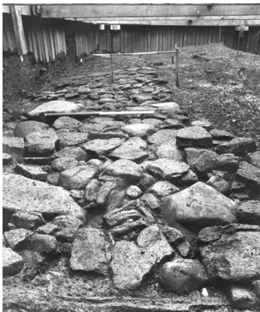
ILLUS 6 Mill Street, Perth. The cobbled road

Although gravel paths are most common, and were no doubt cheap and quick to construct, considerable effort went into some pathways, as at Marks & Spencer, Perth, where the boggy conditions required something more substantial. Here, a wattle path was laid down c 1150 which led through the backlands to various buildings, workshops, byres and storehouses. At 42 St Paul Street, Aberdeen four irregular plots were laid out c 1200. In the early 14th century these plots were reorganized to create more regular sized plots with a cobbled path between the two central plots. In the 15th-17th century, these were amalgamated and the path lost. Some paths were wide enough to function as roads or public routeways within the town. One path at Kirk Close, Perth, was wide enough for carts and led from High Street into the backlands, directly to a bakery. At Mill Street, Perth, a roadway, with associated drainage and a timber fence along one side, led from High Street into backlands and had been constructed over an earlier ditch and stone wall (illus 6). At Garden