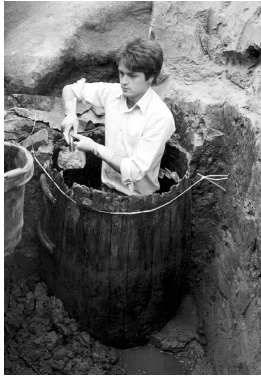
ILLUS 9 Scott Street, Perth. A barrel-lined pit or water-butt

Quarrying is often one of the earliest recognizable forms of activity on many excavated sites. Examples include Marks & Spencer, Perth, 77–9 High Street, Arbroath, Canal Street III and Scott Street, Perth, Castle Street and 45–75 Gallowgate, Aberdeen. Some quarrying activity was more intensive, while in other cases a small pit was probably enough to provide enough sand or clay for a floor. A quarry pit in the centre of the backlands at 134 Market Street, St Andrews, for example, was so large it had two steps cut into it for access. Similarly, a rough step was cut during quarrying in the frontage of North Street, St Andrews.