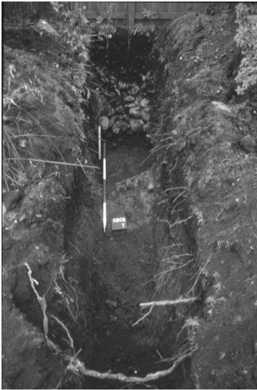
Illus 4 Back Dyke/Tanpit Lane, Kirkcudbright. The back dyke marking the end of the medieval plot is buried under garden soil

two sites in Kirkcudbright, Corby Slap and Tanpits Lane, stretches of rubble walls with an associated ditch were uncovered (illus 4). The differences in construction within the fabric of the walls would appear to be the result either of different techniques employed by respective plot owners or repair work over the years. At High Street, Edinburgh, the heid dykes backing onto Cowgate were later incorporated into the town's defences. Town walls and abbey precinct walls also provided a convenient opportunity to build lean-to structures. The King's Wall, Edinburgh, was built between 1425 and 1450, but by 1473 there was already a decree to pull down houses built against it.