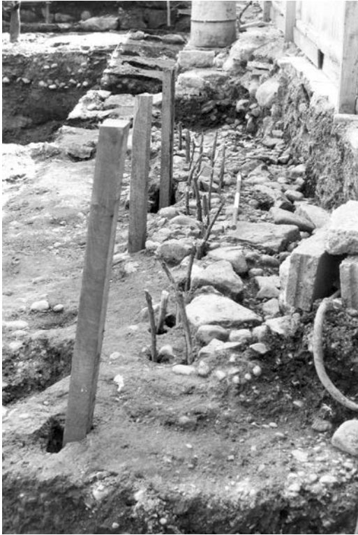
ILLUS 3 Castle Street, Inverness. A timber fence marks the edge of the medieval street

holes survive, but in some towns, where the soil conditions are favourable, the wattle hurdles, often hazel, also survive, as at several sites in Perth and Aberdeen. On street frontages, there is the added problem that stretches of wattle fence or lines of post-holes could also represent buildings as, in order to maximize the limited available space, building lines often doubled as property boundaries. At Castle Street, Inverness, a wattle fence marked the front of the plot but there was no actual building on the plot (illus 3).