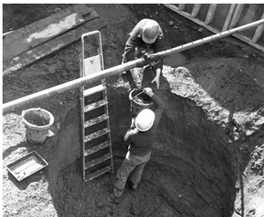
ILLUS 7 Canal Street I. A large quarry/rubbish pit

the sheer number of pits found on excavated sites, filled with domestic and craftworking debris, indicates that much was merely buried on the burgh plot. Whether the Black Death in 1349 led to an increased awareness of the need for hygiene, resulting in the formal removal and dumping of rubbish outside the burgh for example, is not clear but has been suggested as one reason why late medieval levels are less well represented by artefacts and other inclusions at the Marks & Spencer site, Perth (Bogdan 1992).