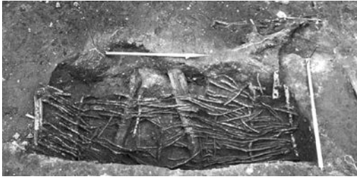
ILLUS 8 King Edward Street, Perth. A pit capped with a wattle lid

were for domestic refuse. Similarly, at 80–6 High Street, Perth, the establishment of a large number of pits on and near the frontage, filled with both domestic and craftworking waste, appeared to coincide with the absence of any associated structures domestic or industrial. At 42 St Paul's Street, Aberdeen, domestic settlement was replaced in the early 13th century by rubbish pits, cesspits and midden spreads; the number of rubbish and cesspits, in addition to extensive spreads of midden, then doubled after the plot boundaries had been reorganized c 1300.