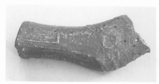
ILLUS 1 Unidentified drop, British Museum 63. 1–22. 139