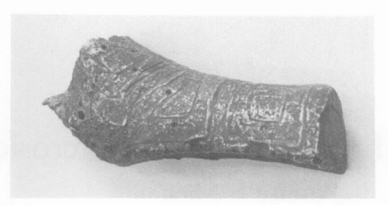
ILLUS 2 Unidentified drop, British Museum 63. 1–22.