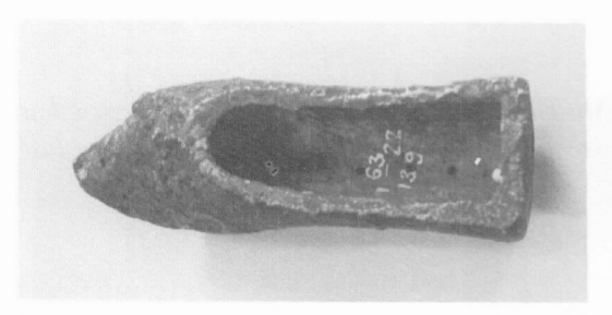
ILLUS 3 Unidentified drop, British Museum 63. 1–22. 139