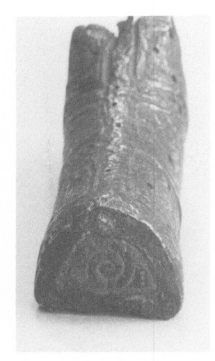
ILLUS 5 Unidentified drop, British Museum 63. 1–22. 139