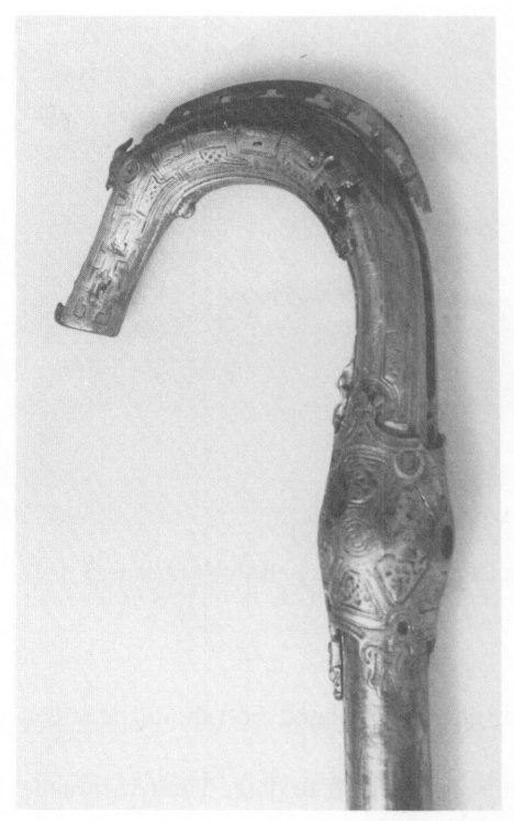
ILLUS 7 Petrie's Crosier of St Mura, National Museum of Ireland, P. 1015