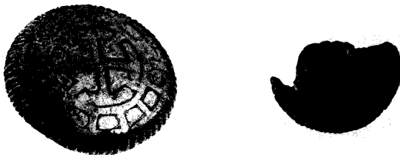
ILLUS 4 and 5 Enameled mounts from Balladoole, Isle of Man (diameter: 47 mm), and Newtownlow, Co Westmeath (scale 1:1)

Given the similarity in design between these three mounts, and between those from Balladoole