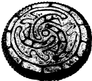
ILLUS 2 Enamelled mount from Balladoole, Isle of Man (diameter: 41 mm)