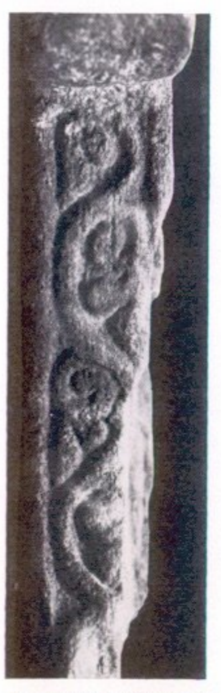
d Detail of left edge