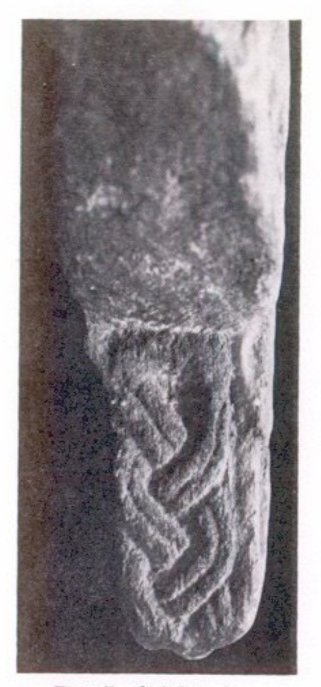
c Detail of right edge