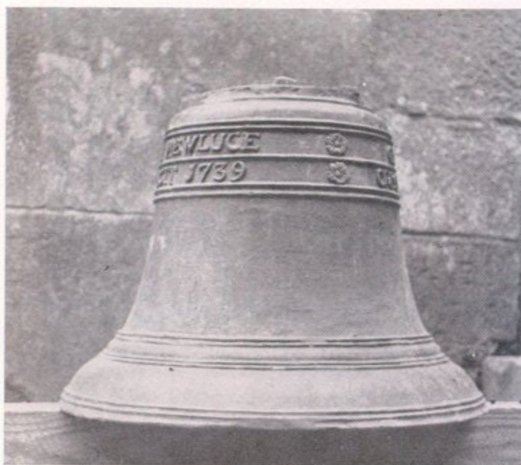
b New Luce