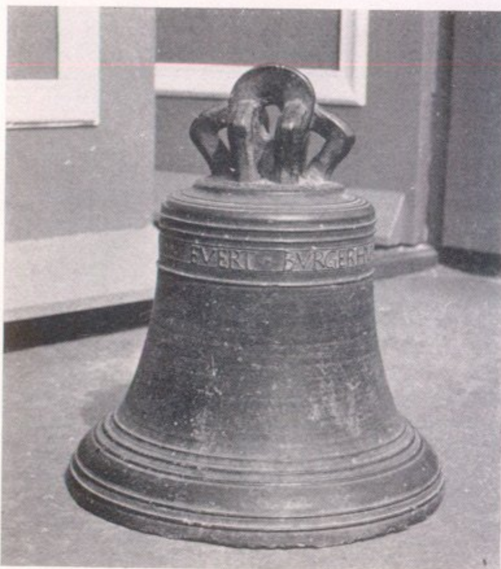
d Whithorn Priory