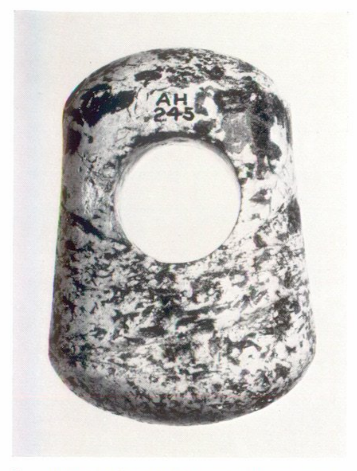
Stone mace-head from Tarbert, purchased by Museum