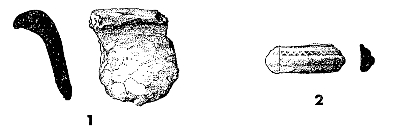
Fig. 3. Neolithic sherd (\frac{1}{2}) and bronze ring (\frac{1}{1})

finger-ring. Mr R. B. K. Stevenson of the National Museum of Antiquities examined the ring and dated it to the Iron Age, possibly first century A.D. It is badly corroded but the incised design can be clearly seen on one side. The design was made by leaving a ridge standing and then punching from alternate sides. He pointed out that this method of working can be seen on an Iron Age bowl from North Devon¹ and on the torc or girdle from Newstead.² There is also similar decoration on the spiral bronze armlets found in Scotland, as on the spiral bracelet from Culbin sands.³ Zig-zag decoration also appears on the spiral armlet from New Mains Whitekirk, East Lothian, part of an unpublished hoard of the first or second century A.D. The design itself seems to indicate an import from the south, though it was used in a modified form by native craftsmen in Scotland. The bowl can be seen in the British Museum and the other examples in the National Museum of Antiquities of Scotland.