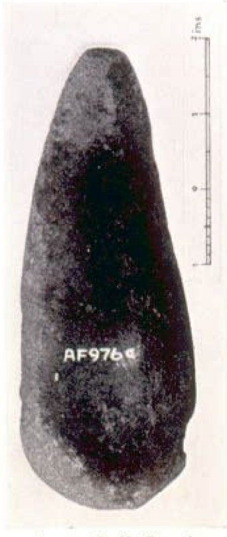
Axe: Coll, Lewis