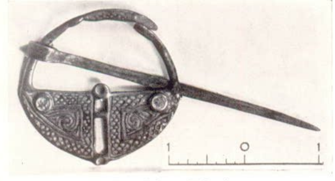
Brooch from Ireland