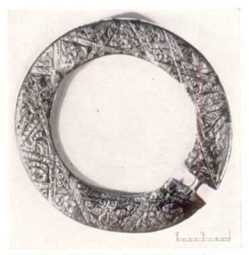
Ring brooch from Rannoch