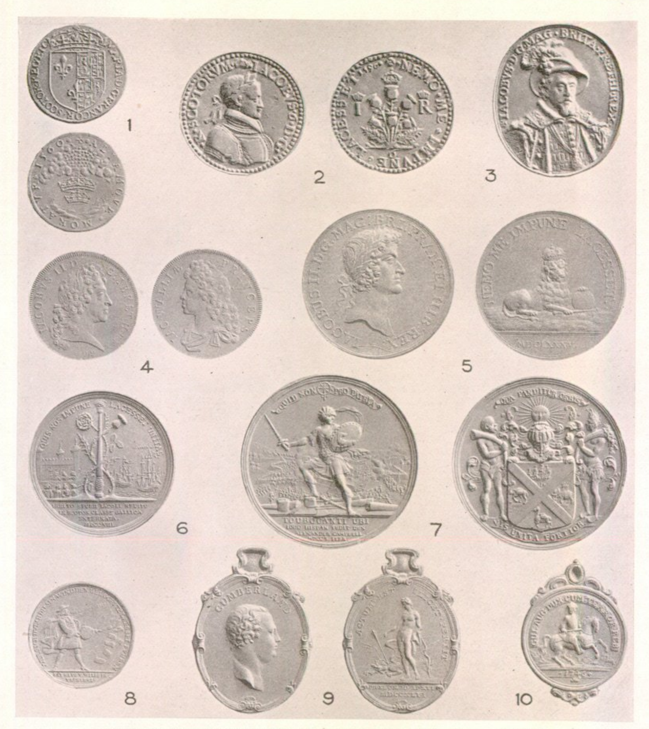
Medals purchased from Cochran-Patrick Collection. (1) (See pp. 247-8.)

1. Mary, 1560. 2. Marriage medal of James VI (gold). 3. James VI, reverse. 4. James VII and II, and Prince James, 1699. 5. Opening of Scottish Parliament, 1685. 6. Failure of Jacobite fleet, 1708. 7. Alexander Campbell captures Toubucanti, 1700. 8. John Law, Dutch satirical medal, 1720. 9–10. Culloden medals, the former by Yeo.