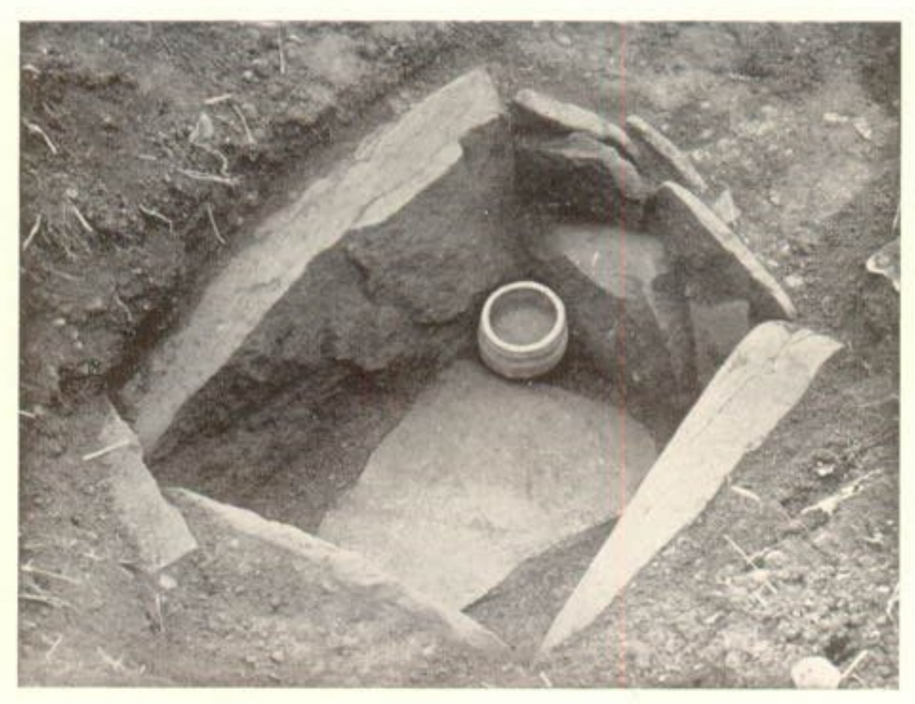
5. Cist at Knockhill, Kirkden, Angus (food-vessel replaced).