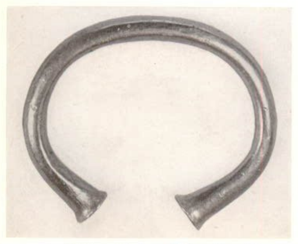
1. Gold armlet from Kirkmaiden (‡).