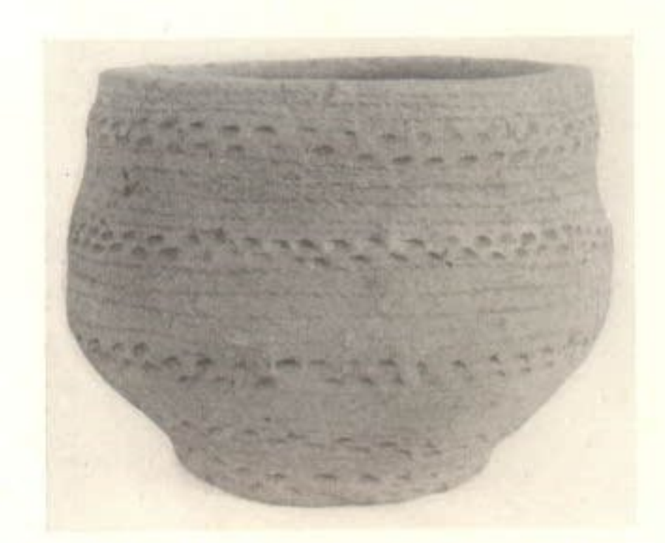
4. Food-vessel from Knockhill, Kirkden, Angus (1/3).