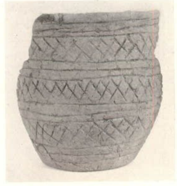
3. Beaker from Fettercairn (1/3).