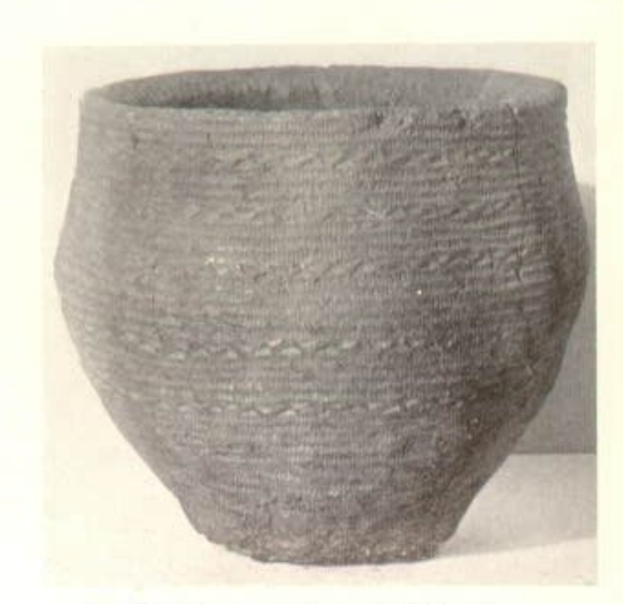
6. Food-vessel from Balbie Farm, Burntisland (1/3).