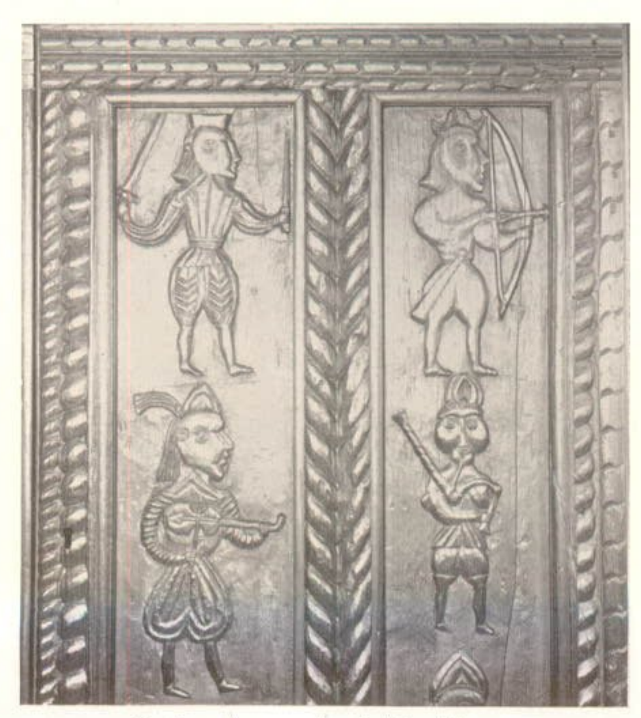
3. Greenlaw panels: detail of figures.