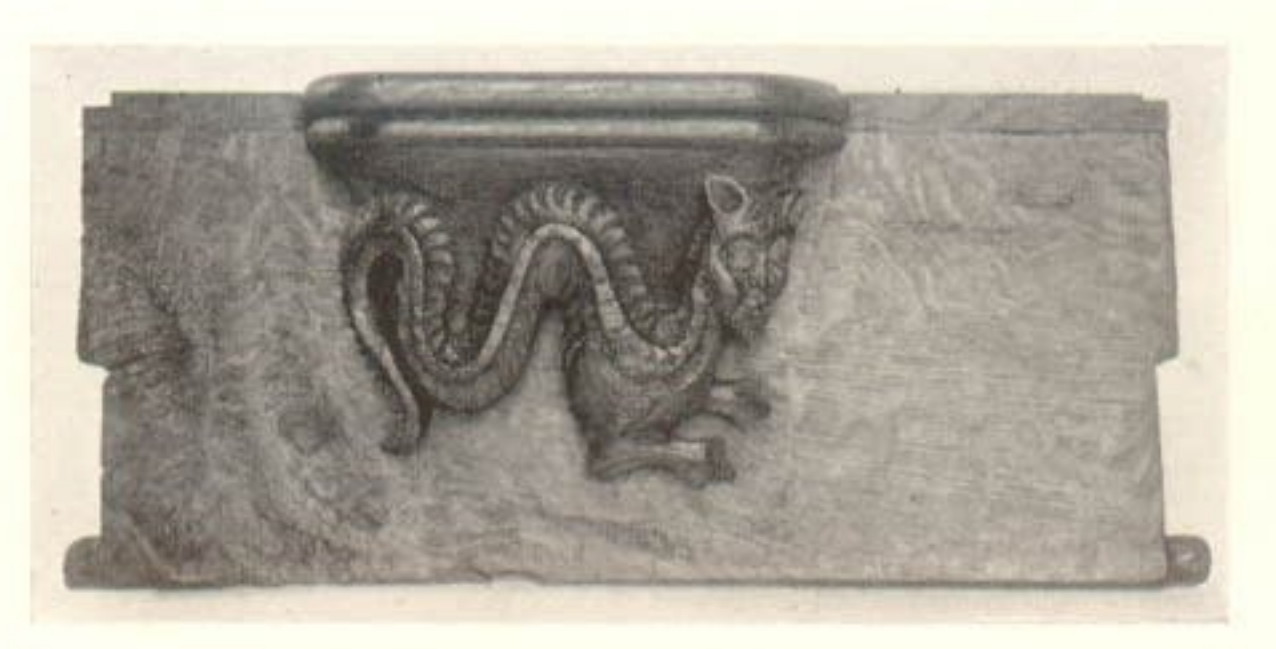
2. The Lincluden misericords.