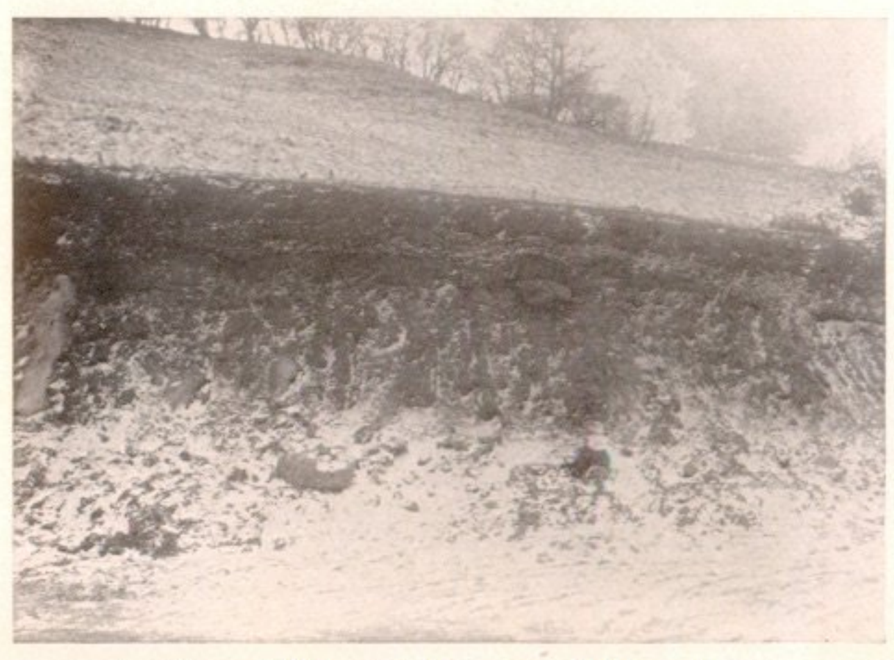
1. Polmonthill: shell-heap overriding a dune on the old beach.