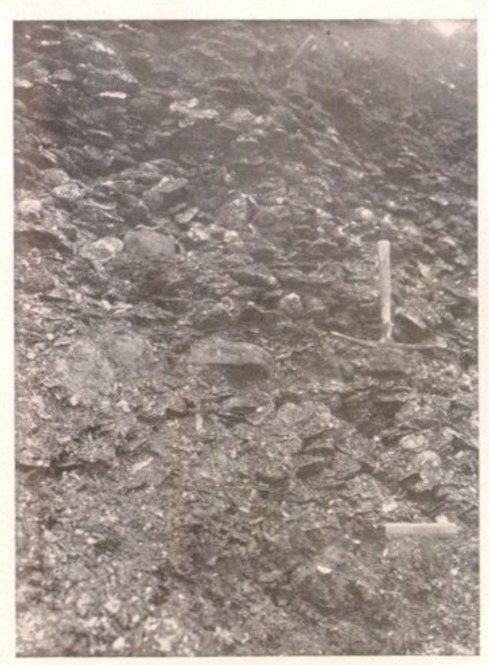
2. Superimposed hearths: the pick resting on the lowest, the trowel in the topmost; the ruler marks the base of the shell-heap.