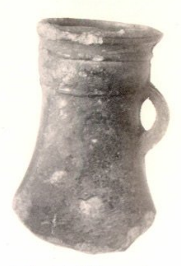
1. Socketed Bronze Axe from near Troon. (2/3.)