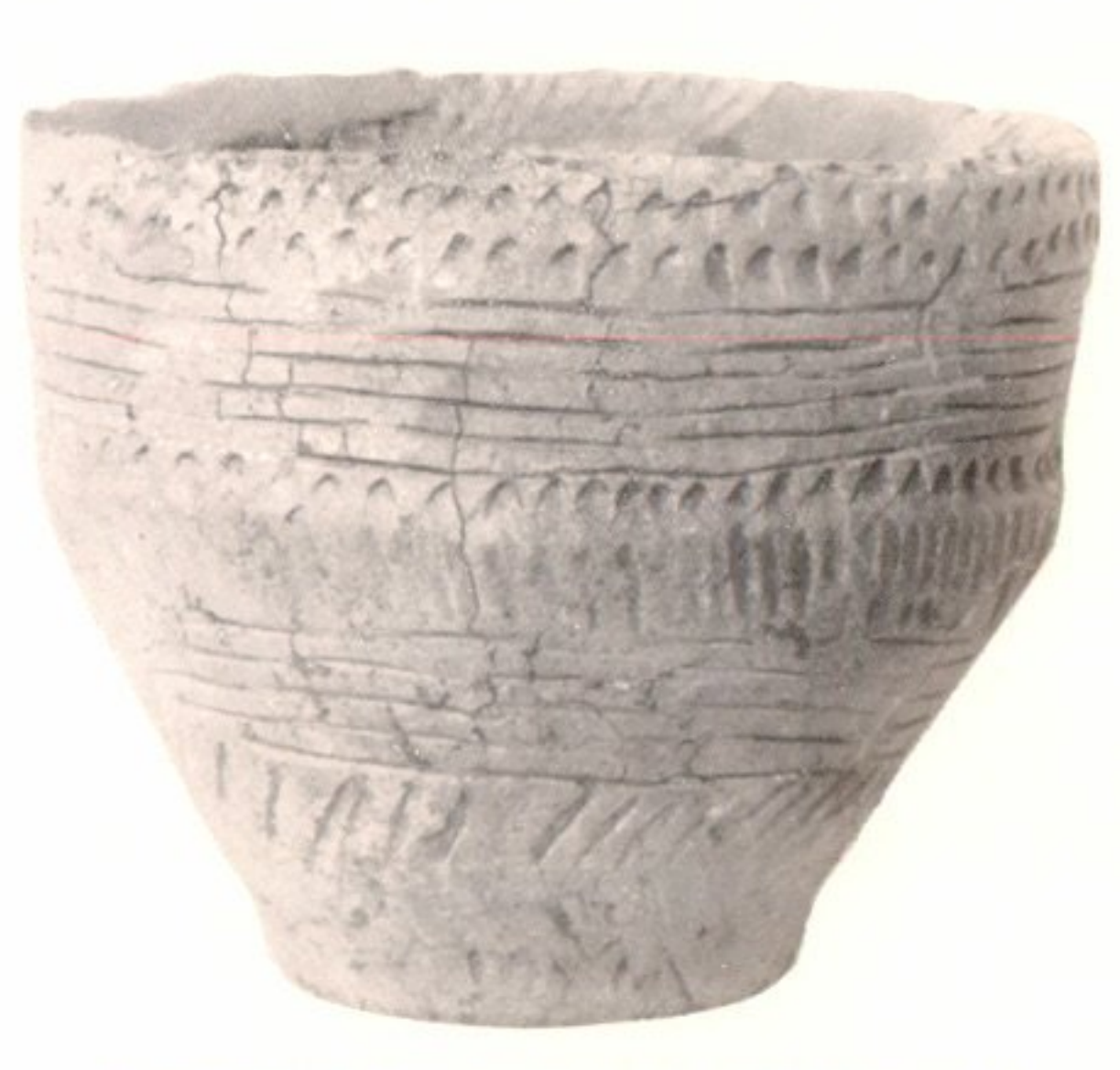
3. Food-vessel Urn from Meigle, Perthshire. (\frac{1}{2}.)