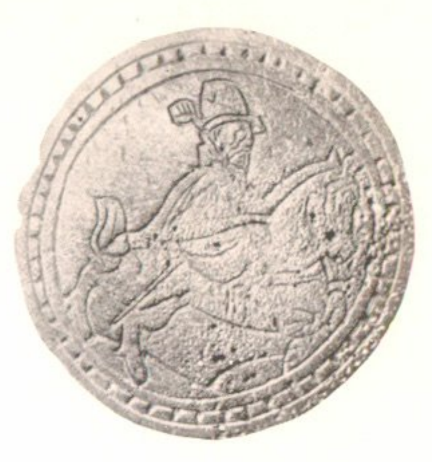
2. Bone Plaque, late sixteenth century. (†.)