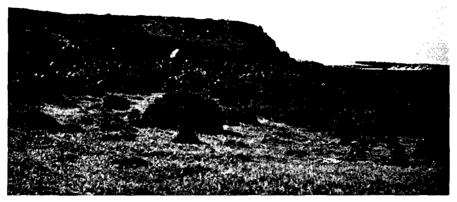
Fig. 1. Clachan Ard Fort, from the east.

In the Island of Bute, at a point nearly due north of Scalpsie Bay and about a mile distant, on a rocky cliff, there is a nearly circular structure with all the appearance of a hill fort (fig. 1). At the beginning