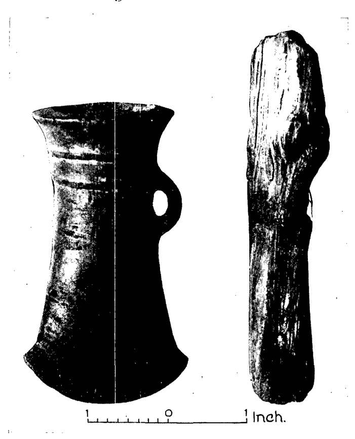
Fig. 3. Socketed Bronze Axe and part of Wooden Handle.

Wooden Spoon with a fig-shaped bowl, the handle slipped in the stalk, found in demolishing an old house in Aberdeen.