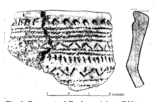
Fig. 2. Fragment of Food-vessel from Edderton.

Fragment of Food-vessel of dark brown clay (fig. 2). It has had an